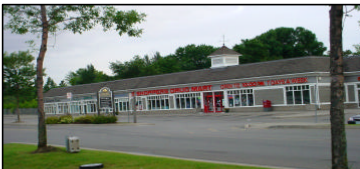
Existing Neighbourhood Centre - Credit Landing