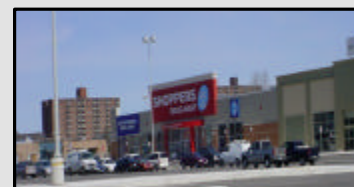
Meadowvale Town Centre Redevelopment

It is anticipated that in response to changing retail trends, many existing commercial centres will be faced with similar challenges in the coming years. Today, supermarkets, big box stores, theatres, restaurants, and traditional retail units coexist in various types of commercial centres.