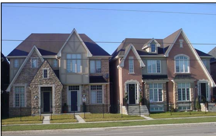
Townhouse development on Eglinton Avenue W, West of Winston Churchill Boulevard

Approximately 47% of units associated with endorsed applications are detached and semi-detached, 15% are townhouses, and 38% are apartments.