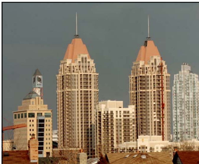
"The Capital" - thirty storey twin towers located in City Centre provide some commercial space in addition to 740 residential apartment units

Permits were issued for seven apartment buildings - four in City Centre, and one each in Hurontario, Streetsville and Port Credit Planning Districts. These permits resulted in over 1,500 apartment units or approximately 36% of all new units. Of these apartment units 1,400 units are in City Centre, representing approximately 94% of all new apartment units. One of the apartment buildings in City Centre is mixed use, providing some commercial space in addition to residential.