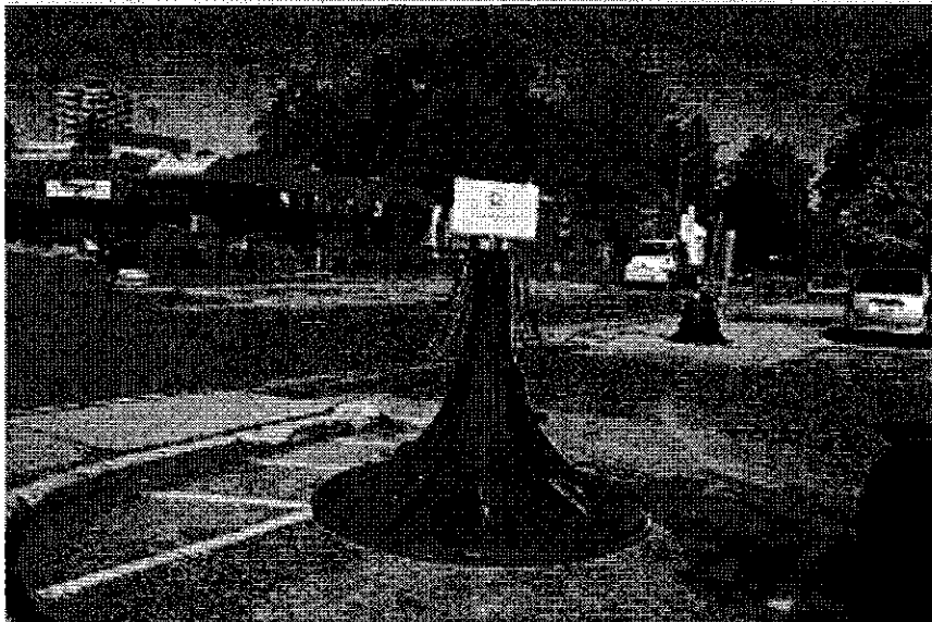
Photo of Cyclepod in Port Credit.