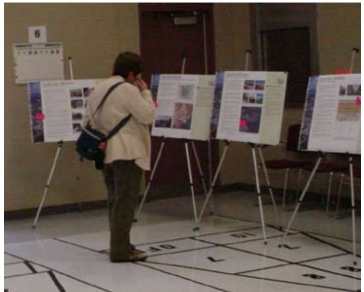
Presentation boards and comment sheets were also used to collect community feedback.