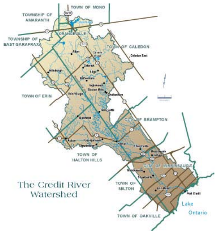
Credit Valley Conservation has jurisdiction over lands that are located within the Credit River Watershed.

Credit Valley Conservation (CVC), formed on May 13, 1954, is a partnership of the municipalities that make up the Credit River Watershed. They have been working for over 50 years to protect the natural environment. CVC is a community-based environmental organization originally formed by an Act of provincial government and dedicated to conserving, restoring, developing and managing natural resources on a watershed basis. They are mandated to ensure the conservation, restoration and responsible management of Ontario 's water, land and natural habitats through watershed based programs.