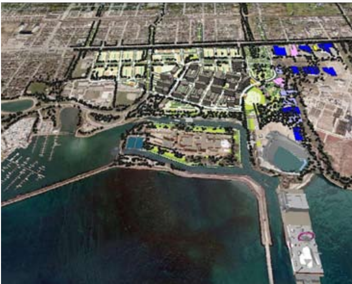
The Lakeview Ratepayers Association has been actively performing their own land use studies on lands within the district: The Lakeview Legacy Project.

Please refer to Appendix B for a summary of submission materials regarding the Lakeview Legacy Project.