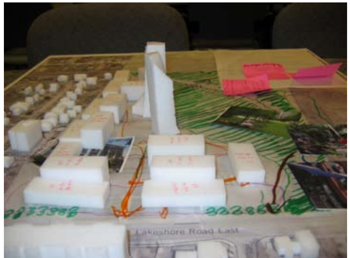
A physical model was prepared for the Inglis Site, Lakeview District.