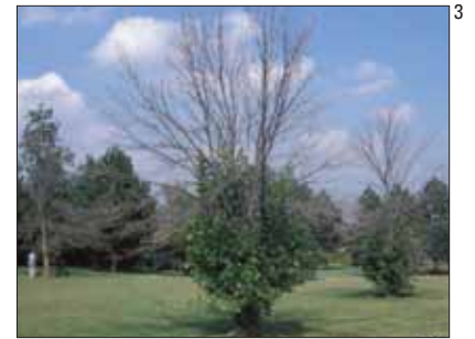
Crown dieback and epicormic shoots