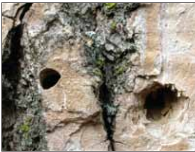
D-shaped exit holes and woodpecker damage