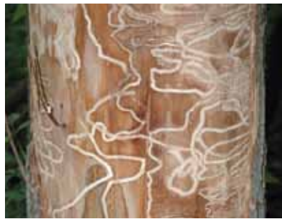
S-shaped galleries under bark