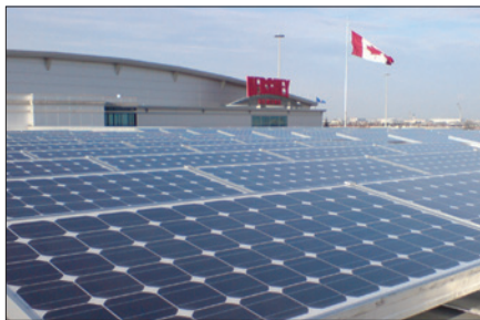
Above: Hershey Centre's solar photovoltaic power generators.

As part of the Living Green pillar in the City's new strategic plan, Mississauga will continue to lead and encourage environmentally responsible approaches, conserve, enhance and connect natural environments and promote a green culture. For more information on the City's green strategies and initiatives visit: www.mississauga.ca/portal/discover/ourfuturegreen and www.mississauga.ca/environment .