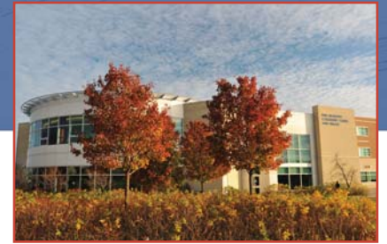
Erin Meadows Library celebrates 10th anniversary . . . Page 6.