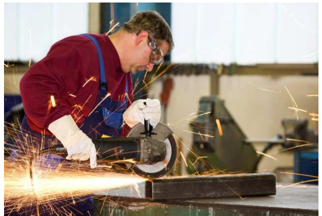
Figure 3-8: Mississauga must continue to maintain a supply of traditional employment lands to maintain current and future needs.

With a thriving and diverse economy, Mississauga boasts more than 60 “Fortune 500” companies representing a variety of employment sectors. Employment continues to remain strong, and Mississauga is expected to maintain its current role