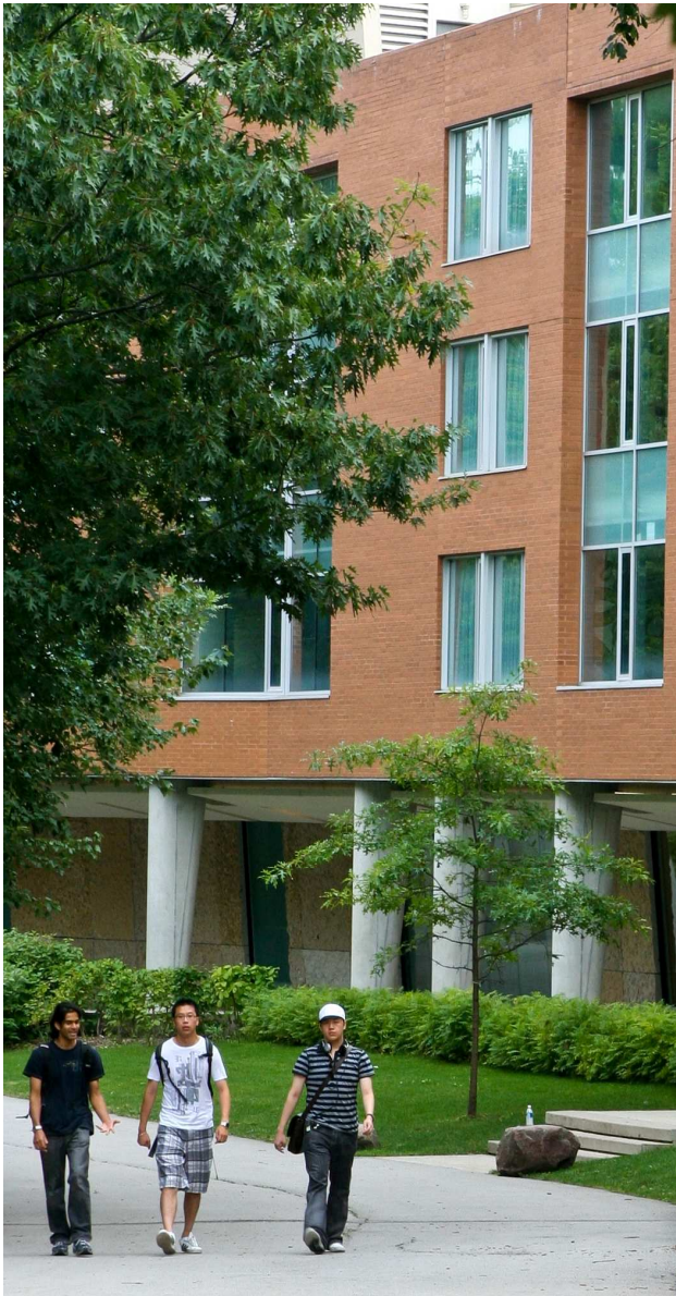
Figure 3-15: Mississauga's educational opportunities are important resources, providing talent to meet the needs of existing and future employers.

Mississauga has a progressive and diversified economy. Maintaining its current strength while further diversifying its base by affording the opportunity for people of all ages and backgrounds to thrive will be important for its future success. The City will foster innovative and creative businesses by capitalizing on a dynamic downtown, attractive corporate centres and hi-tech infrastructure, and by enabling the efficient movement of goods.