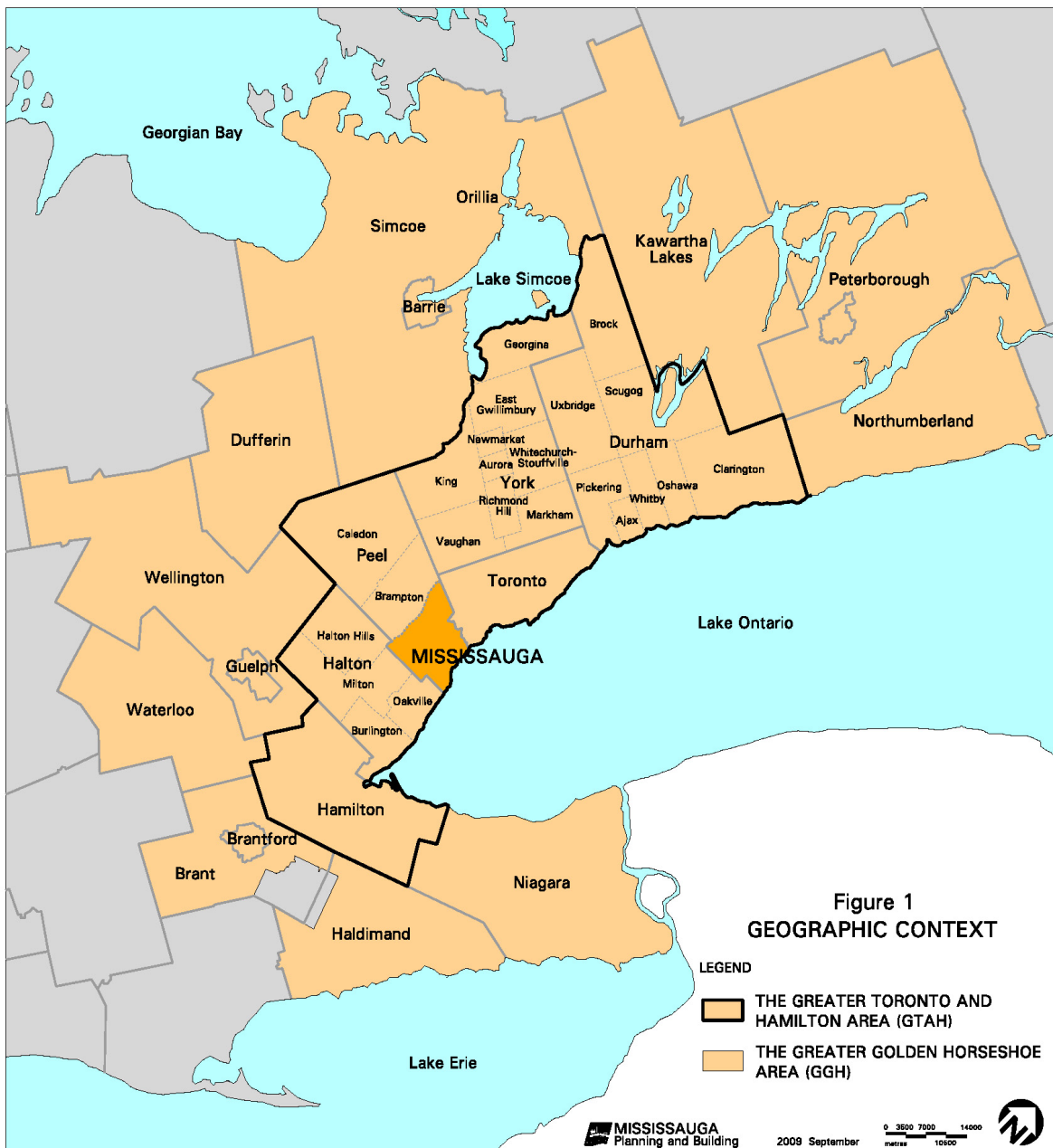
Figure 3-1: Mississauga is situated near the centre of the Greater Golden Horseshoe, one of the fastest growing regions in North America.

neighbourhoods. The City will plan for a strong, diversified economy supported by a range of mobility options and a variety of housing and community infrastructure to create distinct, complete communities. To achieve this vision the City will revitalize its infrastructure, conserve the environment and promote community participation and collaboration in its planning process.