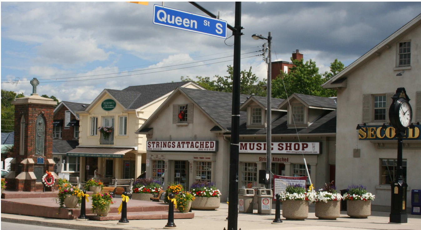
Figure 3-14: Streetsville is a vibrant mixed use community which has a rich history and a strong civic identity.