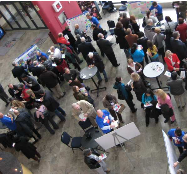
Figure 3-16: As part of the Strategic Plan public engagement process, connections were made with over 100,000 people. The Mississauga Official Plan implements the land use components of the Strategic Plan.