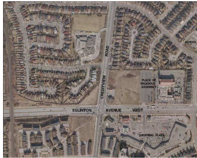
Figure 3-5: Grid roads gave way to circuitous road patterns and cul-de-sacs to discourage traffic from cutting through neighbourhoods; tall noise walls were erected along major streets to shield neighbourhoods from traffic noise.

As the population grew from 33,000 in 1951, infrastructure improvements, residential expansion, and industrial and commercial development ensued. Lands were no longer developed into small town-scaled parcels but instead large tracts of land were planned for residential and industrial subdivisions. In general, residential and industrial/employment uses were separated in the city.