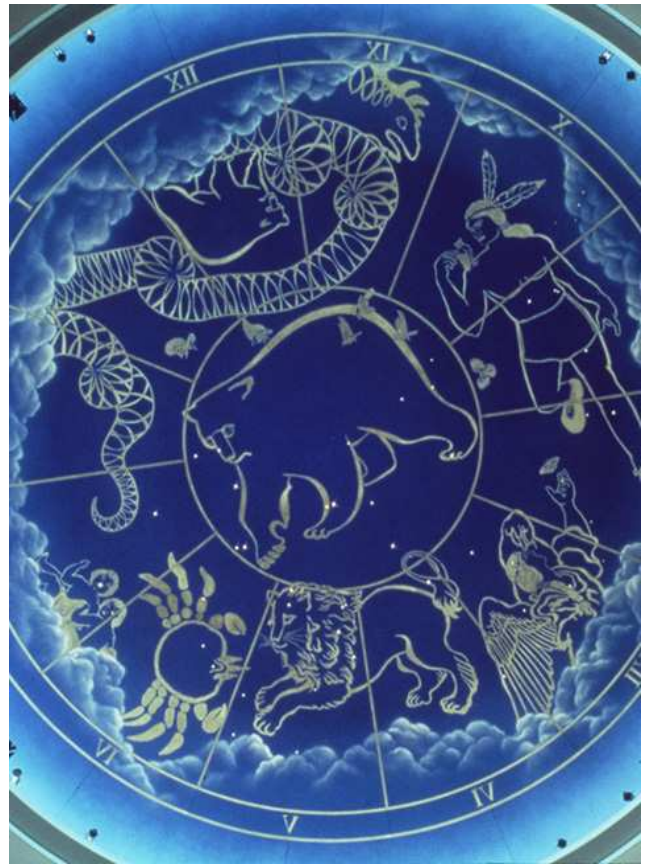
Figure 3-3: The City Council Chambers, the site of City Council meetings, has an extraordinary ceiling created by artist Sharon McCann illustrating the Ojibwa legend of the Great Bear and the Seven Hunters.

In 1820, the Crown made a second purchase and additional settlements were established. This led to