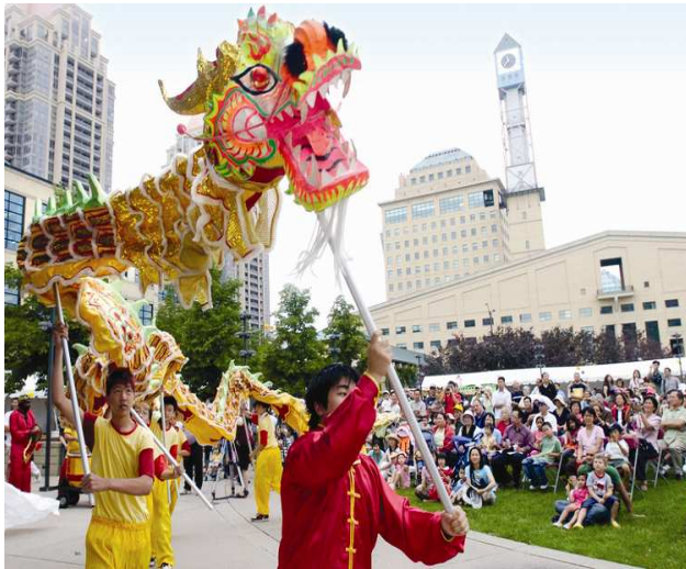
Figure 3-6: Mississauga welcomes the more than 50% of its population born outside of Canada, in many cultural festivals throughout the year.

As Canada’s sixth largest city, Mississauga has been one of the fastest growing and most economically successful cities in the country. In 1976, the city had a population of approximately 250,000 and supported more than 130,000 jobs. In 2009 these