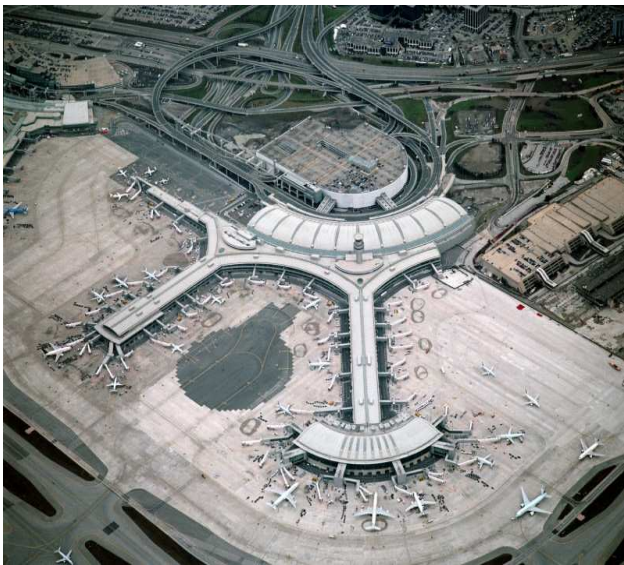
Figure 3-4: The development of the Toronto - Lester B. Pearson International Airport effectively prohibits new residential uses in the City's northeast due to requirements that sensitive land uses be distanced from higher airport noise levels. Although the airport has implications on land use it is a major transportation hub that is vital to Mississauga's economy.

In 1974, the Town of Mississauga amalgamated with Port Credit, Streetsville and portions of the Townships of Toronto and Trafalgar to form the City of Mississauga.