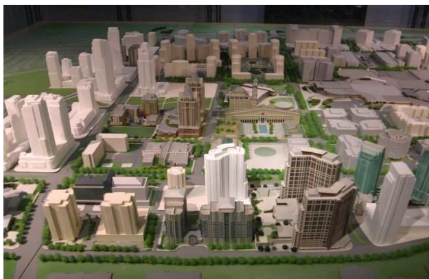
Figure 3-10: Growth will be directed to areas identified for intensification such as the downtown. The above model illustrates actual and potential development within the downtown, helping to visualize how new growth will relate to existing structures.

As Mississauga continues to evolve, growth will be strategically managed by determining the appropriate arrangement and balance of land uses, including population and employment densities. Growth will be directed to key locations to support existing and planned transit and other infrastructure investments. Growth will not be directed to areas of the city that need to be preserved and protected (e.g. stable residential areas, natural environment, heritage and cultural resources).