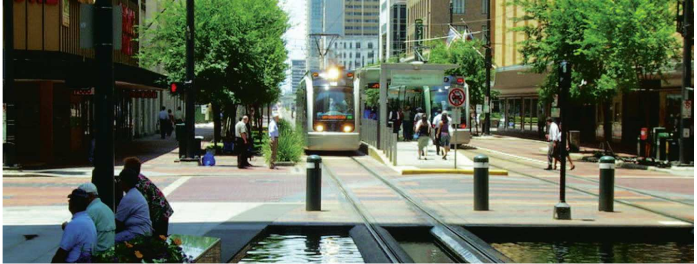
Figure 3-13: Transit and active transportation is a priority for Mississauga's urban vision. (Houston, Texas)

Mississauga will integrate land use and transportation planning and sustainable design so that new development is directed to locations that support existing and planned transit and active transportation facilities. The needs of all road users will be considered in the design and management of transportation infrastructure. To ensure that Mississauga is well-served by efficient and higher-order regional transit services, Mississauga will capitalize on provincial transit service initiatives to minimize dependency on cars for commuting.