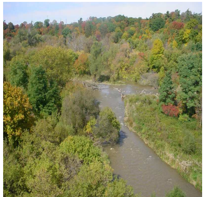
Figure 3-11: Over two-thirds of Riverwood Park's 60+ ha, located on the scenic east bank of the Credit River, will be preserved to provide and protect the habitat for over 359 species of native plants and 46 species of birds and animals.

Mississauga has natural areas of exceptional beauty and quality. Mississauga will serve as a steward of