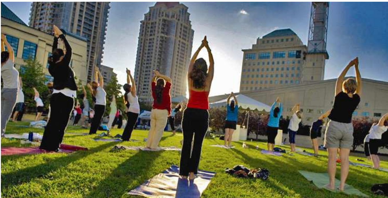
Figure 3-12: Complete communities preserve historic and cultural resources and support artistic expression and individual community designs that promote healthy lifestyles.