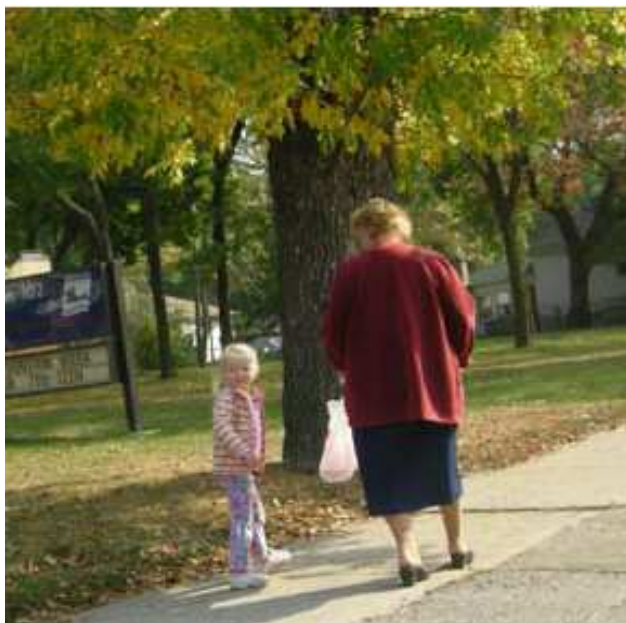
Figure 3-9: Mississauga is home to residents of all ages who thrive in their communities.

Mississauga's Official Plan has been prepared to assist in the implementation of the long-term vision formulated through a comprehensive public engagement process known as "Our Future Mississauga – Be Part of the Conversation" that