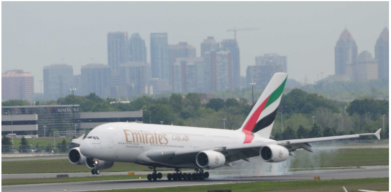
Figure 7-12: The Airport supports the local and regional economy and is a significant component in the city's transportation network.

7.9.2 Mississauga will support goods movement access to the Airport to promote the Airport as a key goods movement hub.