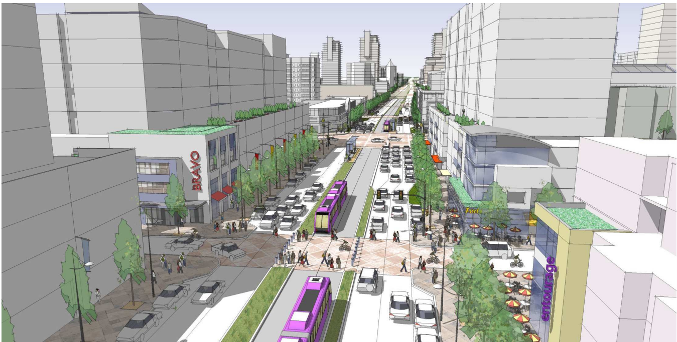
Figure 7-2: Higher order transit is proposed along Hurontario Street and will complement intensification. The illustration shows the City's vision for higher order transit along Hurontario Street.

Improving connections from surrounding areas to Intensification Areas will also be a priority. These connections will focus on increasing opportunities