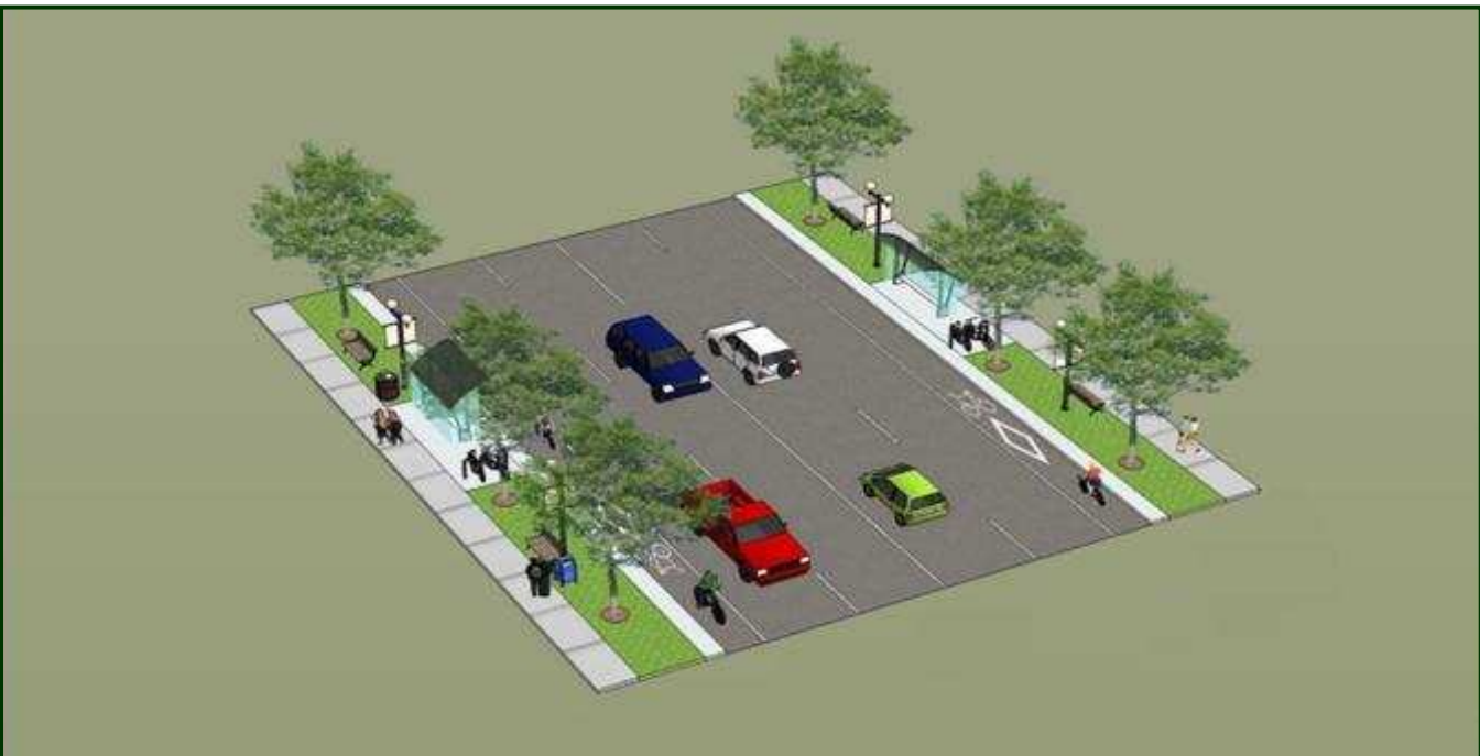
Figure 7-3: The ability to create multi-modal roadways will be influenced by right-of-way widths. Wider rights-of-way will allow for dedicated space for different transportation modes, however, where rights-of-way are narrower transportation modes will need to share space.