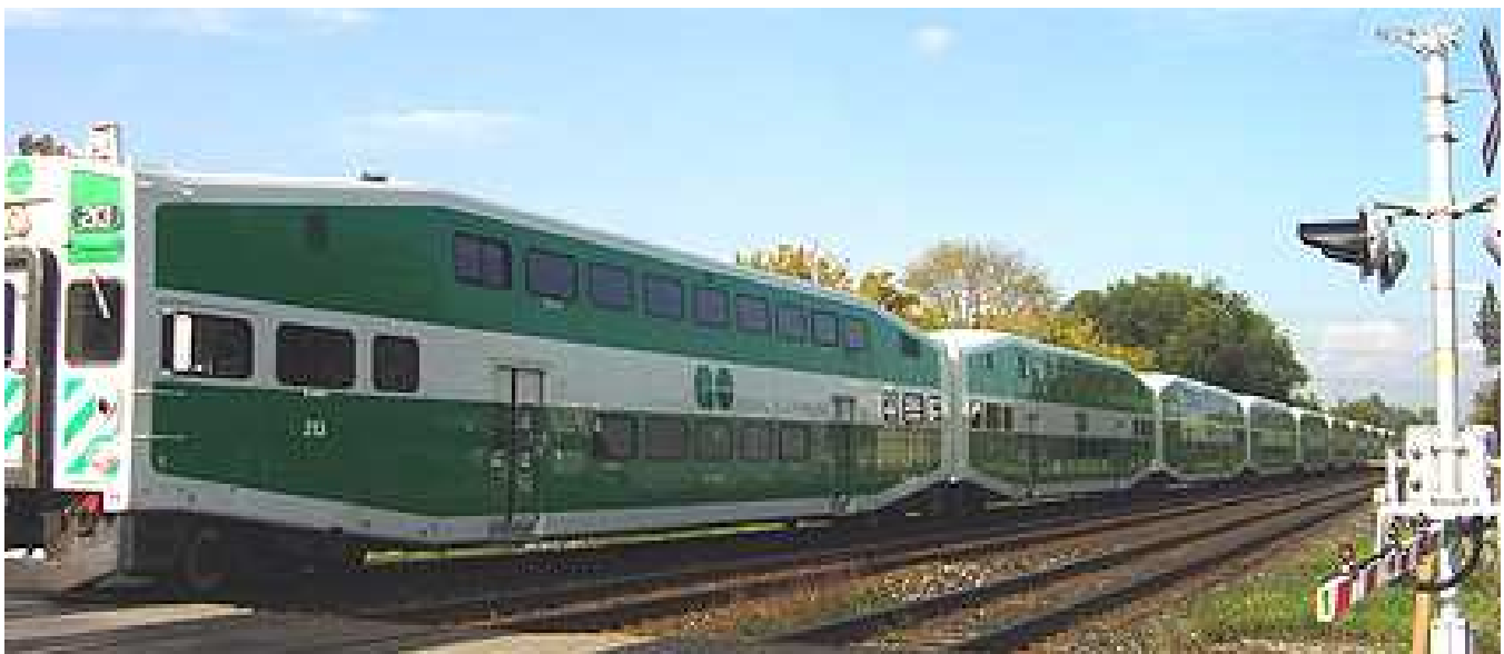
Figure 7-11: The rail corridors in Mississauga are shared by both freight and passenger trains, such as the GO train depicted above. The City recognizes these corridors as assets in the transportation system.

7.8.2 Mississauga will cooperate with other levels of government and the railway companies in locating, planning, and designing new freight and passenger terminals, to ensure that such facilities are compatible with the transportation network and land use.