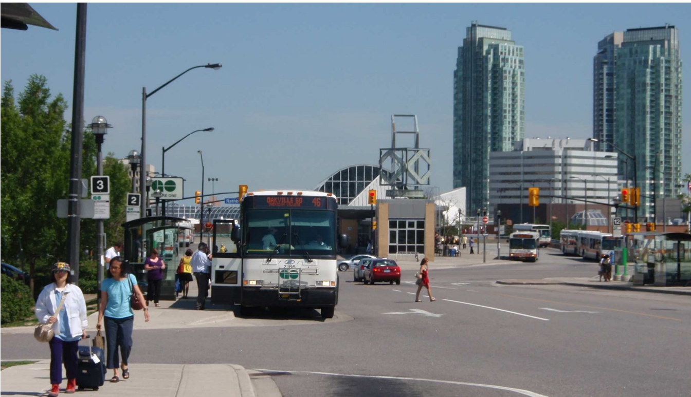
Figure 7-9: The Downtown Core Mobility Hub is an example of where people can live, work, shop and recreate in a mixed-use environment supported by transit.