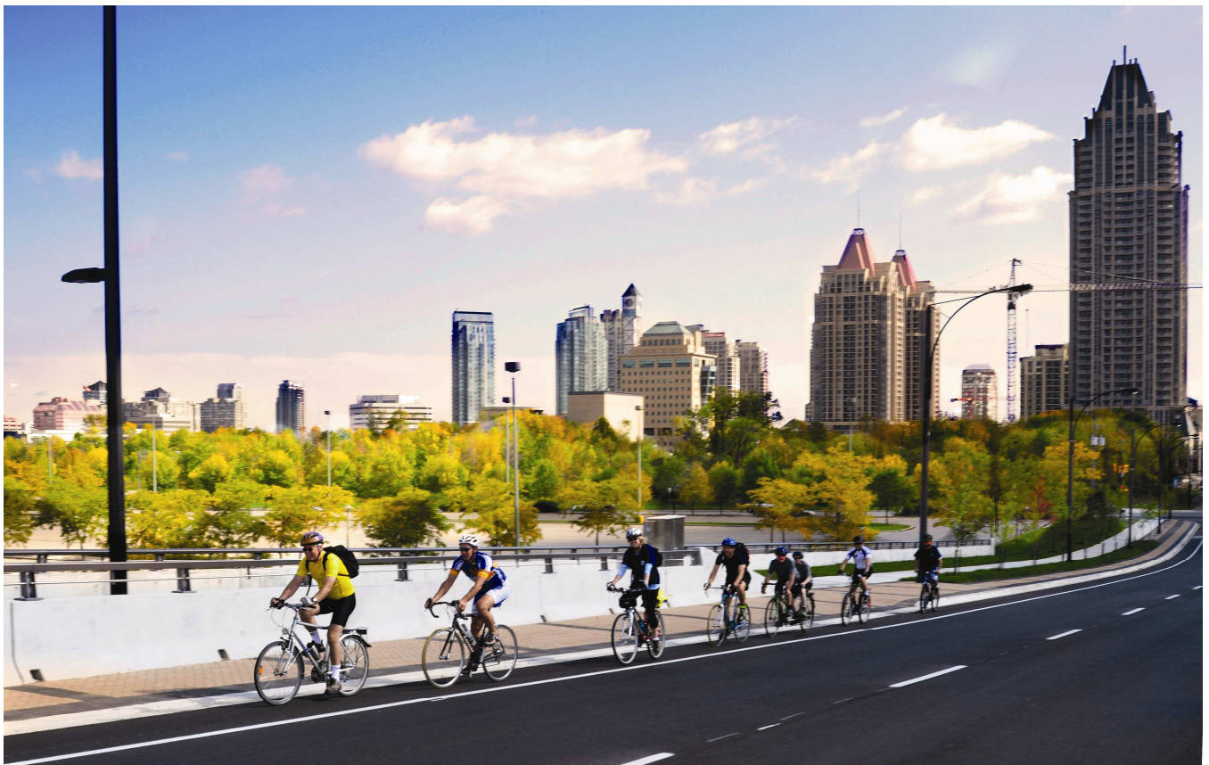
Figure 7-1: Mississauga promotes a range of transportation modes. In addition to providing for the car, facilities for transit, cycling, and walking are a priority. Promoting a range of transportation choices will be particularly important in areas where intensification is encouraged, such as in the Downtown.

Mississauga is evolving from a city that has a suburban, vehicle-oriented built form to a more urban municipality. The transformation of the transportation system to meet the needs of the future is not without significant challenge. Mississauga's transportation infrastructure, which is largely built and relatively new, was designed around a grid of widely spaced major roads designed to move large volumes of vehicles efficiently. Within