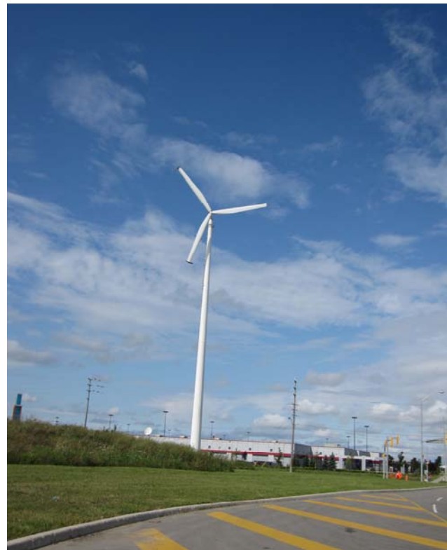
Figure 10-11: A 31 m wind turbine unveiled at the Lisgar GO Station in April 2009, generates as much as 80 per cent of the station's power. The site, located at Tenth Line and Argentia Road, was chosen for the wind turbine because of heavy prevailing winds from the west and its open fields.

10.7.7 Mississauga will promote public awareness and education initiatives jointly with other levels of