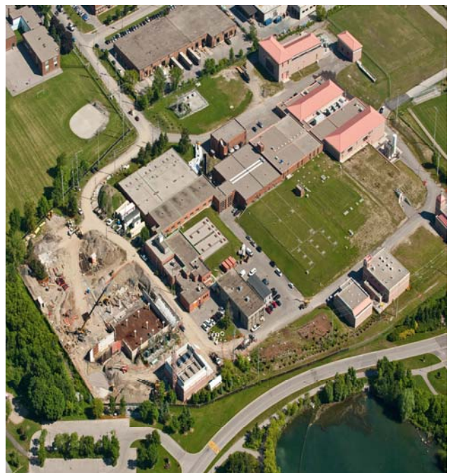
Figure 10-8: The 27 hectare Lakeview Water Treatment Facility is located on the shore of Lake Ontario in Mississauga and is operated by the Region. The Region has identified the need for a capacity expansion of the facility as a result of increased growth to serve the eastern part of Peel and to meet servicing requirements in York Region. The expansion of the Lakeview plant will increase capacity to produce 1 150 million litres of water per day.

10.6.6 Where possible, the existing conditions should be augmented by the re-establishment of native vegetation and the preservation of existing landforms, vegetation and drainage patterns. Where possible, at-source controls should be provided to reduce the need for new infrastructure. All efforts to this effect should be guided by the appropriate environmental agencies, according to all Provincial