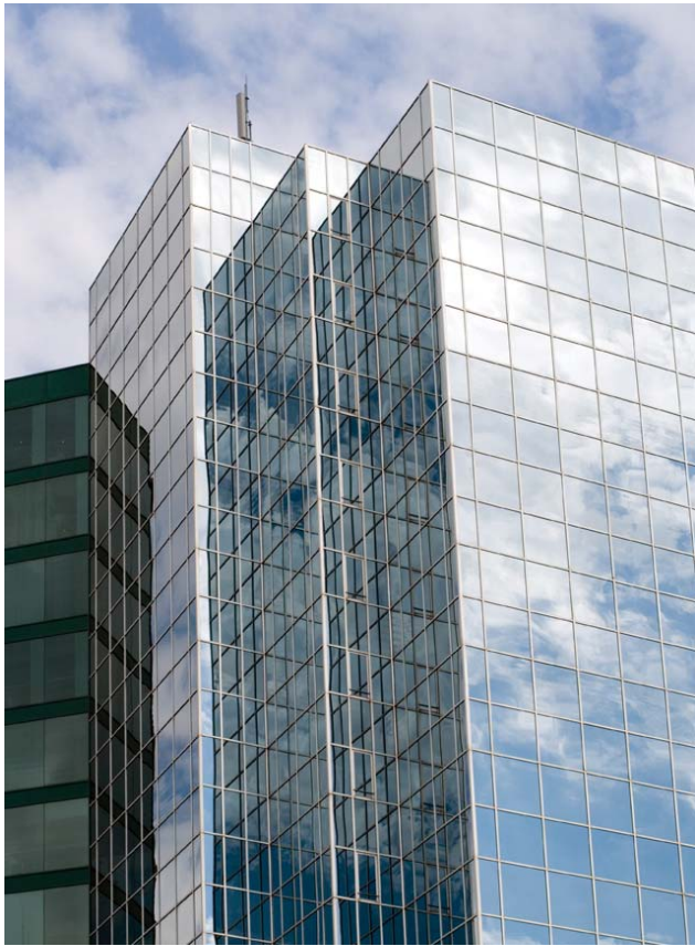
Figure 10-4: Over the years Mississauga has been able to attract many diverse businesses. Many of these offices have concentrated in the city's Corporate Centres, Employment Areas and Downtown. In the future, the City will promote increased office use and activity within the Downtown.

10.2.3 Outside of Employment Areas, Secondary office development will be encouraged to locate within Community Nodes and Major Transit Station Areas .