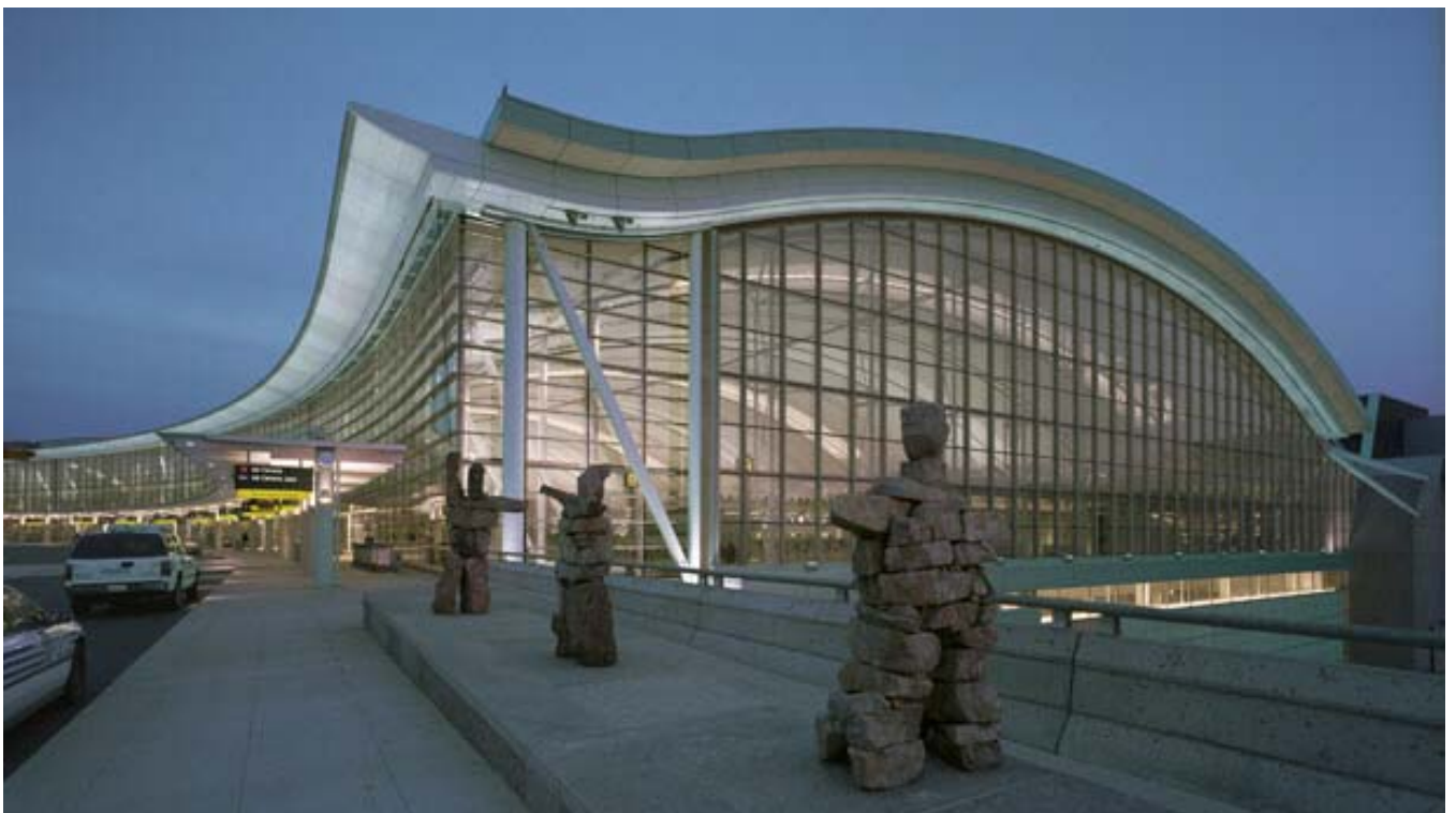
Figure 10-1: There are over 420,000 employment opportunities in Mississauga providing jobs for local as well as regional residents. While the largest concentration of these employment opportunities is in the northeast quadrant of the city at the Airport and surrounding lands, Mississauga has a number of other thriving employment areas. Mississauga has been highly successful in attracting office employment and over the last 25 years the city has developed an average of approximately one million square feet of office space annually. (Robert Speck Parkway Business Area, Hewlett-Packard Building, Airport -Terminal 1)