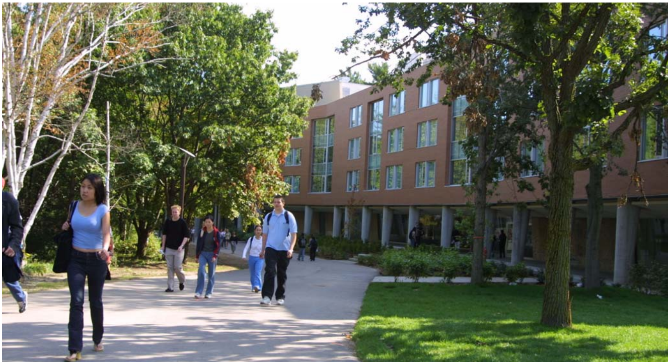
Figure 10-7: The University of Toronto Mississauga (UTM) has greatly expanded over the past few years. The university has built additional educational, recreational and housing structures for student use. Mississauga looks forward to working with other universities and colleges, who choose to locate within the city, to create new campuses with similar amenities as UTM.

Post-secondary institutions can attract and support the growth of strong, innovative businesses, and further the needs and interests of youth, older adults and recent immigrants to Mississauga. Improved transit facilities and providing for a range of suitable, affordable housing choices are key to attracting new post secondary schools, colleges and universities to Mississauga.