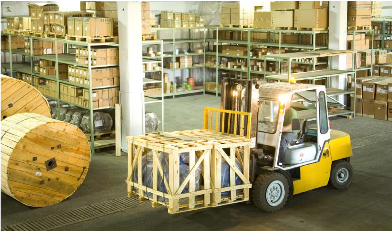
Figure 10-5: Mississauga is home to many warehousing and distribution centres, providing many employment opportunities within the city. These types of uses, along with other industrial uses, are best served by locating within Employment Areas away from sensitive land uses.