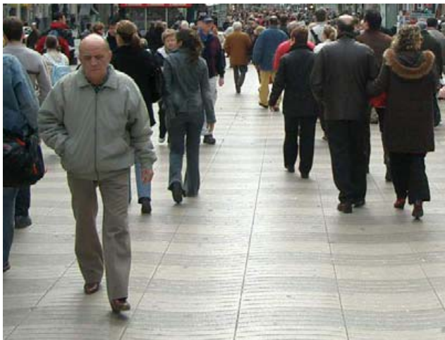
Figure 10-2: Retaining areas for employment purposes is vital to the health and competitiveness of the city. As the city's population grows through intensification and redevelopment, it will be critical to maintain the existing employment base and to provide opportunities for future employment.

Mississauga is home to a well educated labour force. Ensuring that residents have access to opportunities to develop the skills and knowledge needed to meet the needs of the business community is critical to the city's continued economic success. Mississauga is home to The University of Toronto Mississauga and the Sheridan College campus in the Downtown. In addition to these post-secondary institutions, the City promotes the establishment of new universities and colleges so that local students have a variety of learning opportunities within their community. This will also attract new residents to the city to further their education, retain youth and encourage partnerships between academic institutions and businesses.