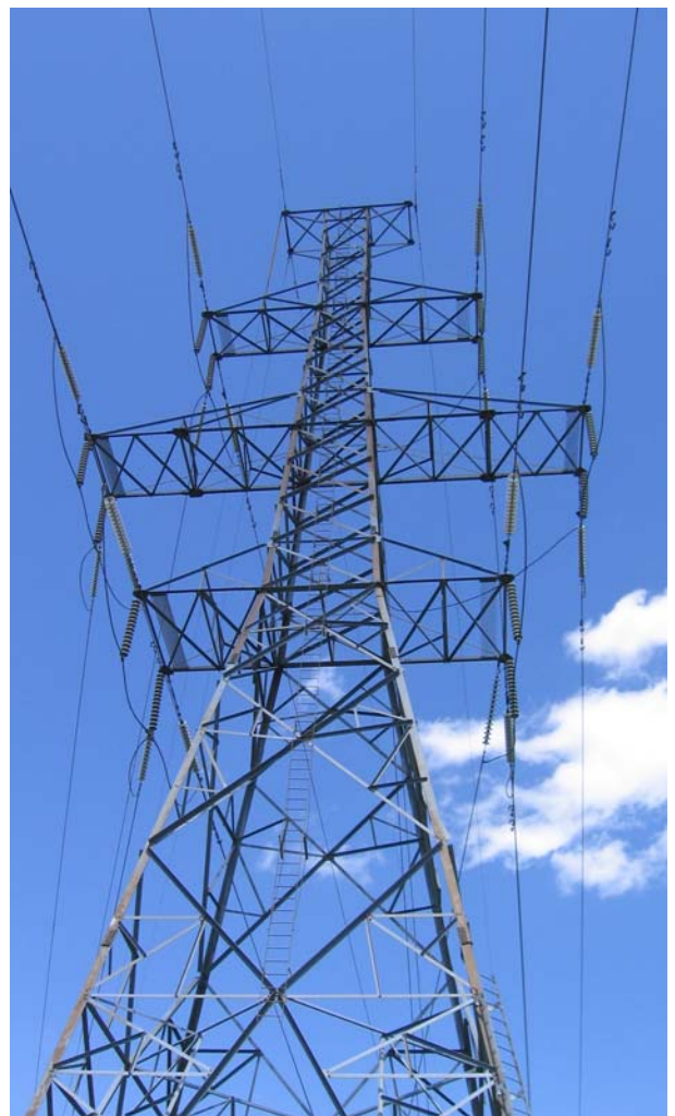
Figure 10-10: Mississauga Official Plan provides opportunities for power generation and distribution facilities situated in appropriate locations.

Energy efficiency and improved air quality through land use, development patterns and efficient transportation, are important for the health of