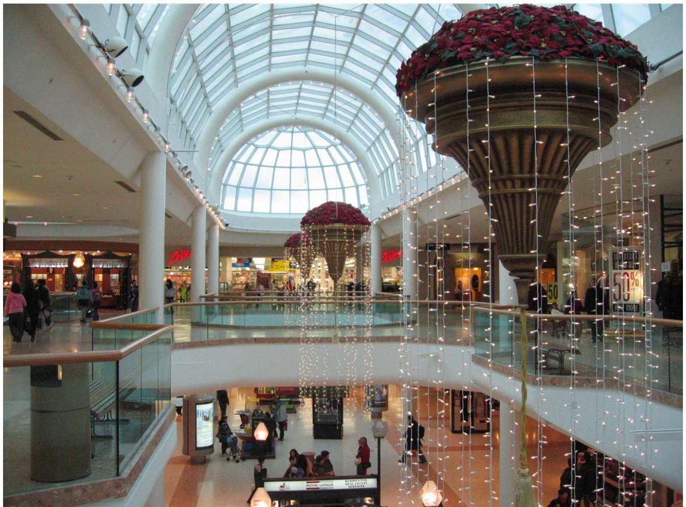
Figure 10-6: Commercial uses are a staple for everyday living. These uses will be concentrated in the Downtown, Major Nodes and Community Nodes. Some retail services will be provided in Neighbourhoods. Not only is the location of commercial uses important in servicing residents, but the scale and design of these structures is important in creating a comfortable sense of place where people want to gather.

While Employment Areas have a number of existing retail areas, they are not the preferred location for this type of use. Existing designated retail areas will be recognized by this Plan and further development of retail uses within the limits of land designated Mixed Use is permitted, however, their expansion and the establishment of new major retail areas will not be allowed. Existing retail areas will be encouraged to redevelop to appropriate non-retail employment uses.