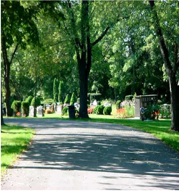
Figure 6-12: Cemeteries are permitted within Public Open Space and Private Open Space. Cemeteries are serene places for remembrance. Some cemeteries also include passive amenities such as sitting areas and trails. (Streetsville Public Cemetery)