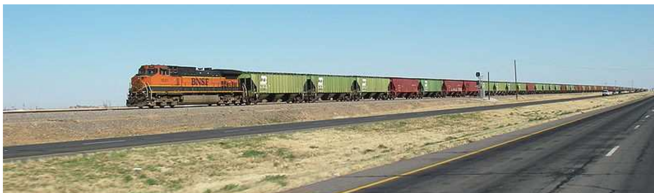
Figure 6-20: Railways, while a vital part of transportation system and economy, can pose noise, vibration and safety concerns.

6.9.4.1 Where residential and other land uses sensitive to noise are proposed in close proximity to rail lines, it may be necessary to mitigate noise impacts, in part by way of the subdivision design. A Noise Impact Study will be submitted prior to approval in principle of such lands located within 100 m of a Principal Main Rail Line right-of-way or within 50 m of a Secondary Main Rail Line. Residential development or any development that includes outdoor, passive and recreational areas will generally not be permitted in locations where the mitigated outdoor noise levels are forecast to exceed the limits specified in Appendix G: Outdoor and Indoor Sound Level Limits - Road and Rail, by five dB A or more. A detailed noise study will be required to demonstrate that every effort has been made to achieve the outdoor sound level criteria specified in Appendix G: Outdoor and Indoor Sound Level Limits - Road and Rail, and the noise study shall prove to the satisfaction of the City that the noise level in the outdoor living area, after applying