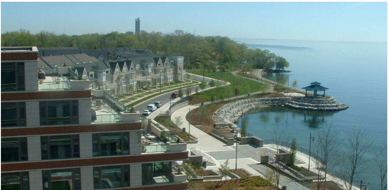
Figure 6-17: As Mississauga matures and builds out the last of its greenfields, brownfields will become a major component of future development. An example of a successful brownfield development is the former St. Lawrence Starch plant (originally established in 1889) located in Port Credit.

6.7.1 To ensure that contaminated sites are identified and appropriately addressed by the proponent of development, the following will be required: