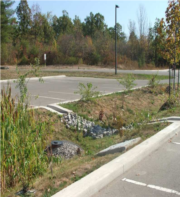
Figure 6-16: The drainage for the parking area at Riverwood has been designed to mimic natural ecological functions such as water infiltration and purification. The runoff from this bio-swale outlets to a small wetland feature on the park site.

6.5.2.1 Mississauga will use a water balance approach in the management of stormwater by encouraging and supporting measures and activities that reduce stormwater runoff, improve water quality, promote evapotranspiration and infiltration, and reduce erosion using stormwater best management practices.