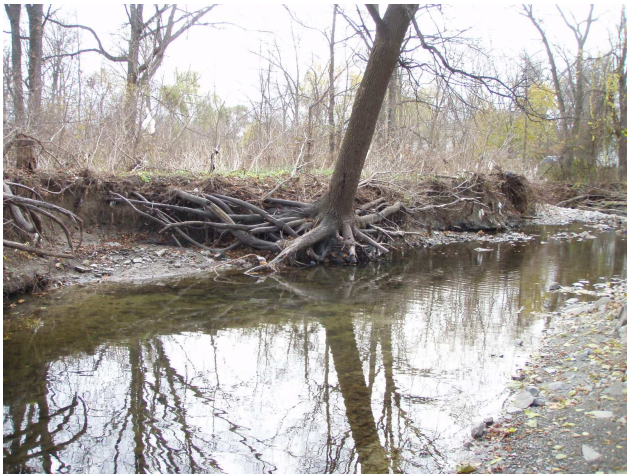
Figure 6-10: Erosion can result in serious danger to property, people, water resources, vegetation and infrastructure. Adherence to development standards and policies reduces these dangers and protects life and property.

of vegetation compromises the Natural Areas System and Urban Forest. Eroded soils compromise the functionality of key infrastructure such as sewers and ditches, thereby increasing the frequency and severity of flooding. In addition, soil erosion, due to wind, causes dust and particulate matter, which affects human health.