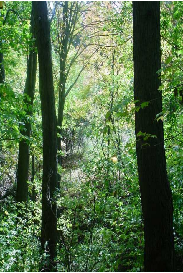
Figure 6-14: All trees and woodlands make up Mississauga’s Urban Forest. Trees and woodlands play an important role in climate moderation, air and water quality, erosion control, providing wildlife habitat and have a significant role in reducing air temperature in the city.