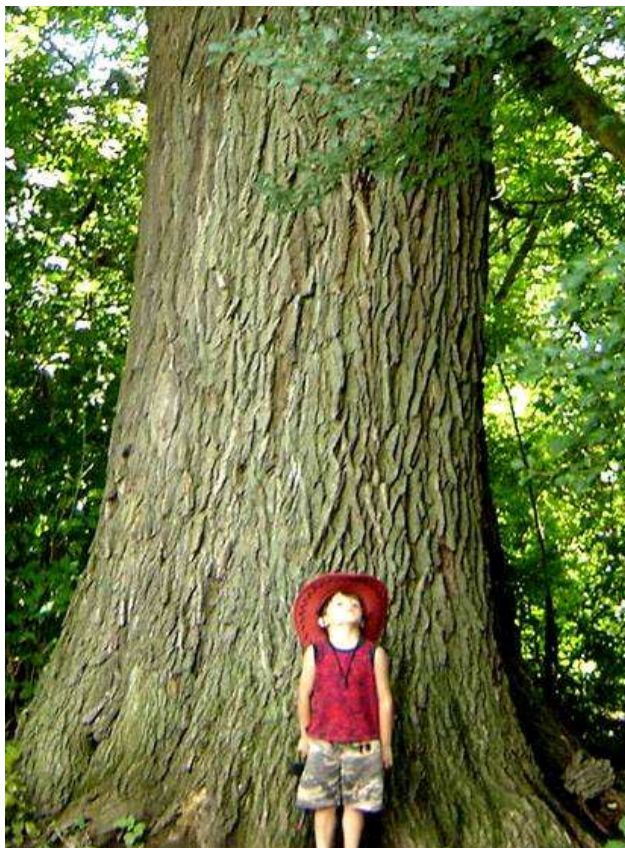
Figure 6-2: Mississauga's natural areas and their ecological functions will be preserved and enhanced, and natural resources managed wisely, so that current and future generations enjoy a healthy and safe environment.

There are many opportunities for all lands within the city to contribute to the health of the natural environment. The Green System in Mississauga, consisting of the Natural Areas System, Natural Hazard Lands and parks and open spaces contribute to a valuable natural environment in the city. These areas provide habitats for flora and fauna to thrive and locations for residents, employees and visitors to recreate and enjoy nature. The Urban Forest, comprising trees on public and private properties in the city, also contributes to a healthy and sustainable city, and should be protected and enhanced where possible.