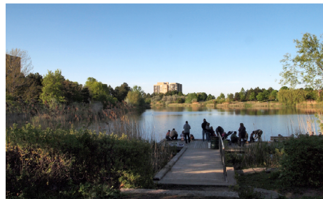
Figure 6-13: Mississauga has more than 480 parks and woodlands, these include parks for active recreational uses, while others include naturalized areas that are to be preserved and enhanced. Open spaces are fundamental to the Green System as they provide not only a recreational use but also social, educational and utility services. (Lake Aquitaine)

6.3.3.15 Where Public Open Space contains or abuts the Natural Areas System, the policies for the Natural Areas System will apply.