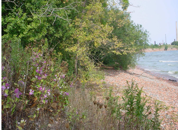
Figure 6-15: Mississauga is fortunate to be located on the shore of Lake Ontario, part of the largest system of freshwater lakes in the world. The Great Lakes and their watersheds make up one of Canada's richest and most biologically diverse regions, home to a huge variety of fish, wildlife and plant species.