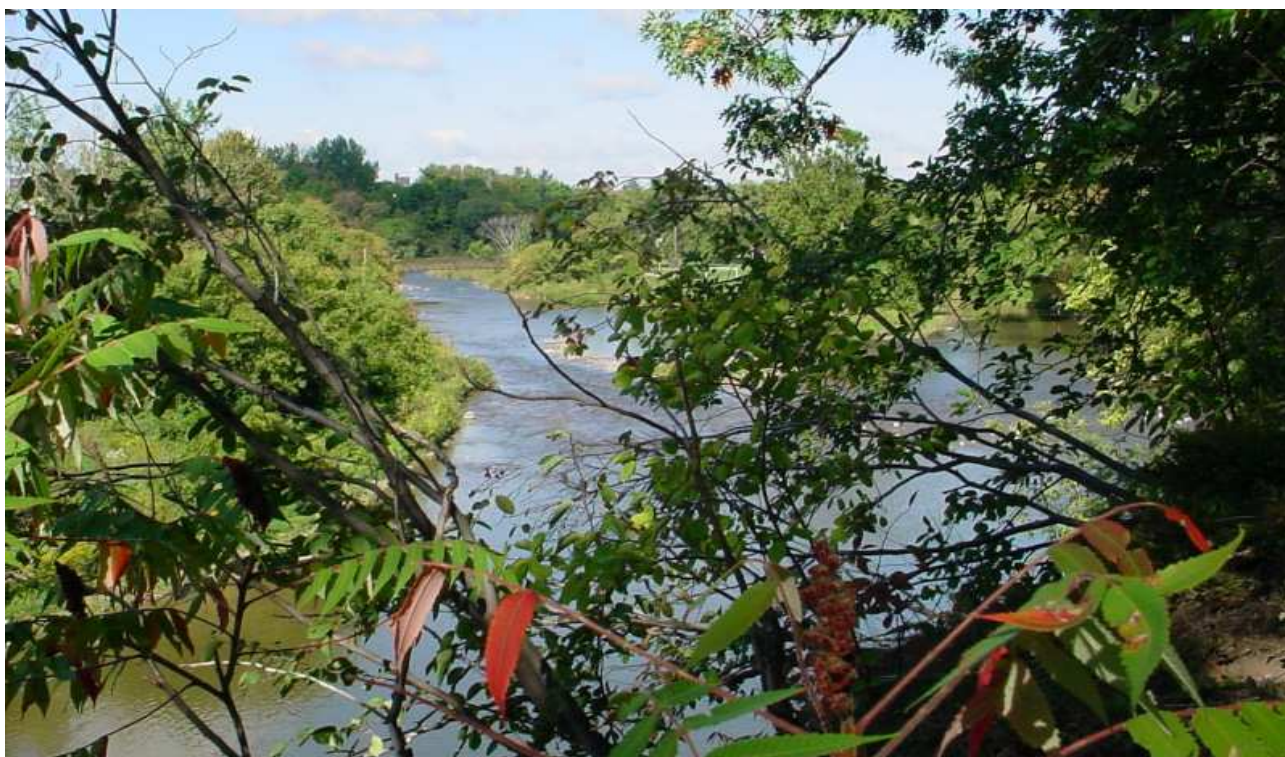
Figure 6-6: Historically, agricultural practices and land development have resulted in displacement and fragmentation of much of the natural environment. The Credit River Valley corridor is a major component of Mississauga's Natural Areas System, containing the majority of the city's natural areas.