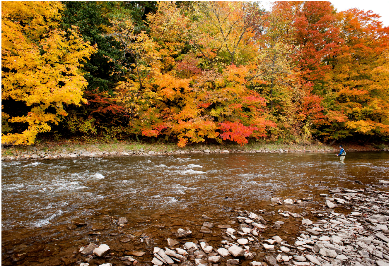
Figure 6-1: As an environmentally responsible community, Mississauga is committed to environmental protection, conducting its corporate operations in an environmentally responsible manner and promoting awareness of environmental policies, issues and initiatives. Residents and businesses have a large role to play to help protect and enhance the land, air, water and energy resources that are enjoyed by all in the city. (Credit River Valley)

the city. Living green involves implementing measures that are sensitive to, and complement, the natural environment. As the city continues to grow, it is imperative that growth does not compromise the natural environment, including the climate. The health of the natural environment is critical to human and economic vitality and the overall well-being of society. It provides the fundamental necessities of life – clean air, land and water – and is an essential component of the fabric and character of communities. Further, climate change affects land use policies and transportation choices that can contribute to improving the quality of the environment and lead to developing a sustainable city. These policies are the subject of this chapter.