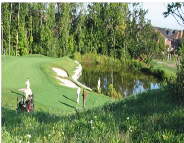
Figure 6-5: Mississauga’s parks, green spaces, recreation areas and natural areas make up the majority of the city’s Green System. In addition to its recreational use, the BraeBen Golf Course, built on the former Britannia landfill site, provides natural habitat through the design of landscaping and water features.

Parks and Open Space within the Green System, as shown on Schedule 4, have primary uses such as recreational, educational, cultural and utility services.