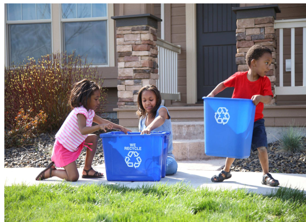
Figure 6-18: Recycling has become a part of our daily living. Promoting the reduction, re-use and recycling of waste is a priority in Mississauga.

The Region is responsible for the collection, processing, transfer and safe disposal of waste generated by residential uses. The collection and transportation of non-residential waste to waste disposal facilities operated by the Region is the responsibility of non-residential users.