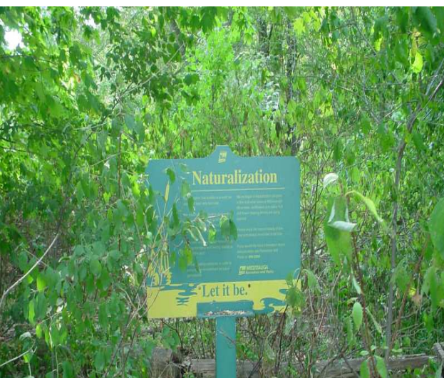
Figure 6-7: Mississauga promotes and is proactive in the management of its natural areas and the protection of its ecological functions.

6.3.1.2 Linkages are areas that serve to link two or more of the components of the Natural Areas System within the city, or to natural areas outside of the city boundaries. Linkages include, but are not