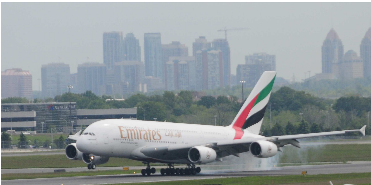
Figure 8-12: The Airport supports the local and regional economy and is a significant component in the city's transportation network.

8.9.2 Mississauga will support goods movement access to the Airport to promote the Airport as a key goods movement hub.