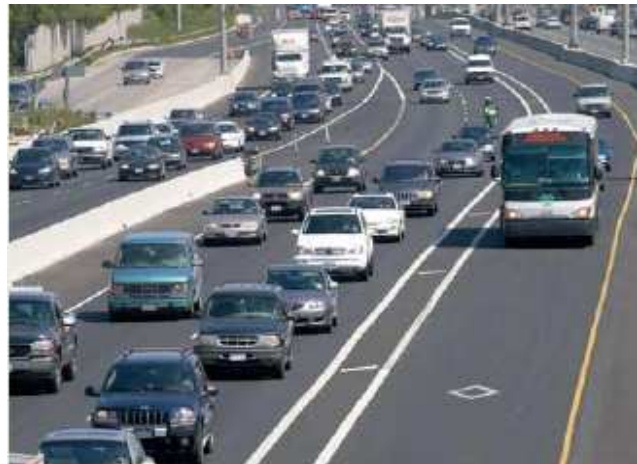
Figure 8-8: High Occupancy Vehicle (HOV) lanes such as those on Highway 403, encourage people to carpool or take transit.

Transportation Demand Management (TDM) measures encourage people to take fewer and shorter vehicle trips to support transit and active transportation choices, enhance public health and reduce harmful environmental impacts. TDM is