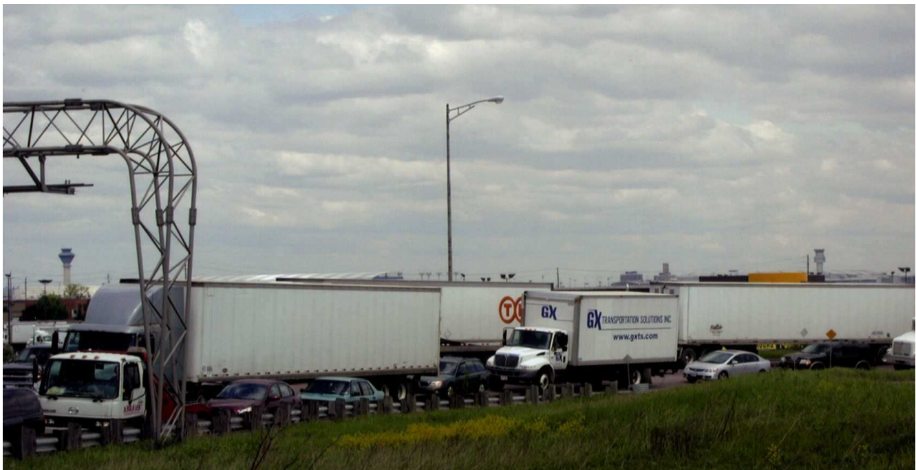
Figure 8-10: Several 400 series highways and major roads traverse Mississauga and support the many businesses reliant on efficient goods movement.

8.7.3 Mississauga will encourage strategic linkages to inter-modal facilities and 400 series highways to facilitate the efficient movement of goods.