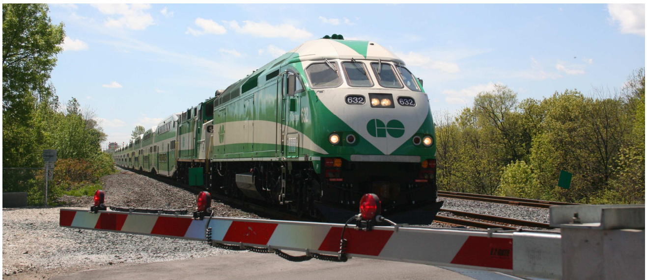
Figure 8-11: The rail corridors in Mississauga are shared by both freight and passenger trains, such as the GO train depicted above. The City recognizes these corridors as assets in the transportation system.

Passenger and freight rail services are an important element of the transportation system for Mississauga and the surrounding region.