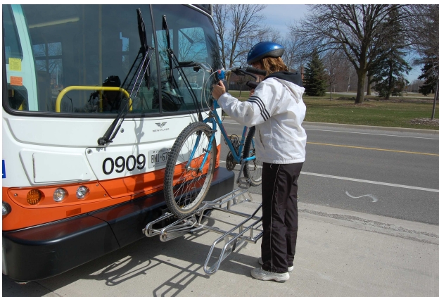
Figure 8-6: People often use multiple modes of transportation in their daily commute. Supplying bike racks on buses is one example of how Mississauga supports cycling.

8.2.4.8 Mississauga will provide pedestrian connections to Intensification Areas.