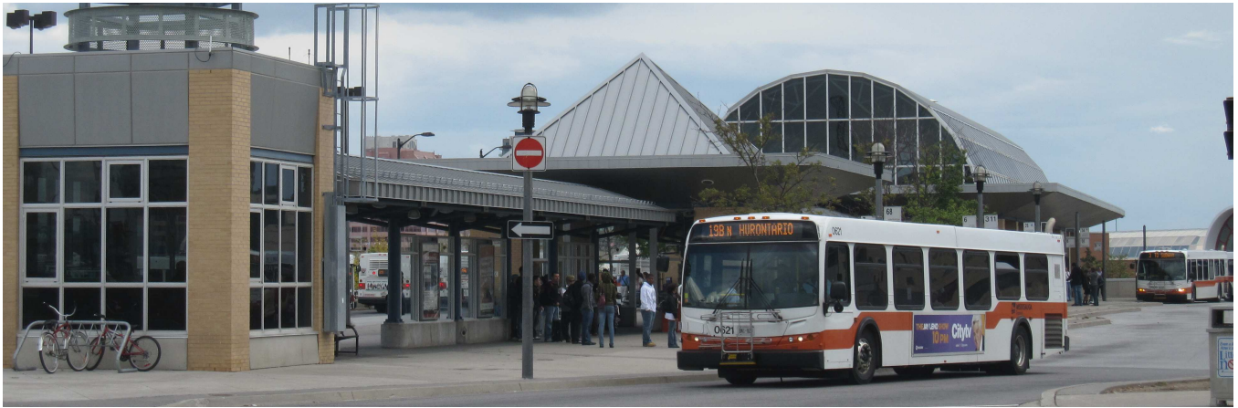
Figure 8-5: Various transportation forms exist within the city. The transit network is extensive and serves the large resident population and employment base, as well as those passing through the city.

routes, which are connected at key transit terminals and commuter rail stations.