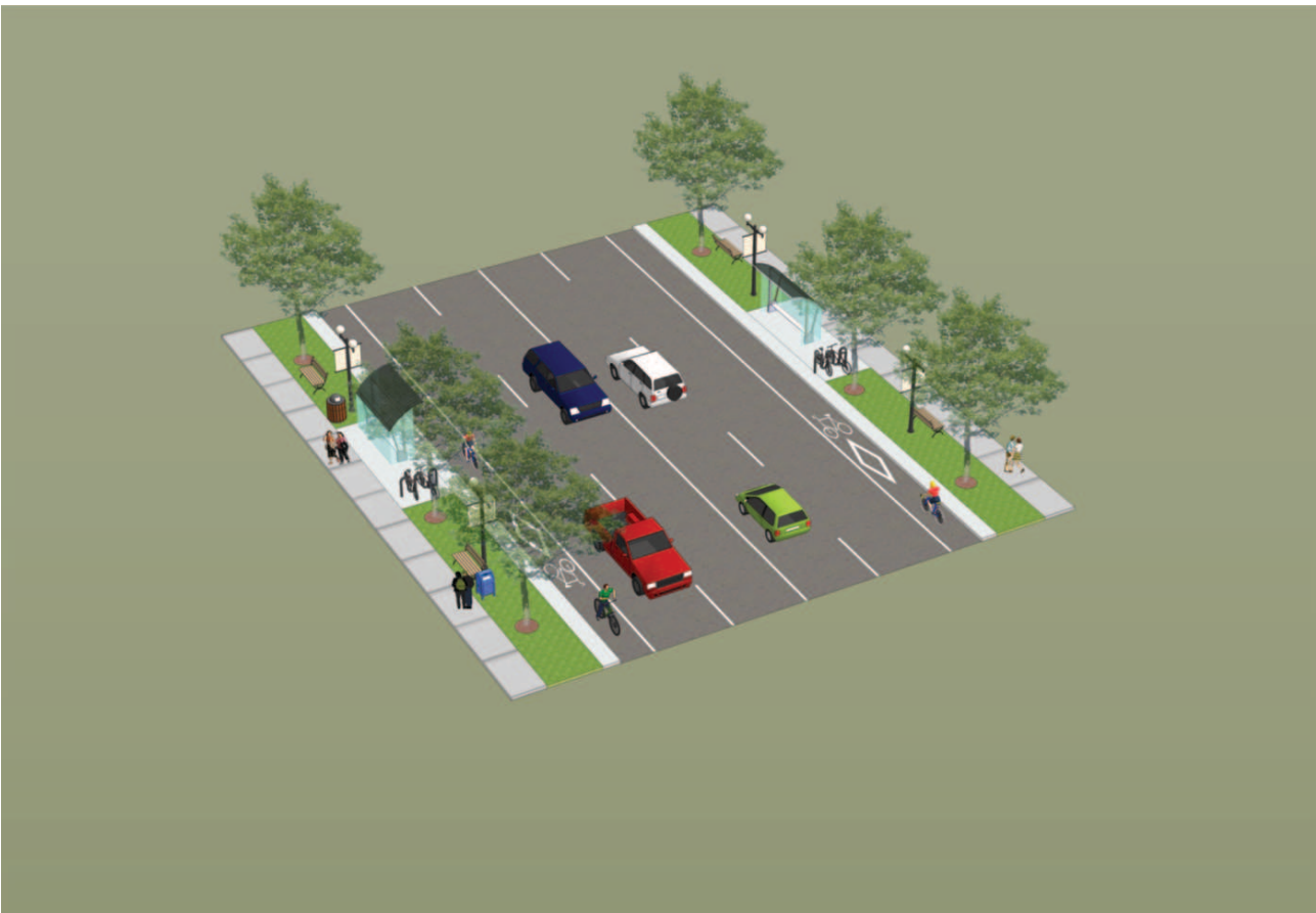
Figure 8-3: The ability to create multi-modal roadways will be influenced by right-of-way widths. Wider rights-of-way will allow for dedicated space for different transportation modes, however, where rights-of-way are narrower transportation modes will need to share space.