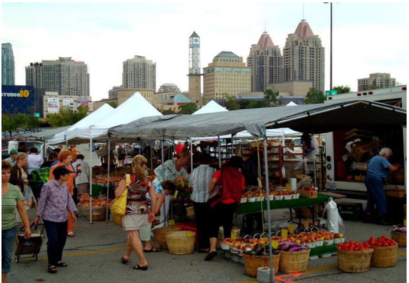
Figure 1-1: Formed in 1974, Mississauga is recognized as Canada's sixth largest city and Ontario's third largest city, with a population of over 730,000 residents representing cultures from around the world. Mississauga has many attractions and events that run at various times throughout the year. The Downtown is a central spot for activities, including the Farmers' Market.

The City is required to review the Official Plan on a regular basis, as directed by the Planning Act . The