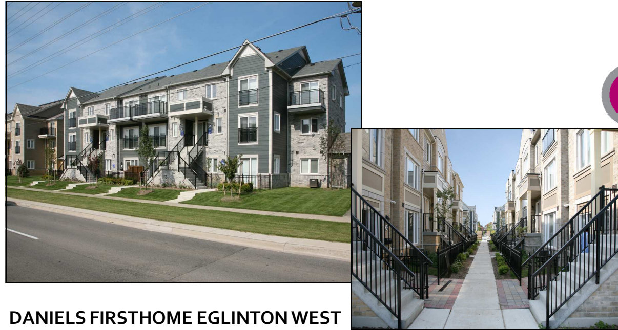
DANIELS FIRSHTHOM EGLINTON WEST

Location: 5005 Oscar Peterson Blvd. Owner: Daniels Corporation PSCP #858 Consultants: Graziani + Corazza Architects LandArtDesign, Landscape Architect Inc.