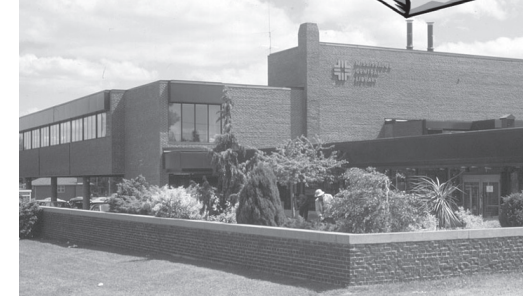
Central Library, 1991-2011