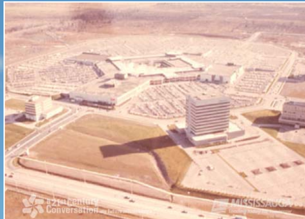
City Centre 1973