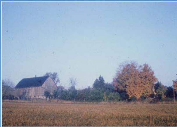
City Centre 1960