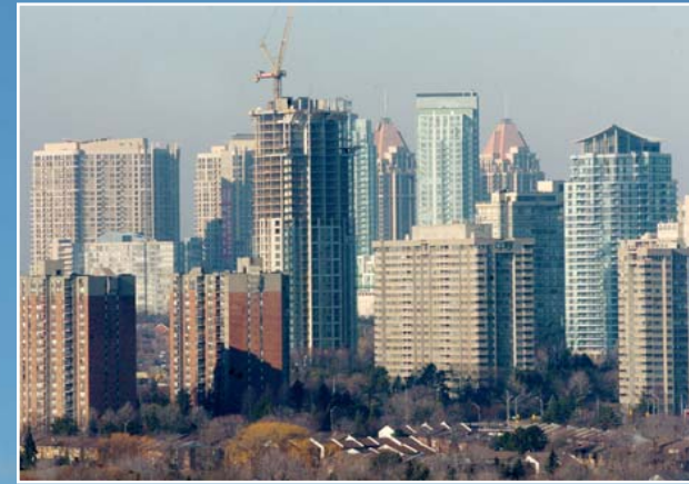
City Centre Today