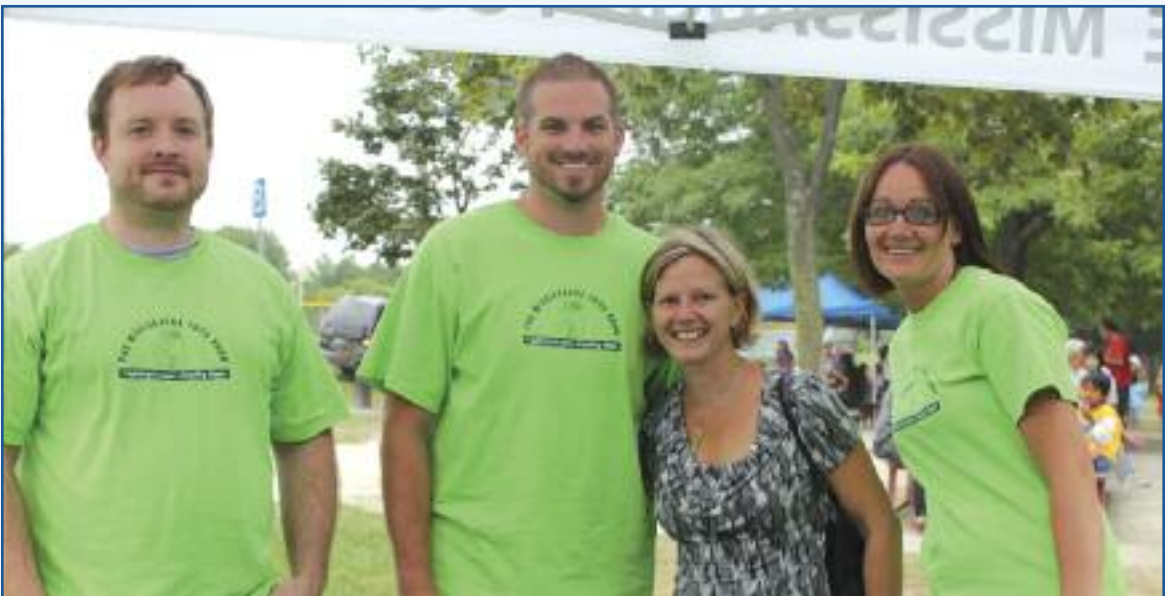
Meeting the Mississauga Food Bank volunteers.

Visit peelregion.ca/social-services/comm-progs-find.htm