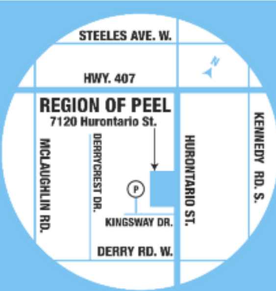
Services at Millcreek Drive in Mississauga have been relocated to 7120 Hurontario St.

Visit peelregion.ca or call 905-791-7800.