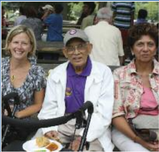
Having lunch with some new friends at the Peel Newcomer Picnic.