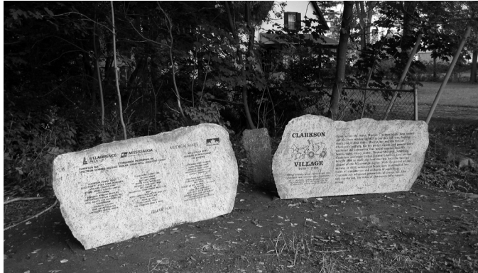
A Sponsor Appreciation Breakfast was held at Benares on September 23rd for the many businesses and individuals who helped to make the Clarkson 1808 event on June 21st such a success. A lasting tribute to the anniversary and everyone who helped out was installed in Oak Tree Park on Clarkson Road North this Fall.