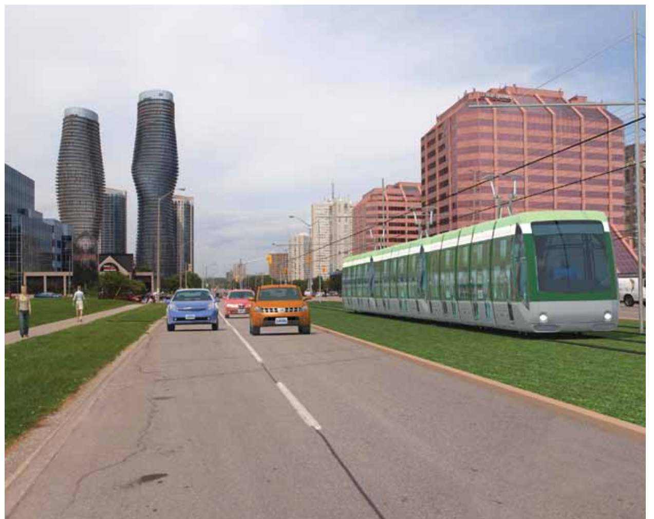
When the LRT is completed Hurontario will become the University Avenue of Mississauga.

My Letter to the Editor in the March/April 2012 edition of Mississauga Life magazine, entitled "The $1.3 Billion Elephant in the Room", spoke to the need for the residents of Mississauga to contact their Members of Provincial Legislature and Federal Parliament to let them know just how important the funding of our LRT system is to the future of this great city.