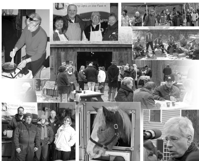
Our Maple Magic Festival attracted over 5,000 people – thanks to volunteers and staff!