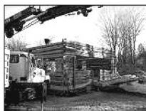
The same crew then worked together to unload and rebuild the cabin at its new home at Bradley Museum