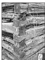
Prior to dismantling, all the logs were numbered and tagged.

The upcoming summer season will soon be on us and we look forward to seeing our many Friends at a variety of the Museums events.