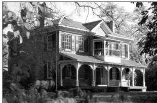
The Verandah at Benares Historic House, as seen from the Garden that will be a fabulous venue for local artists to display their work on Sunday June 10.