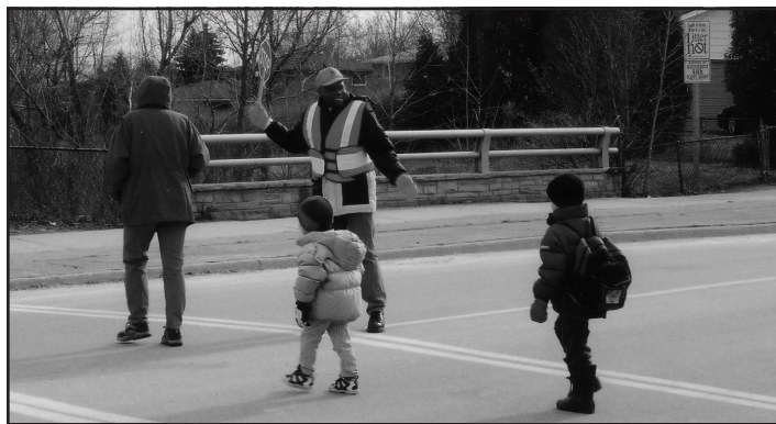
Pedestrians, motorists and the crossing guard all share the responsibility in making sure kids remain safe crossing the street.

Crossing Guard Appreciation Day is Tuesday, June 8, 2010