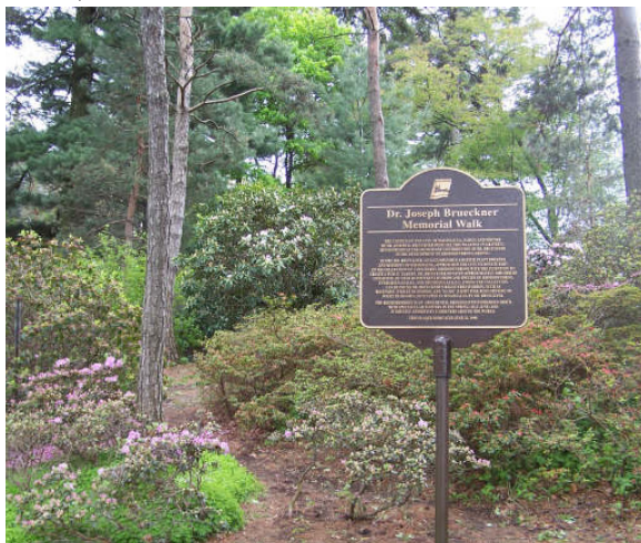
Dr. Joseph Bruckner Memorial Walk - Rhododendron Gardens