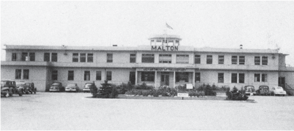
The Malton Airport was built in 1937 on land purchased by the Port Authority of the City of Toronto, south of Malton. The building was used as the airport terminal until 1949 when it became an operations and administration centre. The Airport was renamed Toronto International Airport in 1960 and officially renamed Lester B. Pearson International Airport in 1984.

The images below take us back into the history of Ward 5. They were provided by the Mississauga Library as part of their historic images gallery. The Library is always on the lookout for new photos to add to their collection. If you have historic photos or slides of local people, places and events in Ward 5 that you would like to share, please pass them along to the Canadiana Reading Room. They can be reached at 905-615-3500 ext. 3660 or by email at history.library@mississauga.ca .