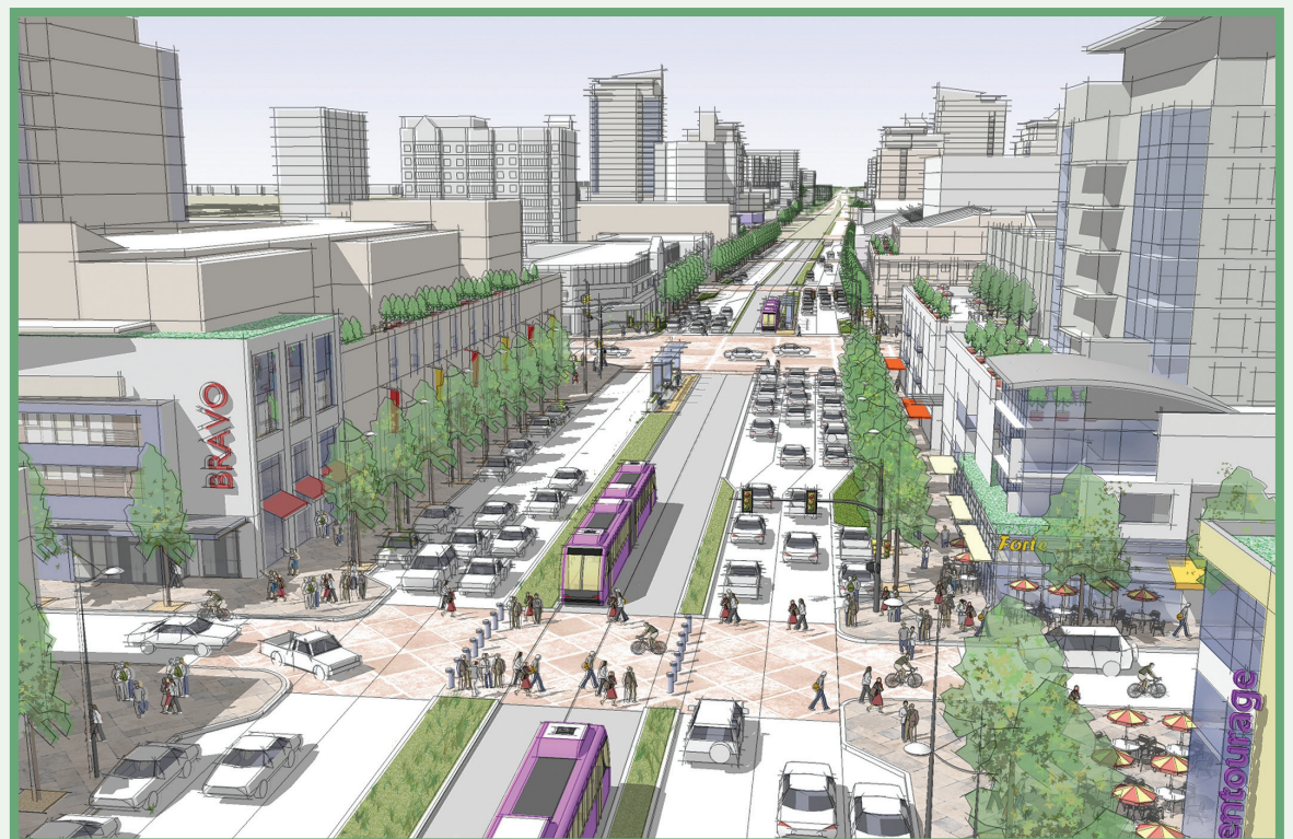
An artist's rendering of what the Hurontario LRT might look like, and its effect on the Hurontario streetscape and local neighbourhoods.

Stay tuned for updates on the project and dates for public information sessions. For more information on this project, please do not hesitate to contact me at 905-896-5500, bonnie.crombie@mississauga.ca , or visit ward5mississauga.ca .