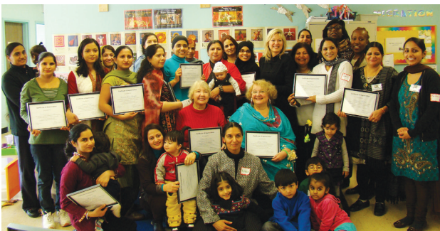
Celebrating the women of the Malton Women Council at the Dunrankin Drive Public School's Readiness Centre on International Women's Day (March 6, 2012)

My goal is to bring City Hall to the residents of Ward 5. One of the easiest and most effective ways to do this is online. That is why I have recently launched a new Ward 5 website at ward5mississauga.ca . I am excited about this new site because it will allow me to have a conversation with residents and provide up to date information about what is happening at the City and the Region.