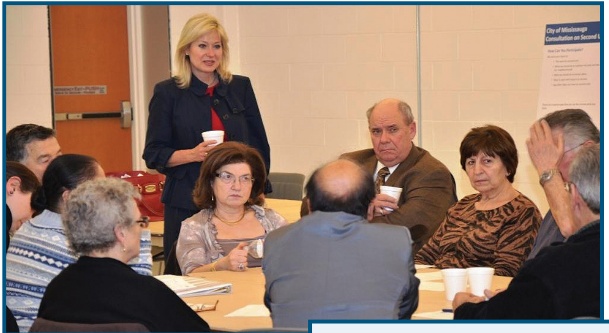
Bonnie Crombie participates in the discussion with Malton residents about the future of second units in Mississauga (February 23, 2012)

In late 2011, the City started consultations with stakeholder organizations. In February and March 2012, the City held five public consultation workshops across the City to consult with residents on their thoughts and ideas about how to make second units work for everyone. Residents were asked to discuss how the City can allow second units while preserving