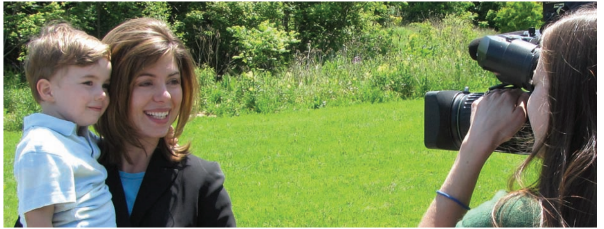
Acting Mayor Eve Adams is interviewed by the media after making the $139 Million Infrastructure Stimulus Funding announcement for Mississauga.

All projects and locations are subject to changes.