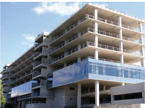
Construction of the Aero Centre V is well underway. The building will be built to LEED (Leadership in Energy and Environmental Design) standards.