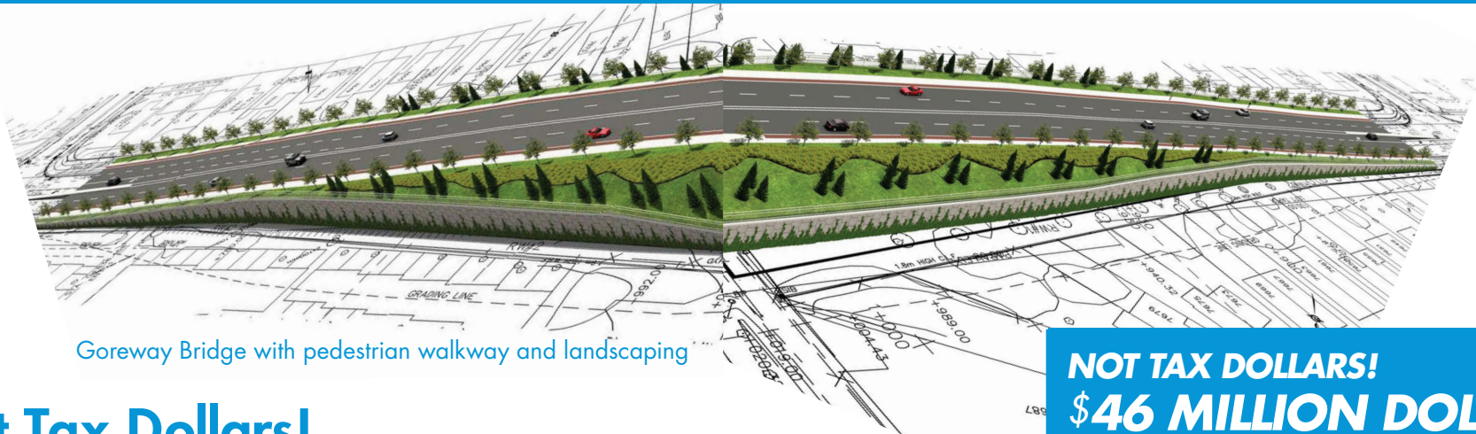
Goreway Bridge with pedestrian walkway and landscaping