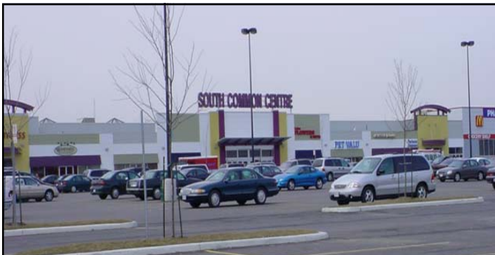
Recently "De-malled" South Common Centre

1 Mississauga Plan was approved by the Region of Peel on May 5, 2003, however, the Retail Commercial policies were under appeal as of January 1, 2004. As such, City Plan designations were used to estimate the amount of development that could occur on retail commercial lands outside of City Centre. Mississauga Plan policies were in effect for City Centre.