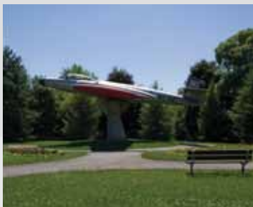
Exhibit photos: CF-100, 1957 and 2011

Come to the Mississauga Book Fest - a celebration of books and the joy of reading right in Mississauga! It's fun (and free) for the whole family. The Friends of the Library along with dozens of community partners are behind this year's community event. Plan to support your community, your Library, and your local authors in the heart of Mississauga at the Celebration Square. Visit the Book Fest website regularly at www.mississauga.ca/library for up to the minute news!