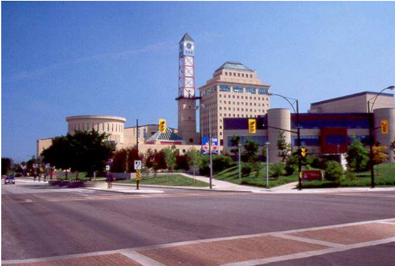
City Hall (1987), 300 City Centre Drive Architect: Jones & Kirkland