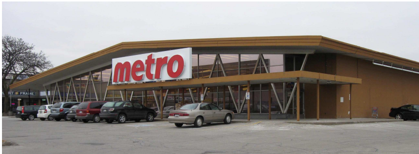
(Originally) Steinberg's (1962), 1077 North Service Road