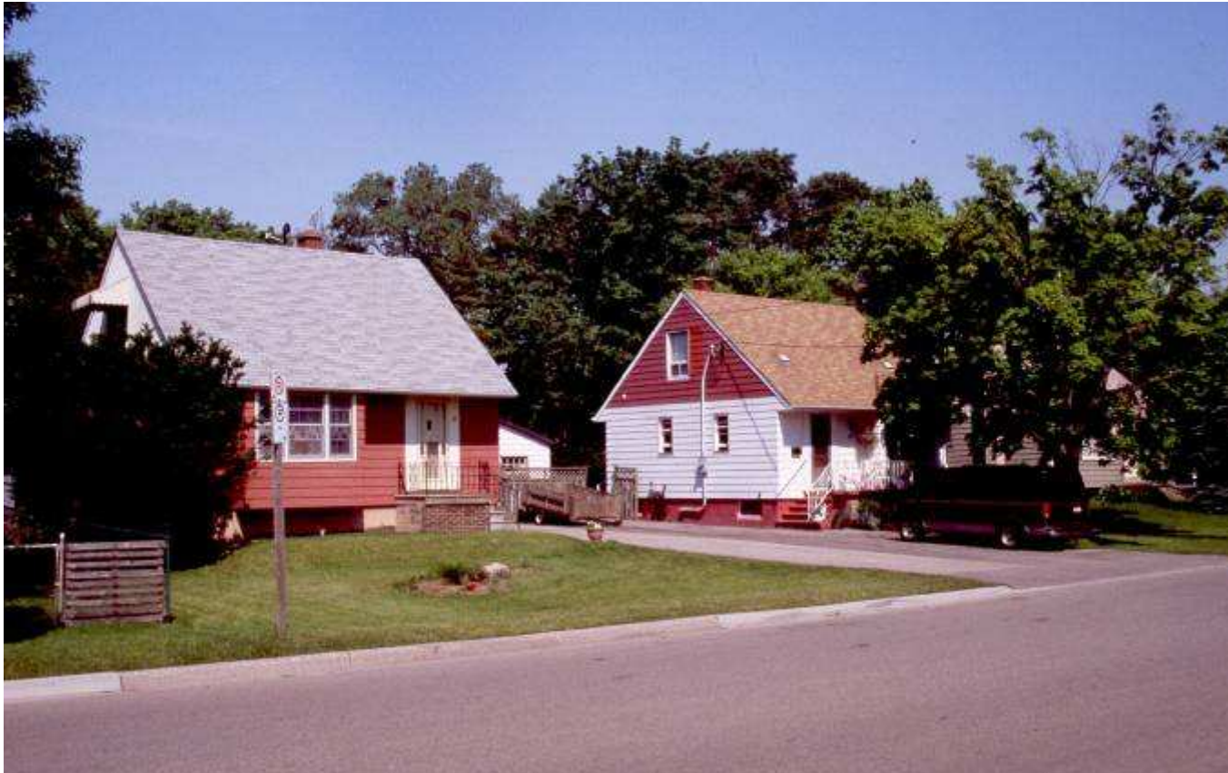
Malton Victory Housing , Northeast of Derry and Airport Roads