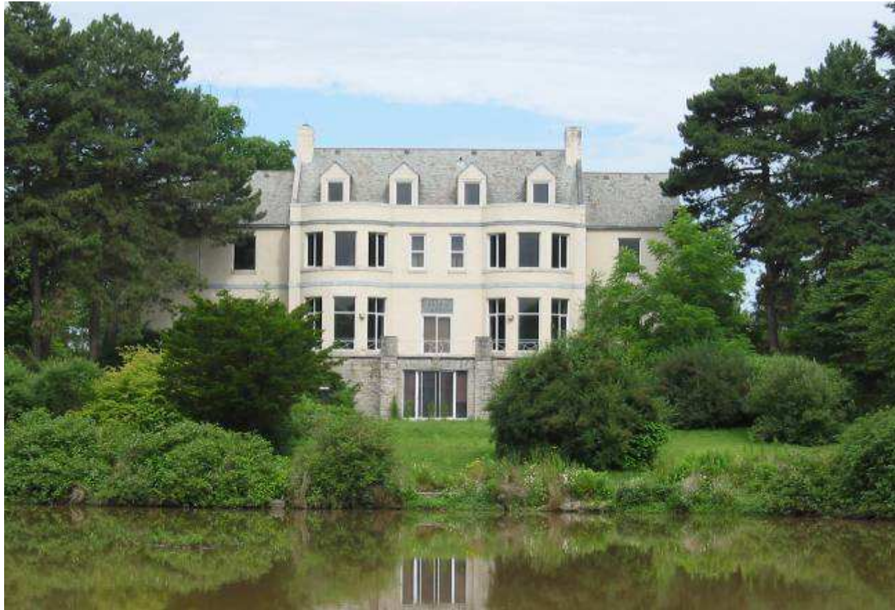
Kathleen Harding (Bell Gairdner) Estate (1938), 2700 Lakeshore Rd. W. Architect: Marani Lawson & Morris