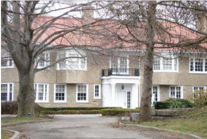
Fasken Estate (c.1920), 2221 Shawanaga Trail Architect: Wickson & Gregg