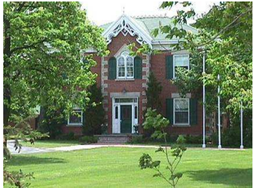
Samuel Brown House (1866), 620 Derry Road West