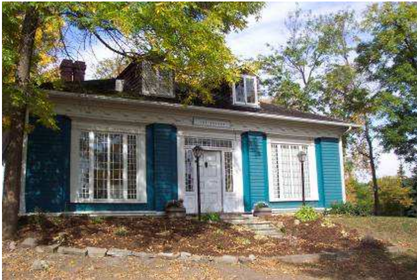
Robinson-Adamson Grange (1828), 1921 Dundas Street West