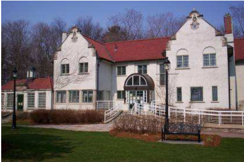
Adamson Estate (1919), 850 Enola Avenue Architect: Sproatt & Rolph