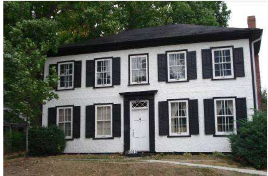
Bell Hotel (1844), 1090 Old Derry Road West