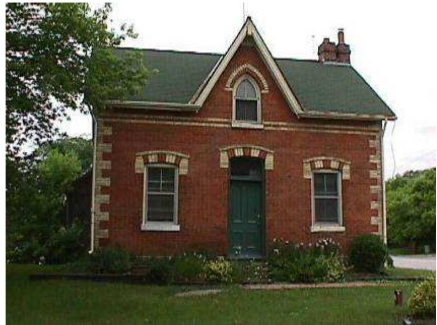
Samuel Moore House (1883), 1295 Burnhamthorpe Road East