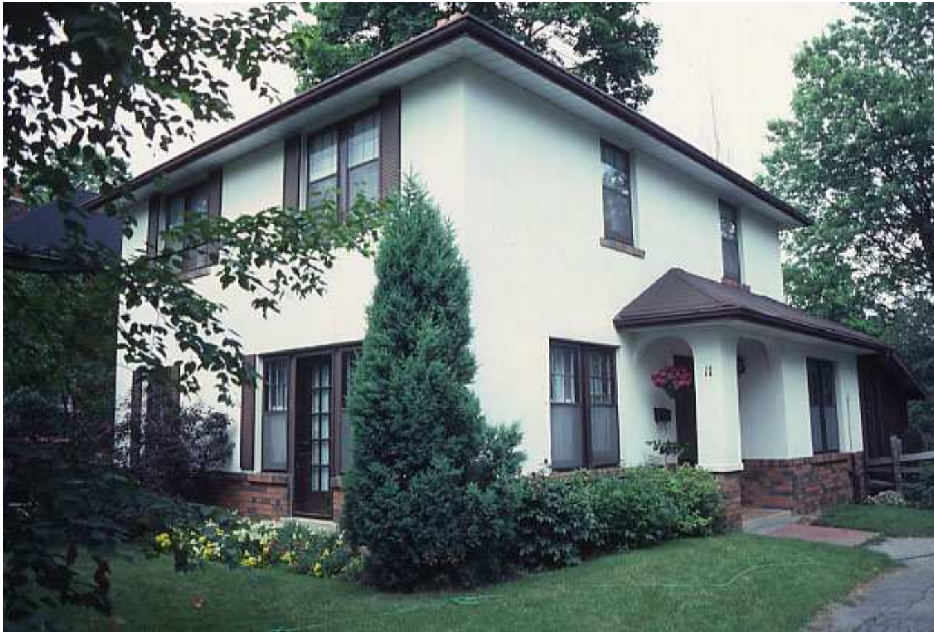
Tompkin House (1928), 11 Oakwood Avenue North