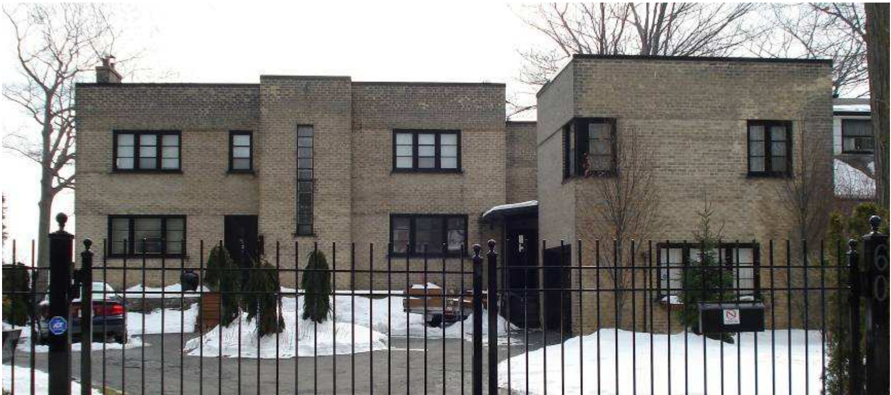
Linke House (1939), 60 Cumberland Drive Architect: Alfred Samit