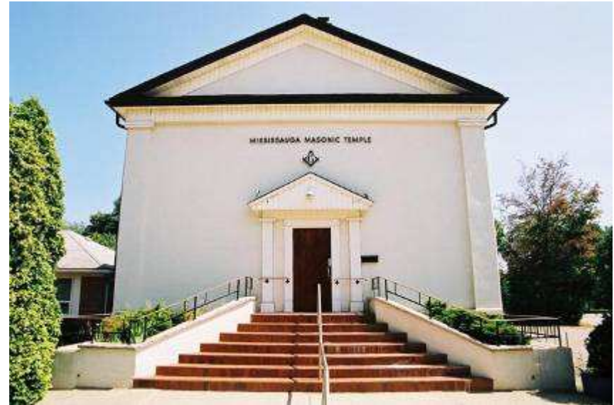
Masonic Hall (1845 with 1894 renovations), 47 Port Street West