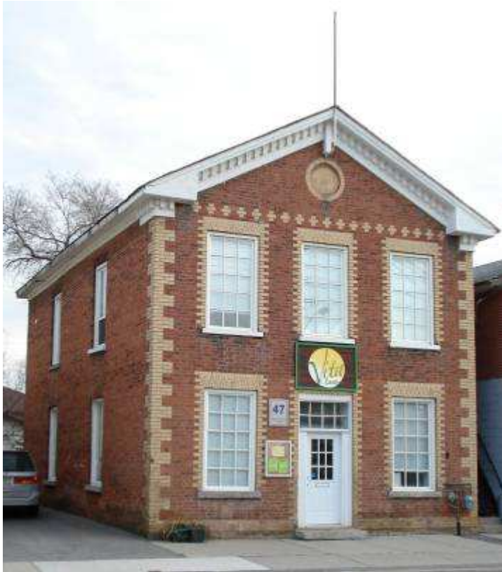
Orange Hall (1855), 47 Queen Street South