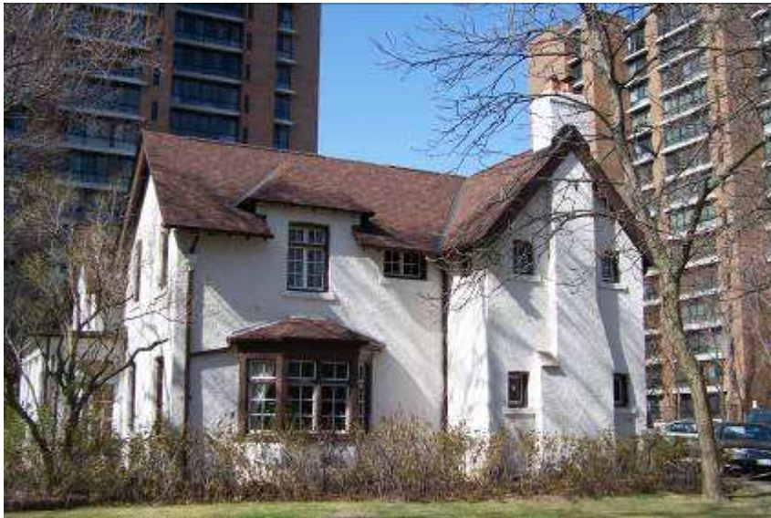
McMaster House (c.1925, includes earlier structure), 1400 Dixie Road Architect: Frank Darling