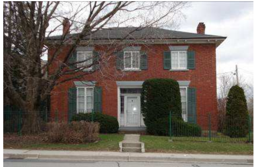
Paterson House (1847), 13 Thomas Street