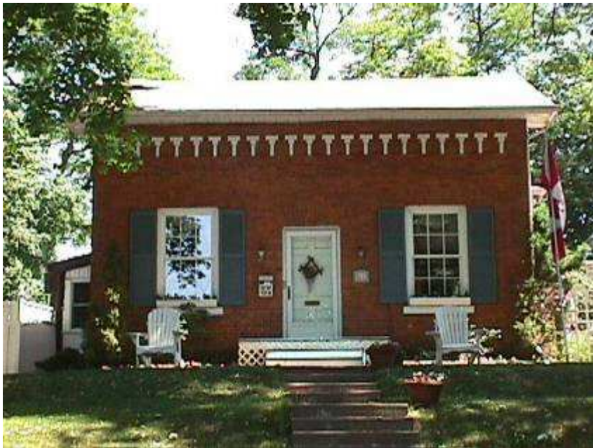
Abigail Street House (c.1840s), 27 Mill Street