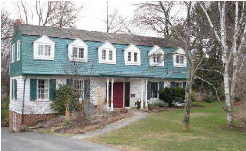
Richard Barry Fudger Gatehouse (c.1910), 725 Bexhill Road