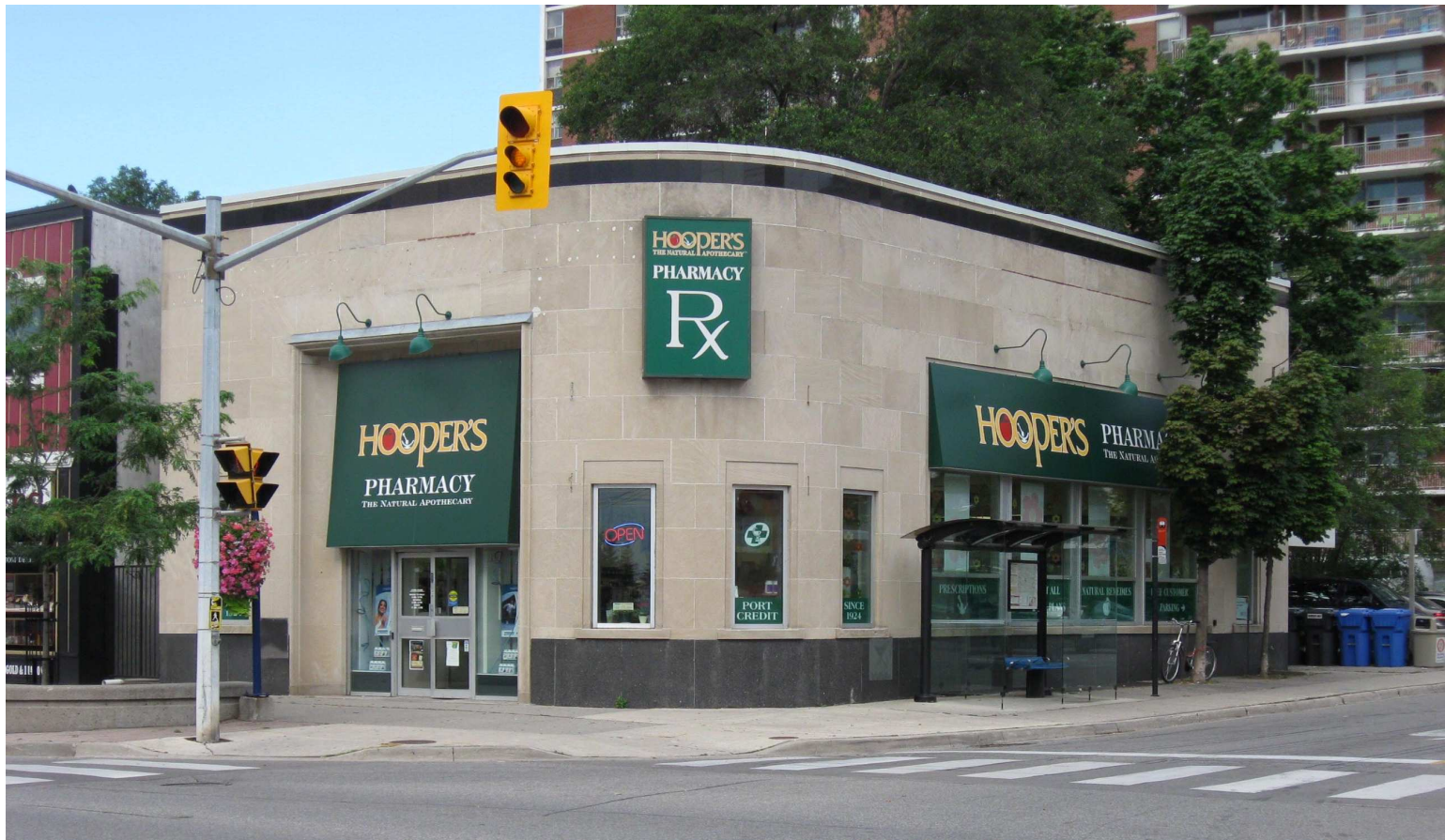
Dominion Bank (1948), 88 Lakeshore Road East Architect: Douglas Kertland