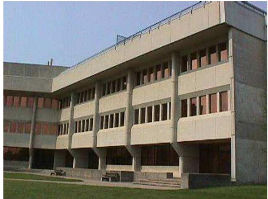
UTM South Building (1972), 3359 Mississauga Road Architect: A.D. Marginson & Raymond Moriyama