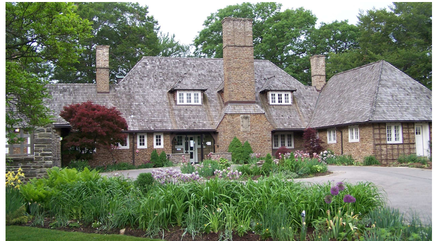
Parker Estate "Riverwood" (1920), 4300 Riverwood Park Lane Architect: Mathers & Haldenby