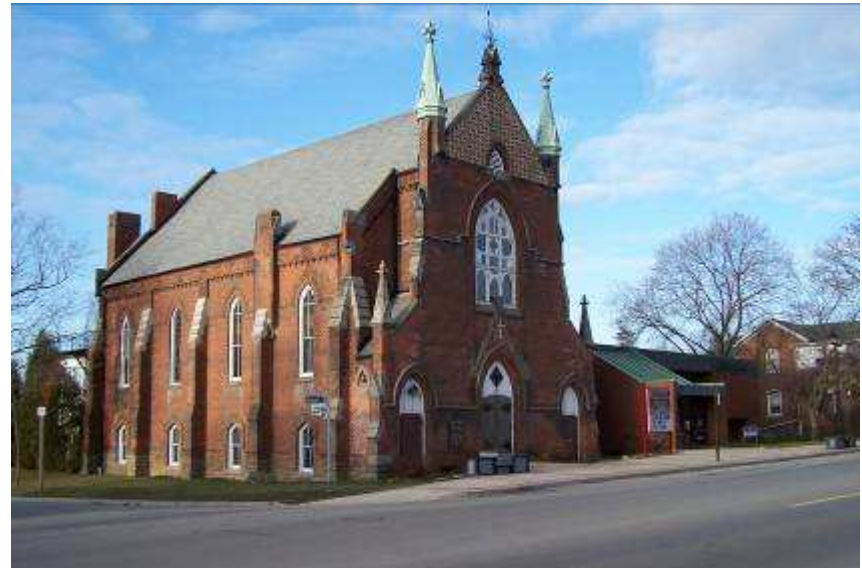
Streetsville United Church (1876), 274 Queen Street South Architect: (James) Smith & Gemmell