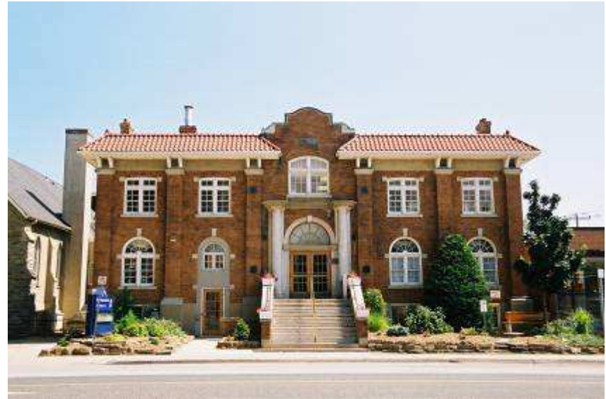
Clarke Memorial Hall (1916), 161 Lakeshore Road West