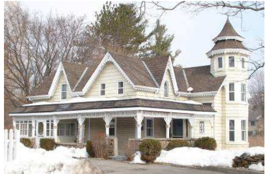
Denison House (1890) (built around c.1850 McGill log cabin), 1207 Lorne Park Road