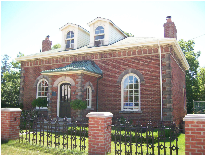
Matthew Cunningham House (1860), 11 Barry Avenue