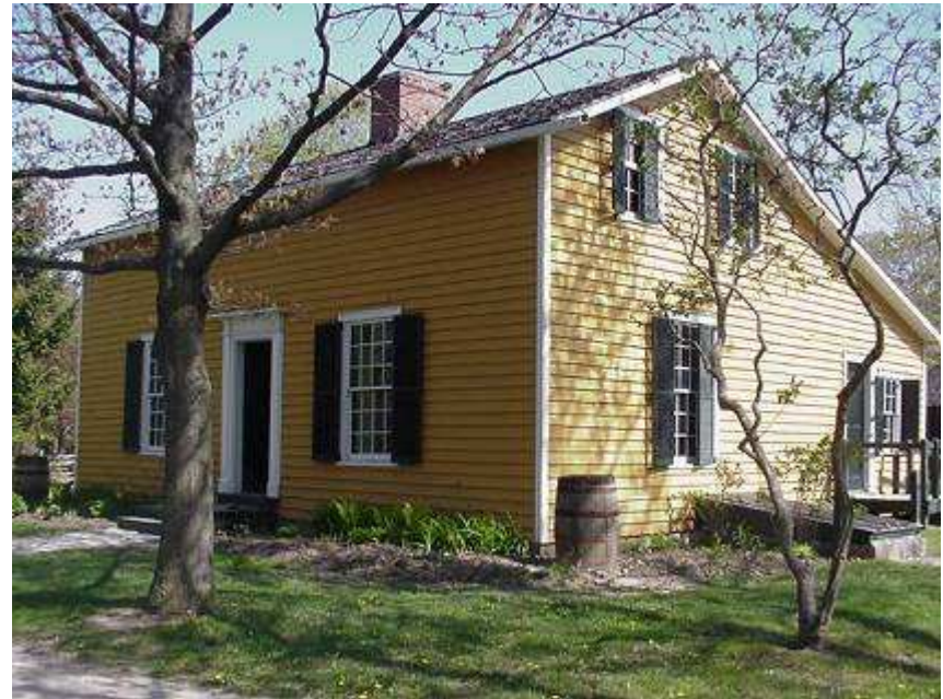
Bradley House (c.1830), 1620 Orr Road