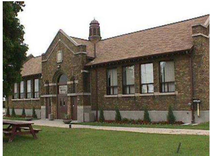
Dixie Public School (1921), 1375 Blundell Road Architect: Smith & Wright