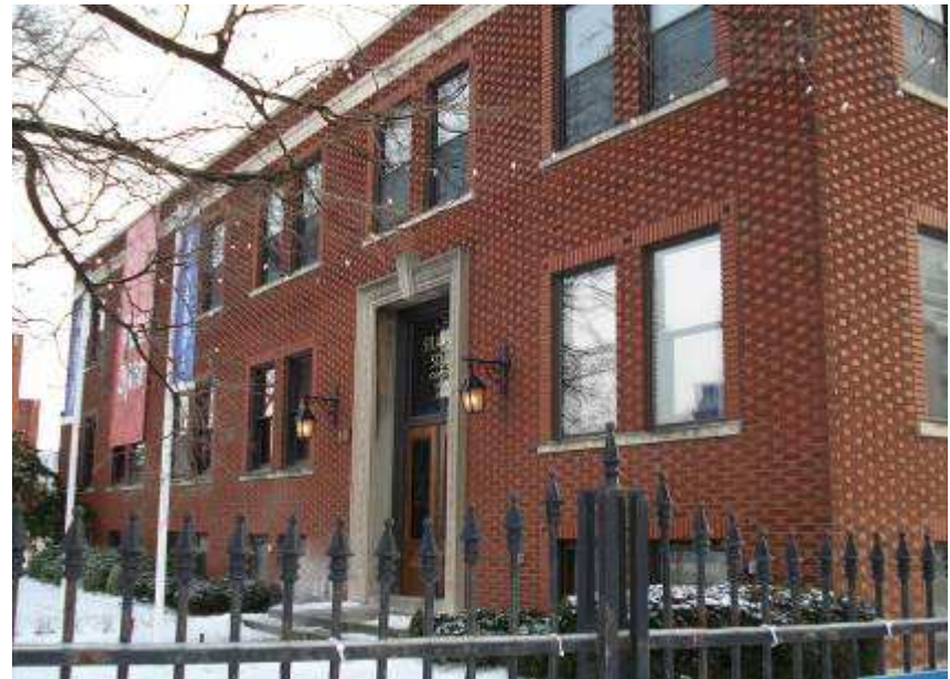
St. Lawrence Starch Admin. Bldg. (1932), 141 Lakeshore Road East