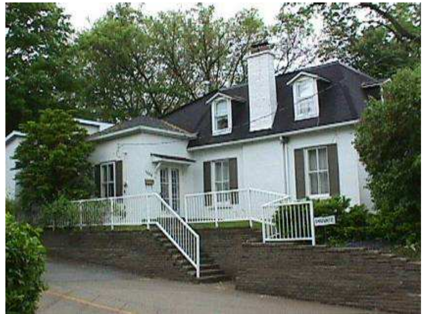
Erindale Blacksmith Shop (c.1890), 1584 Dundas Street West