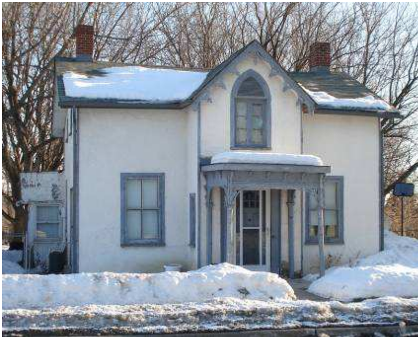
John Scruton House (1856), 307 Queen Street South