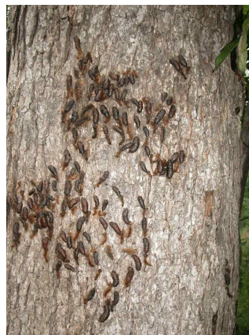
Figure 2. Massed pupae on white oak tree in infested area of Mississauga

There were few reports and little damage from gypsy moth , Lymantria dispar this year, that is until Peter Lyons, urban forest ecologist for Mississauga, reported an infestation. Although the area of damage was confined to a few hectares, the damage was intense and the large number of larvae produce massive numbers of pupae (Figure 2), adults and eggs. When this site was visited on July 8 th , all four life stages could be found. Most of the defoliation was on white and red oak. Lower numbers occurred in the surrounding area.