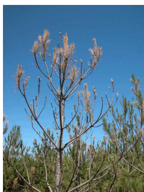
Figure 7. Early damage to red pine by the redheaded pine sawfly

Redheaded pine sawfly , Neodiprion lecontei populations are alive and healthy at CFB Borden. Numerous freshly hatched larvae were observed on July 7 th and damage was already evident (Figure 7). This area was also heavily affected in 2004. This is the only known area of occurrence of the pest.