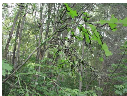
Figure 6. Elm spanworm larvae festooned on ash leaves.

The elm spanworm , Ennomos subsignaria recurred in much of the same area that was infested in 2004. Last year it was found in conjunction with another pest, the lesser maple spanworm , Itame pustularia . This latter insect was absent this year but large numbers of elm spanworm nonetheless caused moderate to severe defoliation through some areas of the Greenock swamp in the south part of Bruce County. A number of hosts were affected including ash, elm, basswood and both red and silver maple.