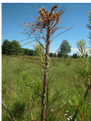
Figure 3. Early stage of affected leader (left) and later stage after browning of tip (right).

The balsam fir sawfly , Neodiprion abietis , a pest of balsam fir has been observed in the Wasaga Beach area of Simcoe County and from Port Elgin to Sauble Falls in Bruce County. Similar areas were affected in 2004. Damaged trees take on a distinct reddish hue which is the remainder of the needles after larval feeding.