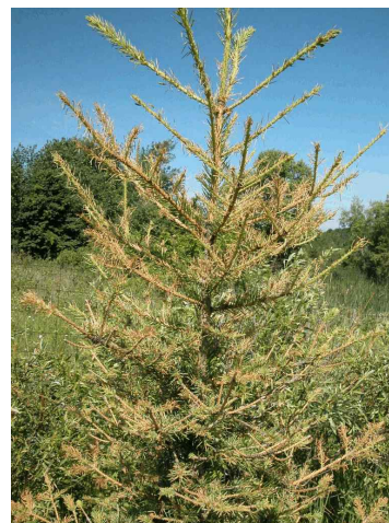
Figure 5. Yellowheaded sawfly defoliation