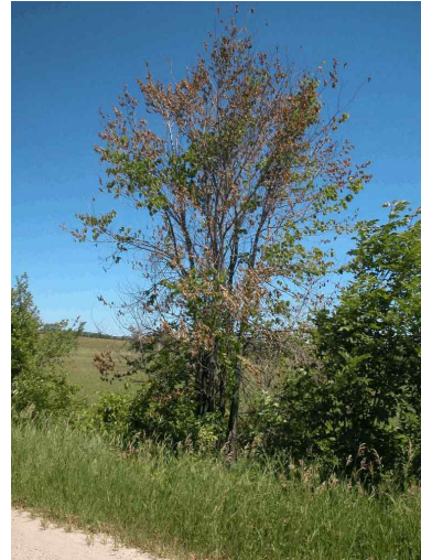
Figure 11. Juvenile elm with Dutch elm disease

http://na.fs.fed.us/spfo/pubs/howtos/ht_ded/ht_ded.htm