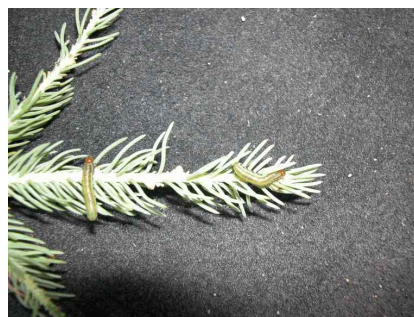
Figure 4. Larvae of yellowheaded spruce sawfly

Larvae of the yellowheaded spruce sawfly , Pikonema alaskensis can do extensive damage to ornamental, shelterbelt or ornamental spruce trees (Figure 4). Damage is most common when the trees are young. Particularly heavy feeding damage was noted on hedgerow plantings along highways in the Aurora area earlier in the month (Figure 5).