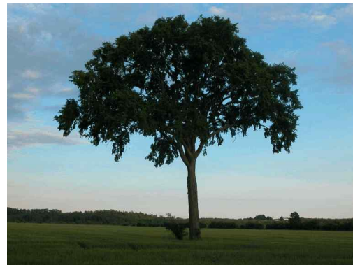
Figure 12. Isolated healthy elm tree.