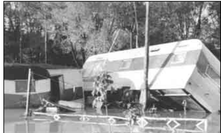
▲ Devastation of Hurricane Hazel, 1954