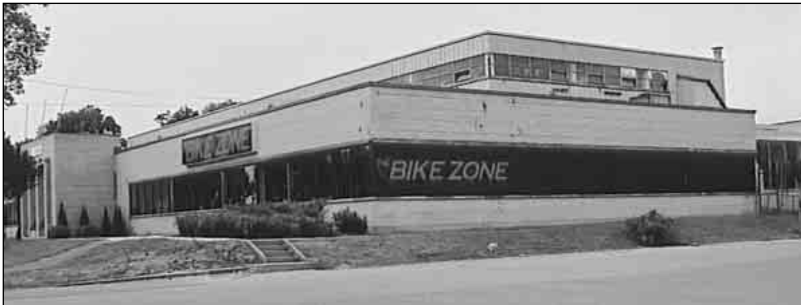
▲ former Admiral Building. 501 Lakeshore Road, 2003 (Kathleen A. Hicks)