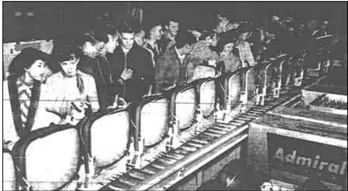
Students Tour Canadian Admiral Factory, 1951 ▶

The former Admiral factory at 501 Lakeshore Road East was closed down in 1991 and Whirlpool sold it on June 21, 1996. It had stood empty since it was vacated until 1997 when Saxco Canada Limited, a bottle distributor, rented the office building. The Bike Zone is also located there. The warehouses are utilized by businesses such as Massilly North American Inc. and Consumers Glass.