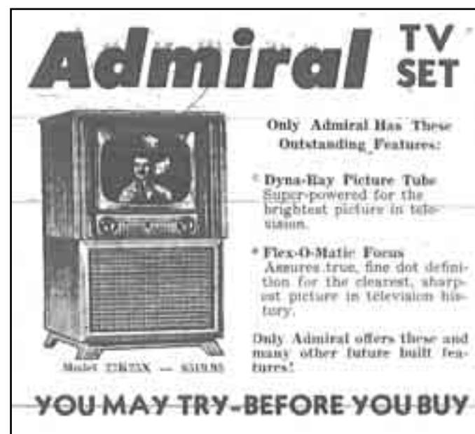
▲ Newspaper Ad