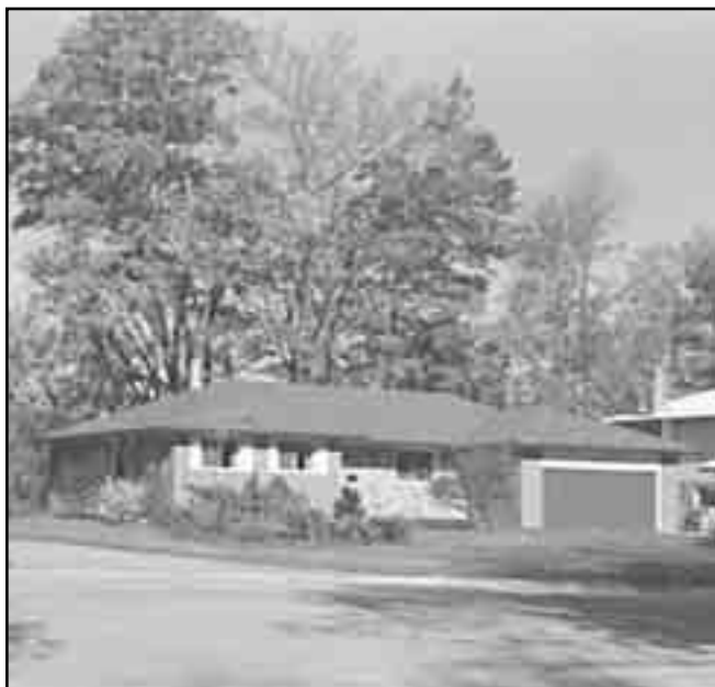
▲ Kaneff House, Erindale Woodlands (Nonie Wilcox)