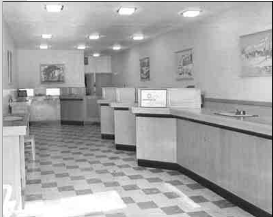
▲ Interior of Canadian Bank of Commerce, 1951