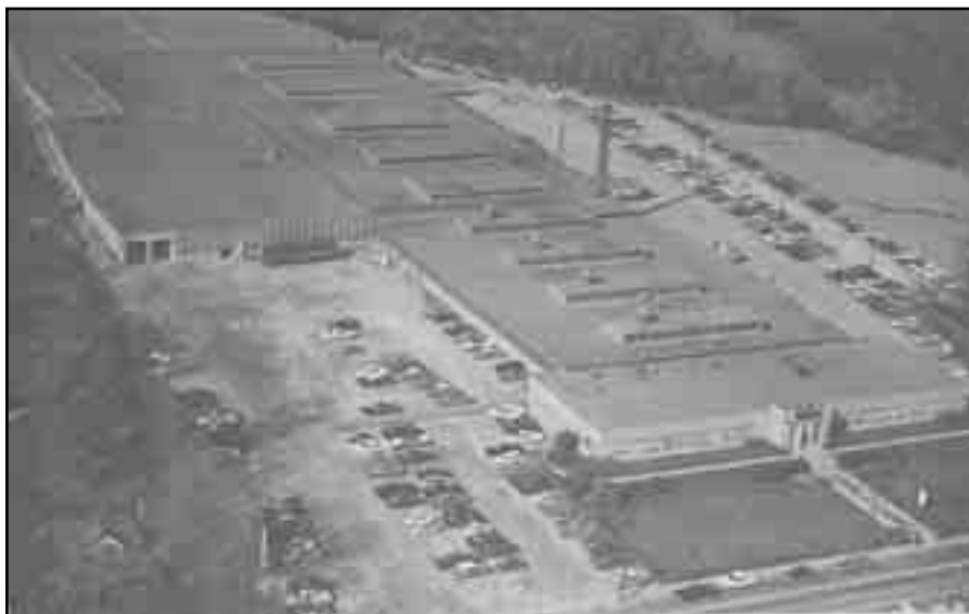
▲ Canadian Admiral Plant Aerial View