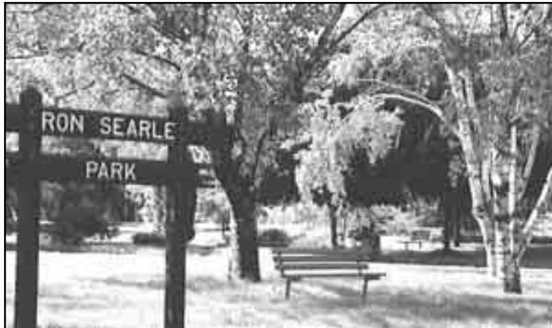
▲ Ron Searle Park