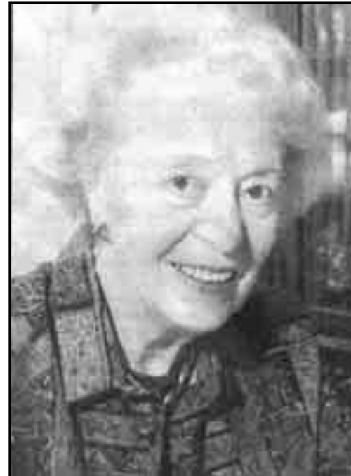
◀ Mary Cuomo (The Mississauga News)

The Park consisted of 15 acres (6 ha), two and a half (1 ha) of which was set aside for renting space to Americans. There were eleven streets all serviced with Hydro and water. The trailers had septic tanks.