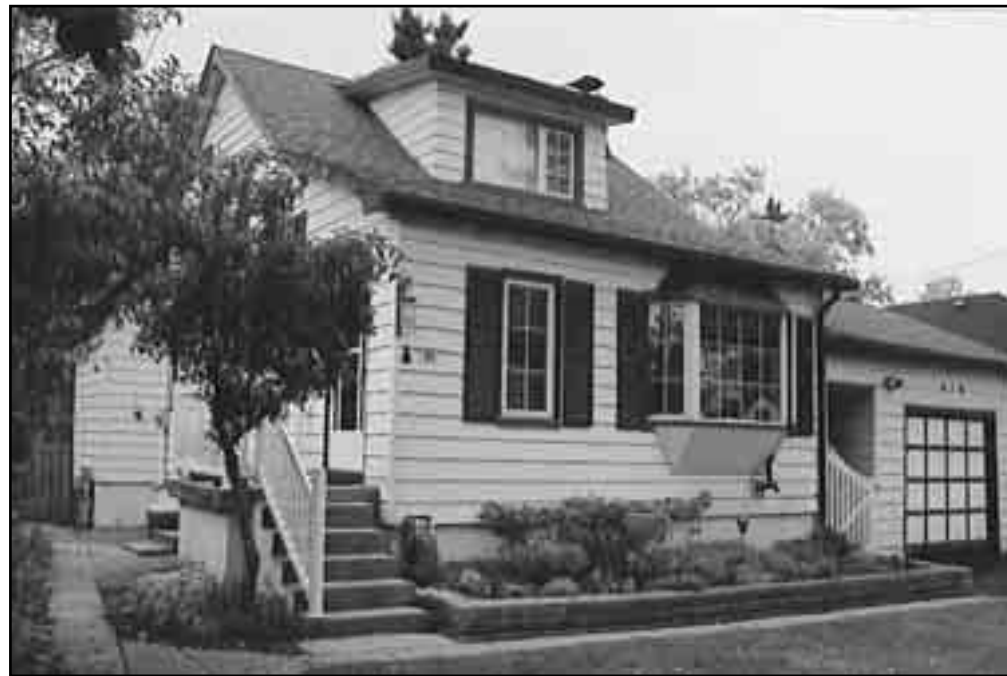
Former Lush House, 618 Curzon Avenue, 2004