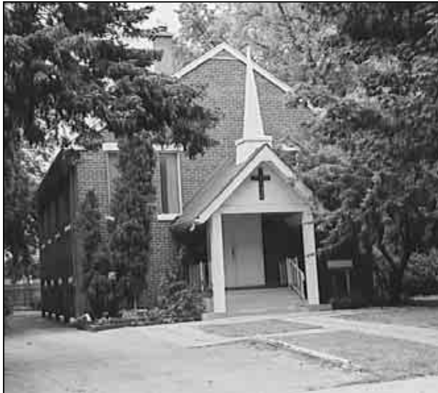
▲ Former Kenmuir Avenue Baptist Church, 2003