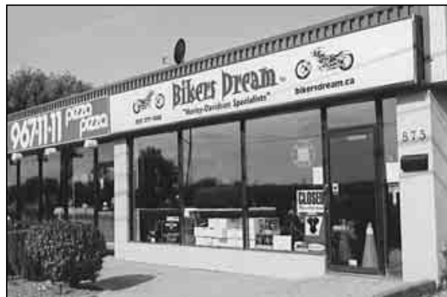
▲ Former Briscoe's Hardware, 2004