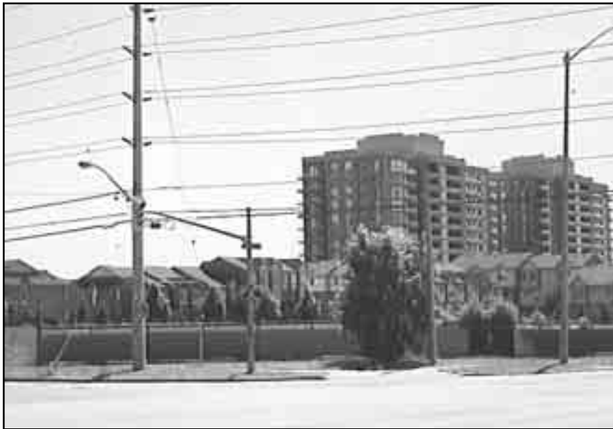
▲ Former Army Depot Location, 2004 (Kathleen A. Hicks)

In 2004, the corner acreage that was once the parking lot is vacant and fenced, where the rest of the property was built up in townhouses and two apartment buildings in 2001.