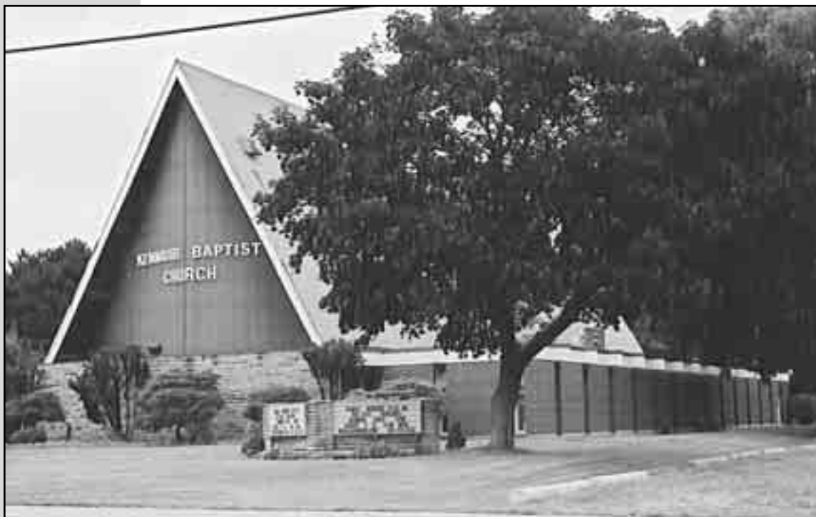
▲ Kenmuir Baptist Church, 2003