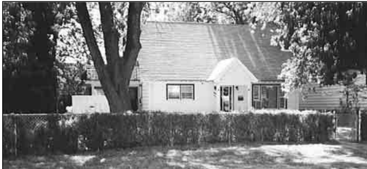
▲ The Speck House, built in 1953