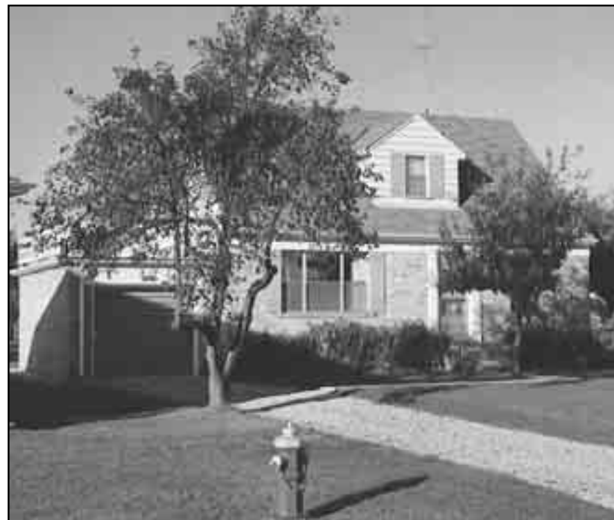
▲ A Shipp Home

1966. They have never slowed down, contributing immensely to the foundation of the City of Mississauga with pride.