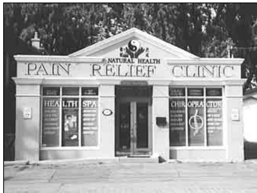
▲ Former Bank Building, 2003 (Kathleen A. Hicks)