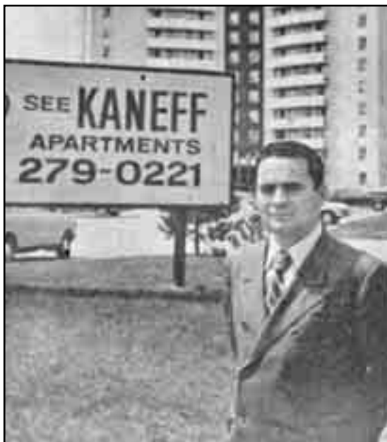
▲ Kaneff and Apartment Building