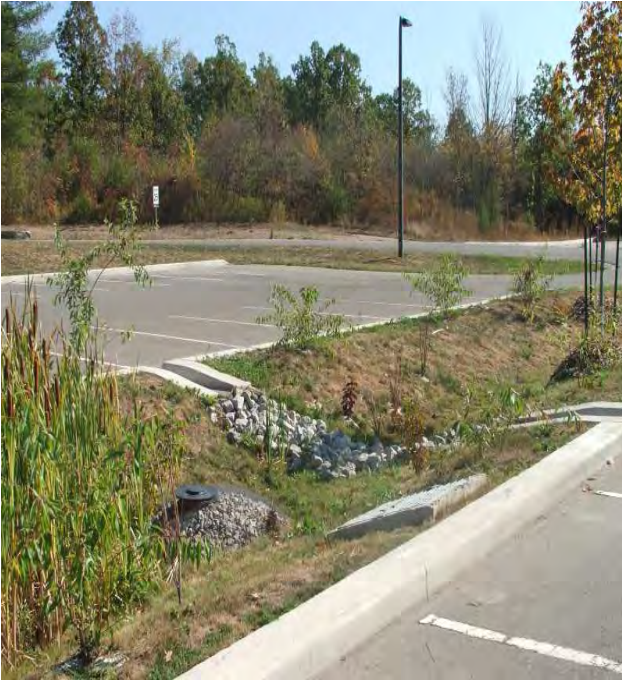
Figure 6-16: The drainage for the parking area at Riverwood has been designed to mimic natural ecological functions such as water infiltration and purification. The runoff from this bio-swale outlets to a small wetland feature on the park site.

6.5.2.1 Mississauga will use a water balance approach in the management of stormwater by encouraging and supporting measures and activities that reduce stormwater runoff, improve water quality, promote evapotranspiration and infiltration, and reduce erosion using stormwater best management practices.