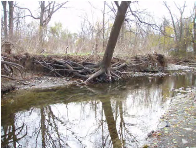
Figure 6-10: Erosion can result in serious danger to property, people, water resources, vegetation and infrastructure. Adherence to development standards and policies reduces these dangers and protects life and property.

of vegetation compromises the Natural Areas System and Urban Forest. Eroded soils compromise the functionality of key infrastructure such as sewers and ditches, thereby increasing the frequency and severity of flooding. In addition, soil erosion, due to wind, causes dust and particulate matter, which affects human health.