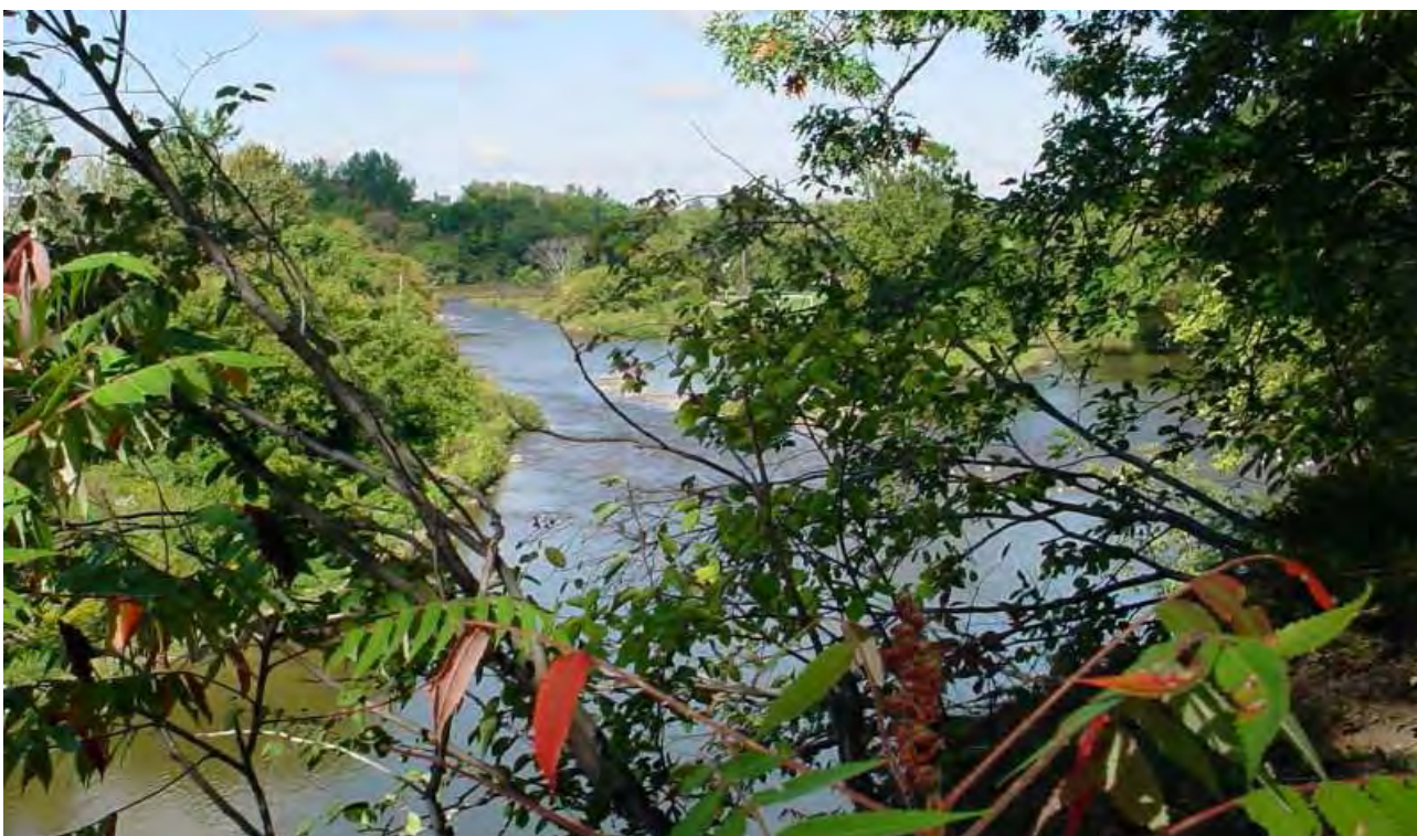
Figure 6-6: Historically, agricultural practices and land development have resulted in displacement and fragmentation of much of the natural environment. The Credit River Valley corridor is a major component of Mississauga's Natural Areas System, containing the majority of the city's natural areas.