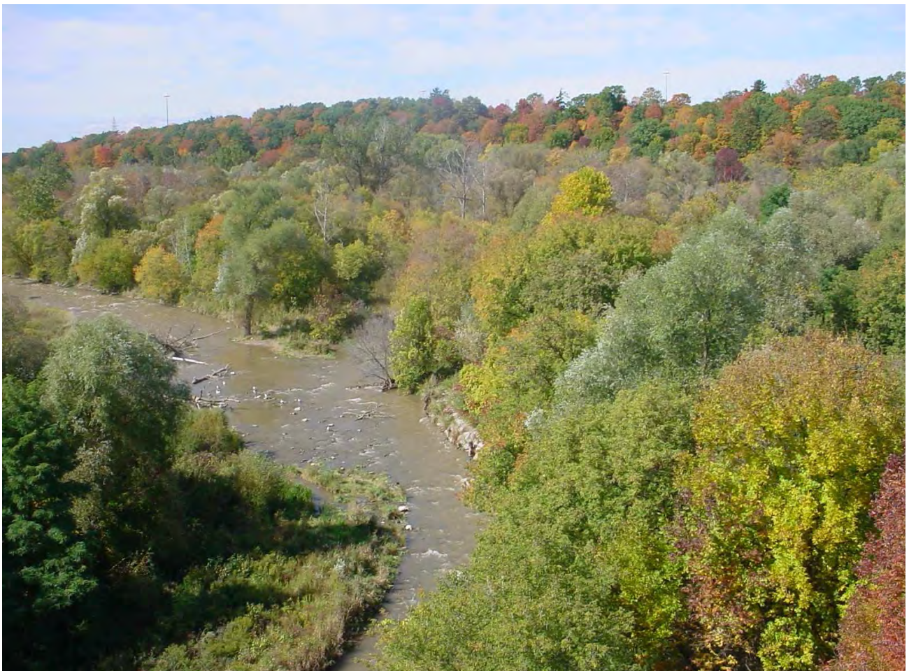
Figure 6-9: Watercourse and valley corridors such as the Credit River corridor are subject to naturally occurring physical and ecological processes such as flooding and erosion. This can result in conditions that are hazardous to life and property, making these lands unsuitable for development.

Valleylands are shaped and reshaped by natural processes such as flooding and erosion. In general,