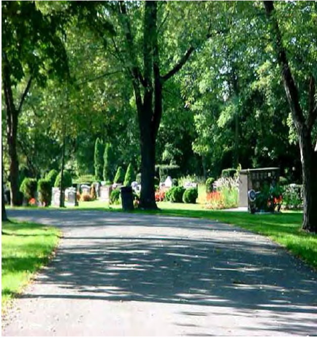
Figure 6-12: Cemeteries are permitted within Public Open Space and Private Open Space. Cemeteries are serene places for remembrance. Some cemeteries also include passive amenities such as sitting areas and trails. (Streetsville Public Cemetery)