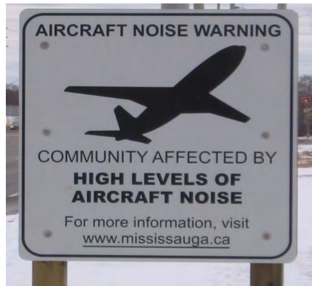
Figure 6-19: Although the Airport contributes to the city’s strong economy, some communities are directly affected by the sound levels emitted by the airplanes.

There are areas of Mississauga that are subject to high levels of aircraft noise. As a result, policies are required that set out the restrictions on development within the areas subject to high levels of aircraft noise. The policies of this Plan are based on a six-runway configuration of the Airport.