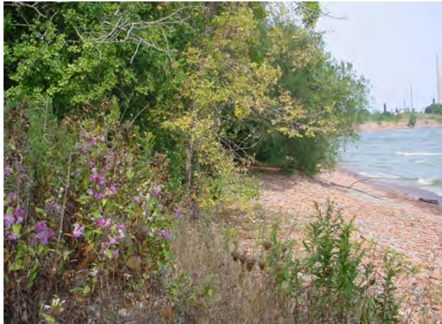
Figure 6-15: Mississauga is fortunate to be located on the shore of Lake Ontario, part of the largest system of freshwater lakes in the world. The Great Lakes and their watersheds make up one of Canada's richest and most biologically diverse regions, home to a huge variety of fish, wildlife and plant species.