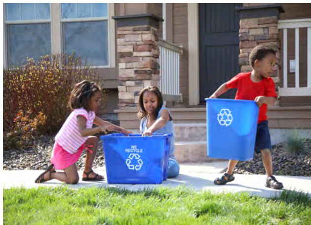
Figure 6-18: Recycling has become a part of our daily living. Promoting the reduction, re-use and recycling of waste is a priority in Mississauga.

The Region is responsible for the collection, processing, transfer and safe disposal of waste generated by residential uses. However, area