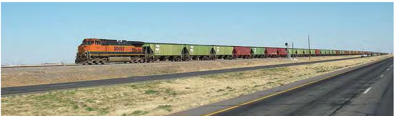
Figure 6-20: Railways, while a vital part of transportation system and economy, can pose noise, vibration and safety concerns.

6.9.4.1 Where residential and other land uses sensitive to noise are proposed in close proximity to rail lines, it may be necessary to mitigate noise impacts, in part by way of the subdivision design. A Noise Impact Study will be submitted prior to approval in principle of such lands located within 100 m of a Principal Main Rail Line right-of-way or within 50 m of a Secondary Main Rail Line. Residential development or any development that includes outdoor, passive and recreational areas will generally not be permitted in locations where the mitigated outdoor noise levels are forecast to exceed the limits specified in Appendix G: Outdoor and Indoor Sound Level Limits - Road and Rail, by five dB A or more. A detailed noise study will be required to demonstrate that every effort has been made to achieve the outdoor sound level criteria specified in Appendix G: Outdoor and Indoor Sound Level Limits - Road and Rail, and the noise study shall prove to the satisfaction of the City that the noise level in the outdoor living area, after applying attenuation measures, is the lowest level