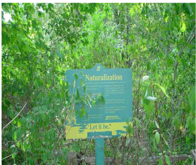
Figure 6-7: Mississauga promotes and is proactive in the management of its natural areas and the protection of its ecological functions.

6.3.1.4 Residential Woodlands are areas within Neighbourhoods, generally in older residential areas with large lots that have mature trees forming a fairly continuous canopy. Some areas have minimal native understorey due to maintenance of lawns and landscaping. Residential Woodlands provide a number of ecological benefits such as habitat for tolerant canopy birds (both in migration and for breeding) and other urban wildlife and facilitating ground water recharge due to the high proportion of permeable ground cover. Development proposals in Residential Woodlands will seek to protect, enhance, restore and expand the existing tree