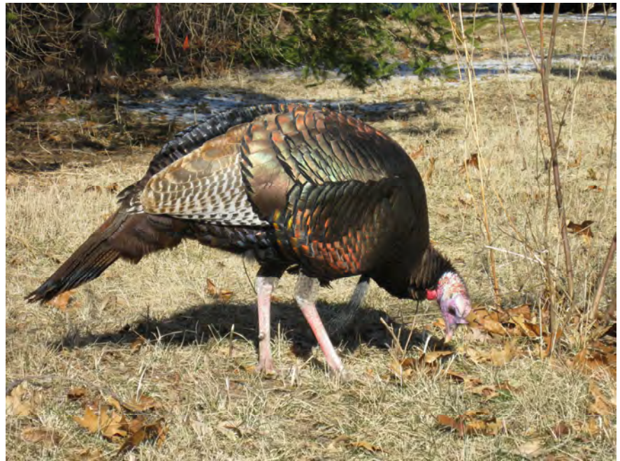
Figure 6-8: Natural areas provide habitat for many plants, birds, insects and animals which are important for maintaining biological diversity.

6.3.1.6 Mississauga will establish a program of protection alternatives for the Natural Areas System. This may include, but will not be limited to: information/education programs, stewardship or