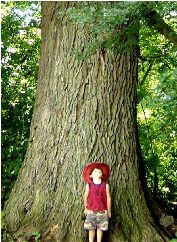
Figure 6-2: Mississauga’s natural areas and their ecological functions will be preserved and enhanced, and natural resources managed wisely, so that current and future generations enjoy a healthy and safe environment.

Water, air and land are essential elements of the environment affected by human activity. Issues such as stormwater, air quality, contaminated sites , noise and waste generation have a significant impact on the environment and require mitigation and management to reduce their impacts.