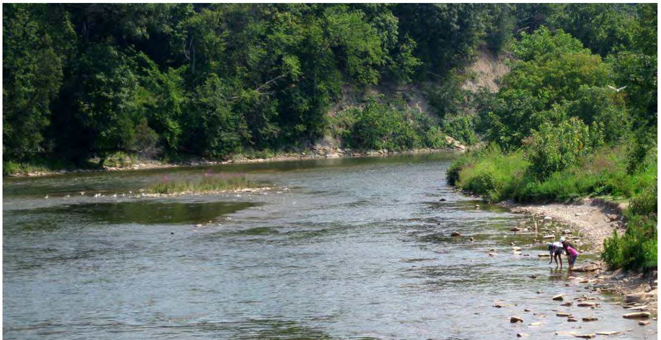
Figure 6-1: As an environmentally responsible community, Mississauga is committed to environmental protection, conducting its corporate operations in an environmentally responsible manner and promoting awareness of environmental policies, issues and initiatives. Residents and businesses have a large role to play to help protect and enhance the land, air, water and energy resources that are enjoyed by all in the city.

Promoting transit as a form of transportation, supported by transit-supportive uses, which employ compact design principles, will assist in addressing the issues that are negatively impacting the environment. Other chapters of this Plan address these matters and support the Living Green pillar of the Strategic Plan.