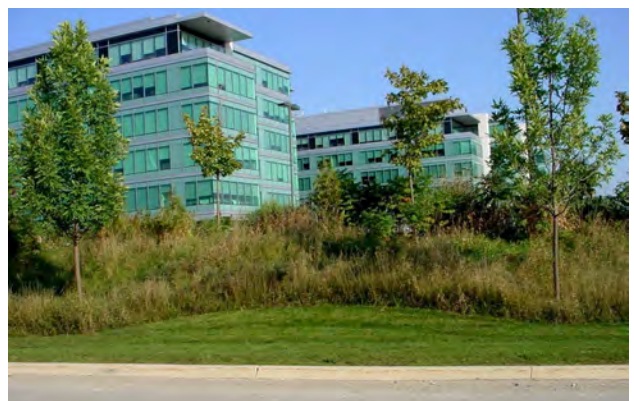
Figure 6-3: Naturalized landscaping with native, non-invasive plants species in the city's employment areas benefits the environment in many ways, such as improving air quality, reducing water consumption and pesticide use, and providing habitat for birds and insects.

This Plan also contains policies regarding the Natural Areas System. In addition to preserving and enhancing natural areas, stormwater best management practices for new development can