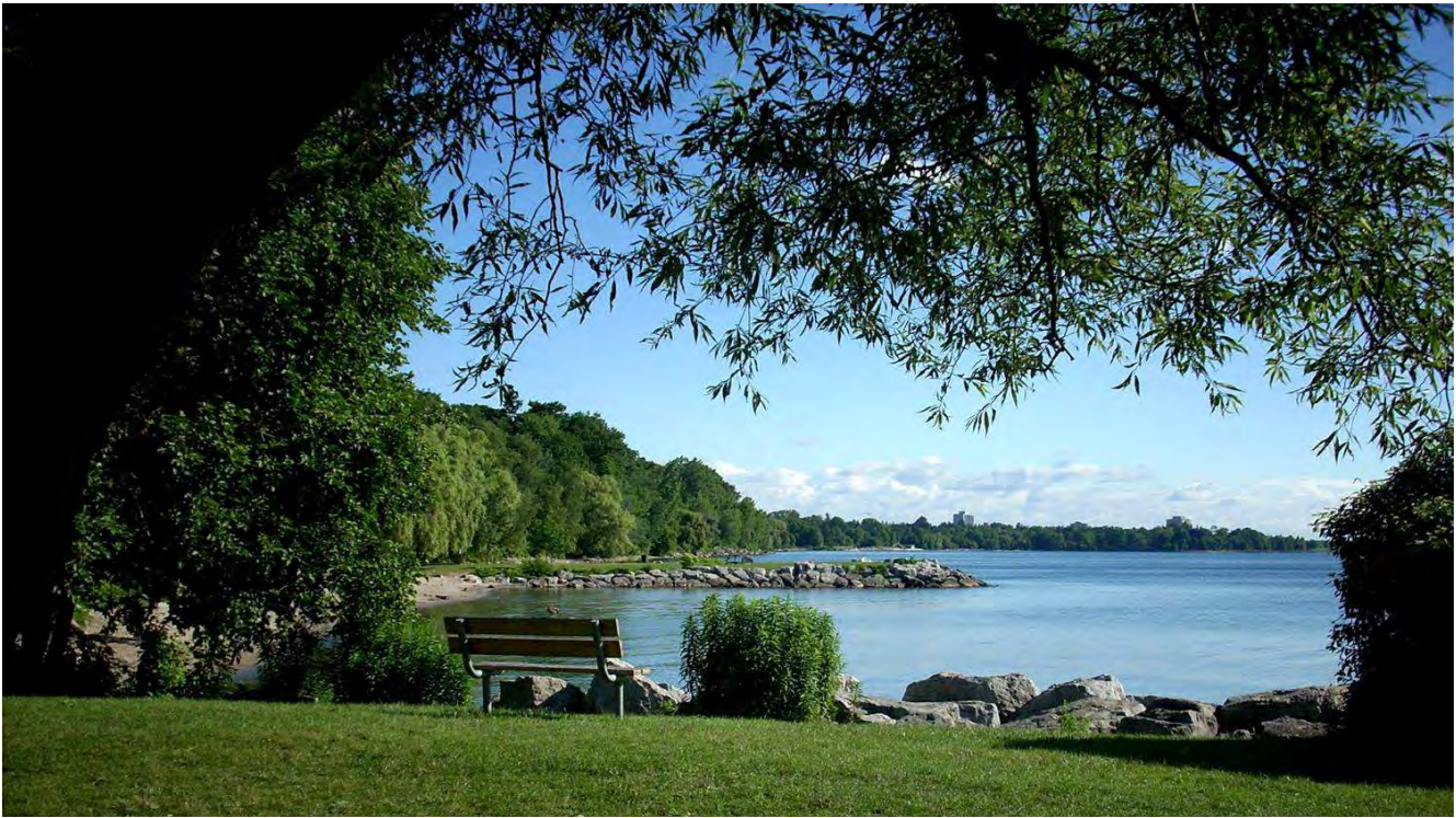
Figure 6-11: Jack Darling Park is a public waterfront park located midway between Southdown Road and Mississauga Road. This scenic park provides paths and waterfront trails for pedestrians and cyclists. The park is designed with a number of amenities including picnic areas, comfort stations, a splash pad, tennis courts, open space area, a toboggan hill, playgrounds, beaches, trails, and a footpath that leads to Rattray Marsh, a Provincially Significant Wetland.

6.3.2.4.4 Development and site alteration will not be permitted within Hazardous Lands adjacent to the Lake Ontario shoreline which are impacted by flooding hazards, erosion hazards and/or dynamic beach hazards unless it meets the requirements of the appropriate conservation authority and the policies of the City.