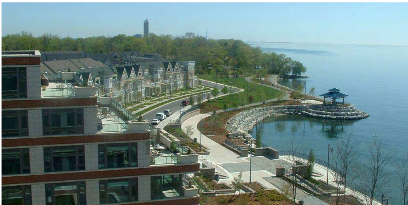
Figure 6-17: As Mississauga matures and builds out the last of its greenfields, brownfields will become a major component of future development. An example of a successful brownfield development is the former St. Lawrence Starch plant (originally established in 1889) located in Port Credit.

6.7.1 To ensure that contaminated sites are identified and appropriately addressed by the