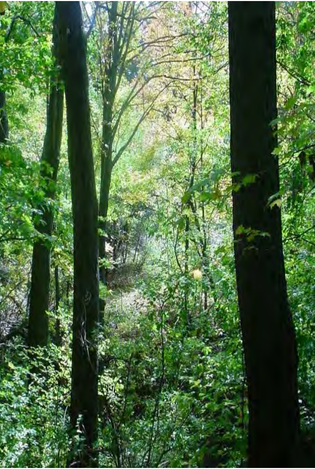
Figure 6-14: All trees and woodlands make up Mississauga’s Urban Forest. Trees and woodlands play an important role in climate moderation, air and water quality, erosion control, provide wildlife habitat and have a significant role in reducing air temperature in the city.