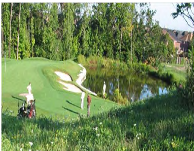
Figure 6-5: Mississauga’s parks, green spaces, recreation areas and natural areas make up the majority of the city’s Green System. In addition to its recreational use, the Brae Ben Golf Course, built on the former Britannia landfill site, provides natural habitat through the design of landscaping and water features.

Parks and Open Space within the Green System, as shown on Schedule 4, have primary uses such as recreational, educational, cultural and utility services.