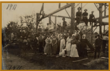
1911 Barn raising on the Cavan property, Clarkson Road, just north of St. Bride's Church.