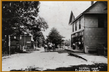
The hub of Clarkson in 1910, looking south on Clarkson Road, just north of the train tracks and Clarkson's Corners Railway Station.