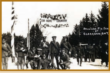
A "Soldier's Pie Feast", 1915, north-west corner of Clarkson Road and Lakeshore Roads. The Clarkson's Women's Institutes provided a lunch of pie and coffee for Canadian soldiers who were marching from their training in the Niagara region to Toronto on their way to serve overseas in World War One.

All photos are from: Historic Images Database, City of Mississauga. www.mississauga.ca/historicimages