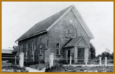
Carmen Methodist Church, at the corner of Lakeshore Road and Clarkson Road south, was originally built in 1875. Today, this building is Wowy-Zowy Toys.