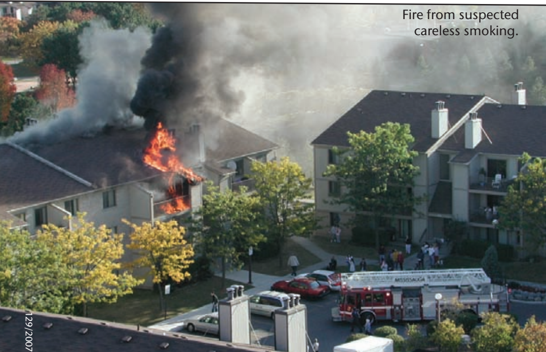
Fire from suspected careless smoking.

Please see our supplemental brochure for more information Working Smoke Alarms, It's the Law, It's Your Life