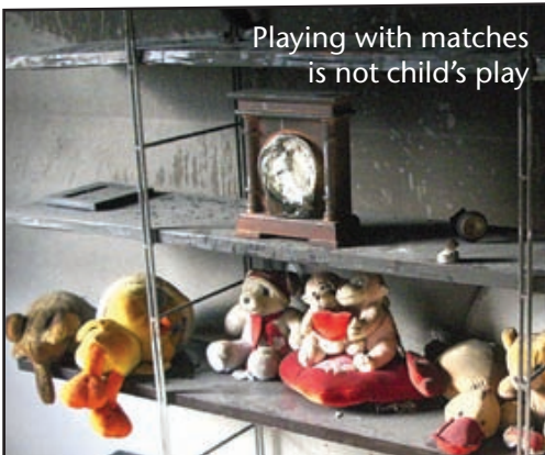
Playing with matches is not child's play

The TAPP-C educational program is available to children and their parents. Please contact our Public Education unit at 905-896-5908 for details.