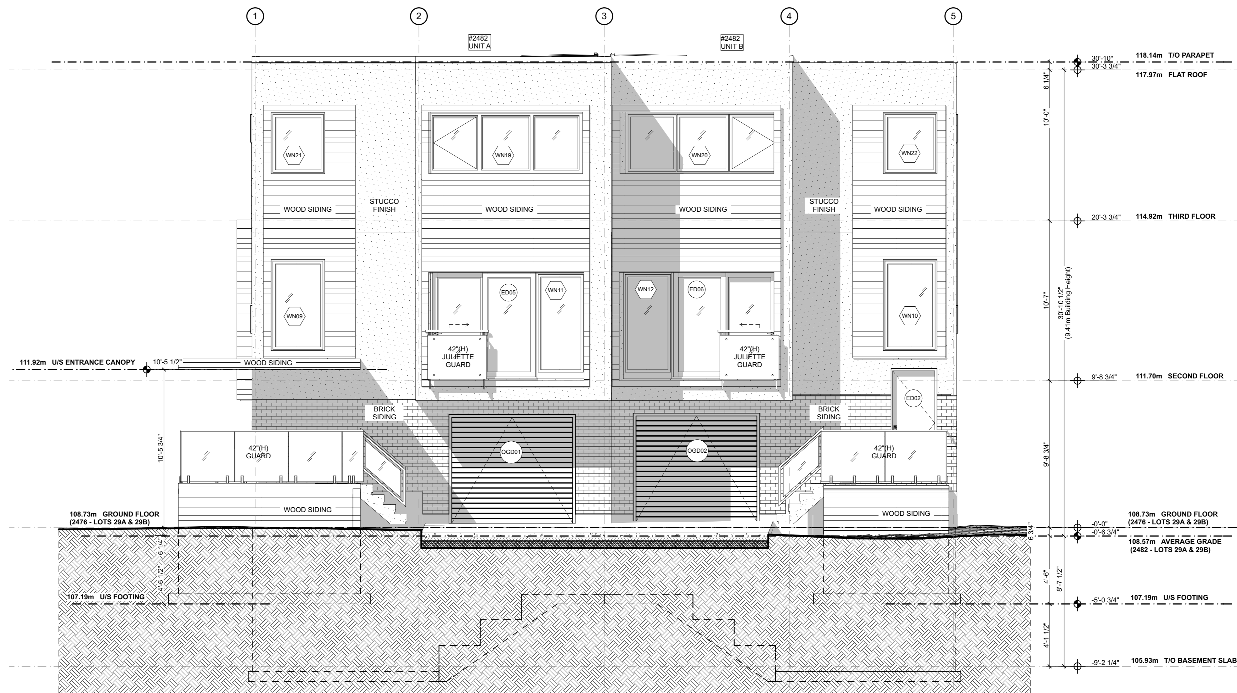
1 Front Elevation - #2482 Facing Dunbar Road SCALE: 1/4" = 1'-0"