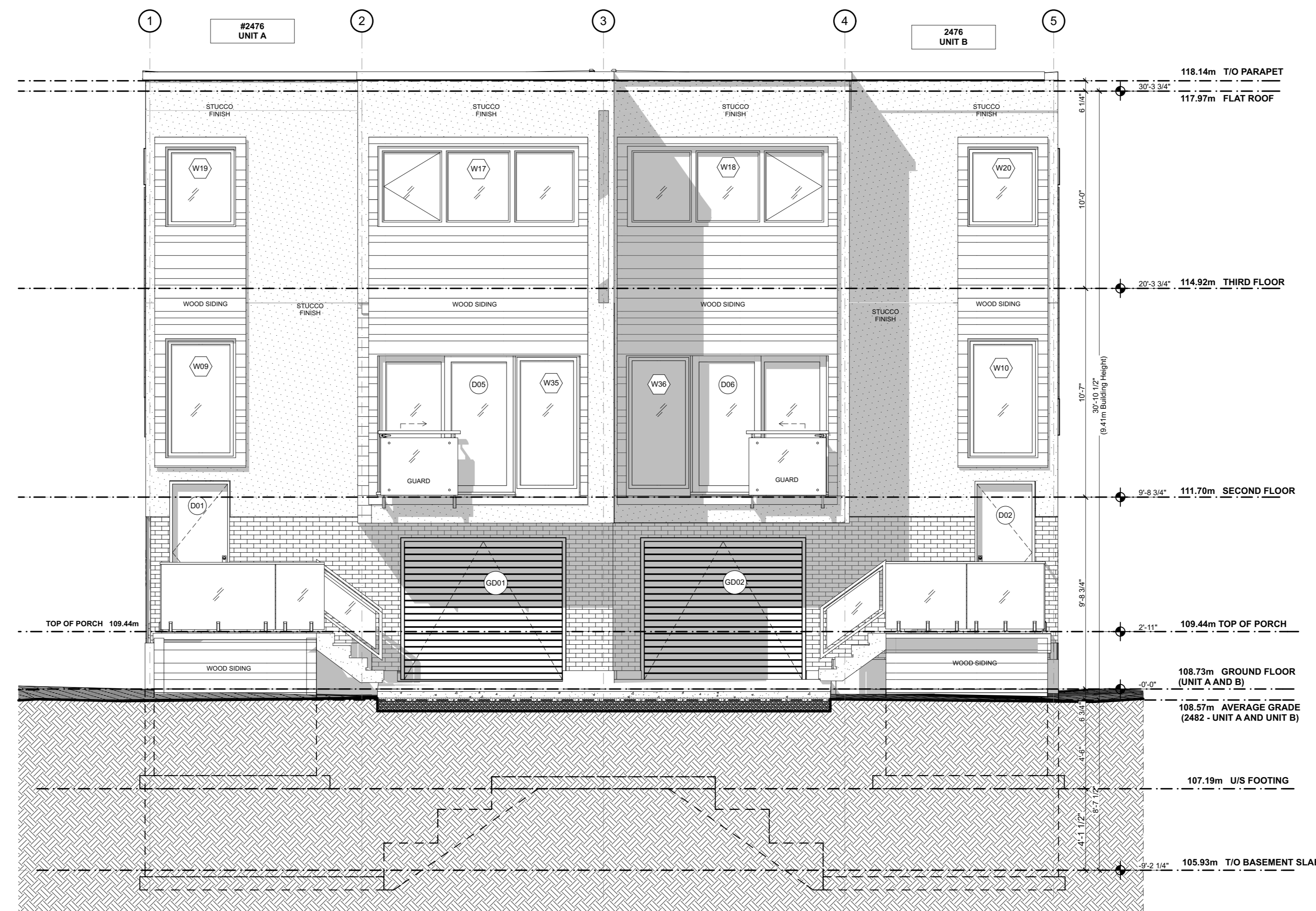
2 Front Elevation - #2476 Facing Dunbar Road SCALE: 1/4" = 1'-0"