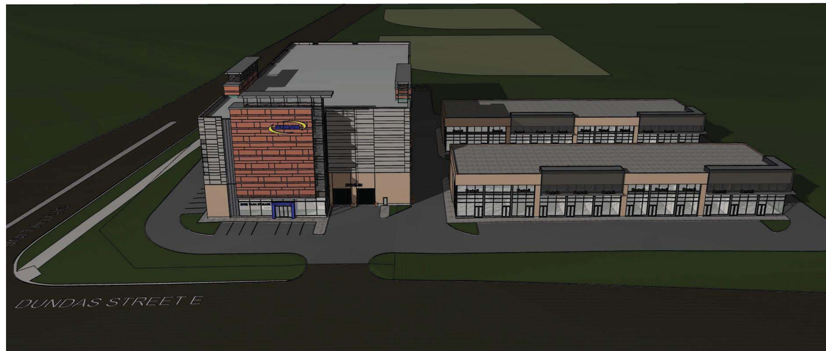
SOUTH ELEVATION AERIAL