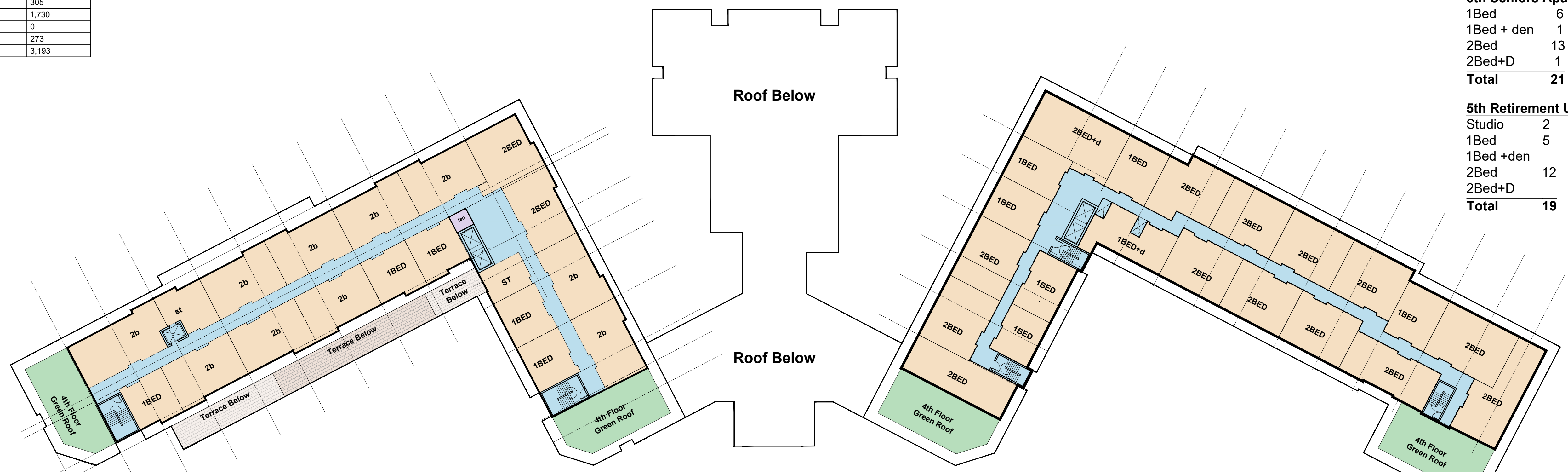
5th Level Retirement Home IL 1,463 sq.m/ Floor