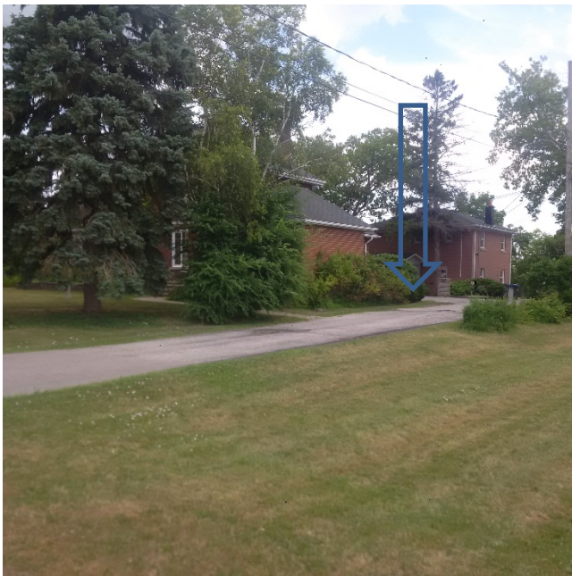
location of former UST, 51 Tannery Street