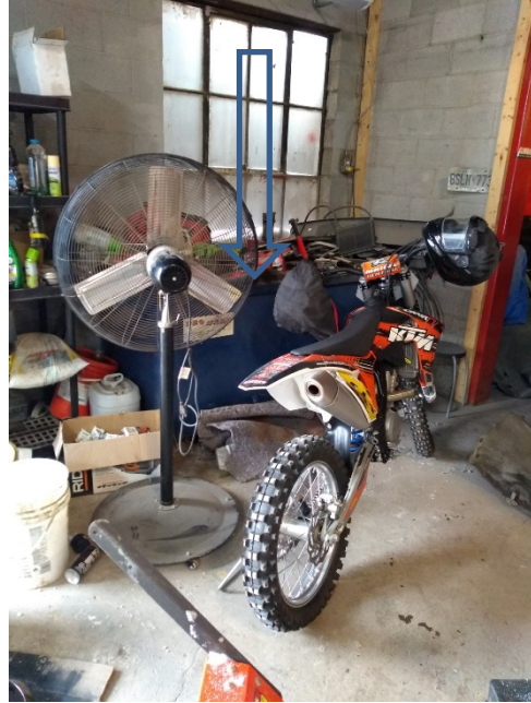
location of AST, Schueller Auto Service