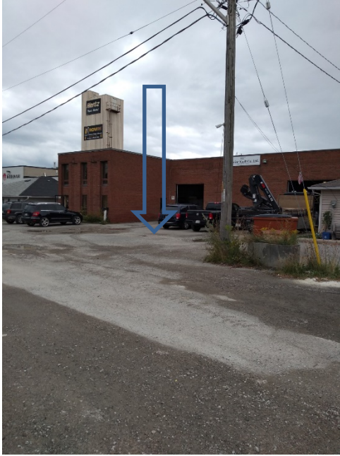
location of two (2) former USTs, 208 Emby Drive south building