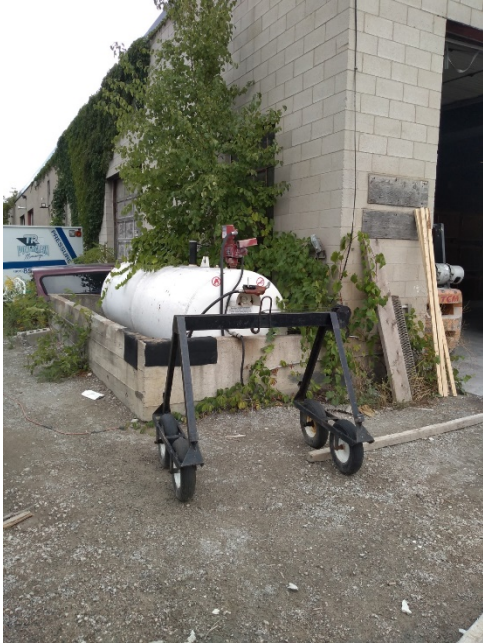
location of AST, Superior Vault Co. Ltd., 208 Emby Drive