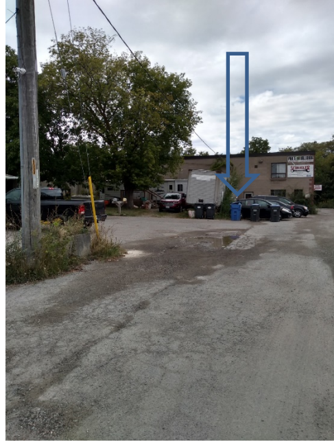
location of former UST, south of 208 Emby Drive north building