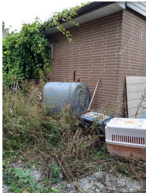
location of AST, dwelling, 208 Emby Drive