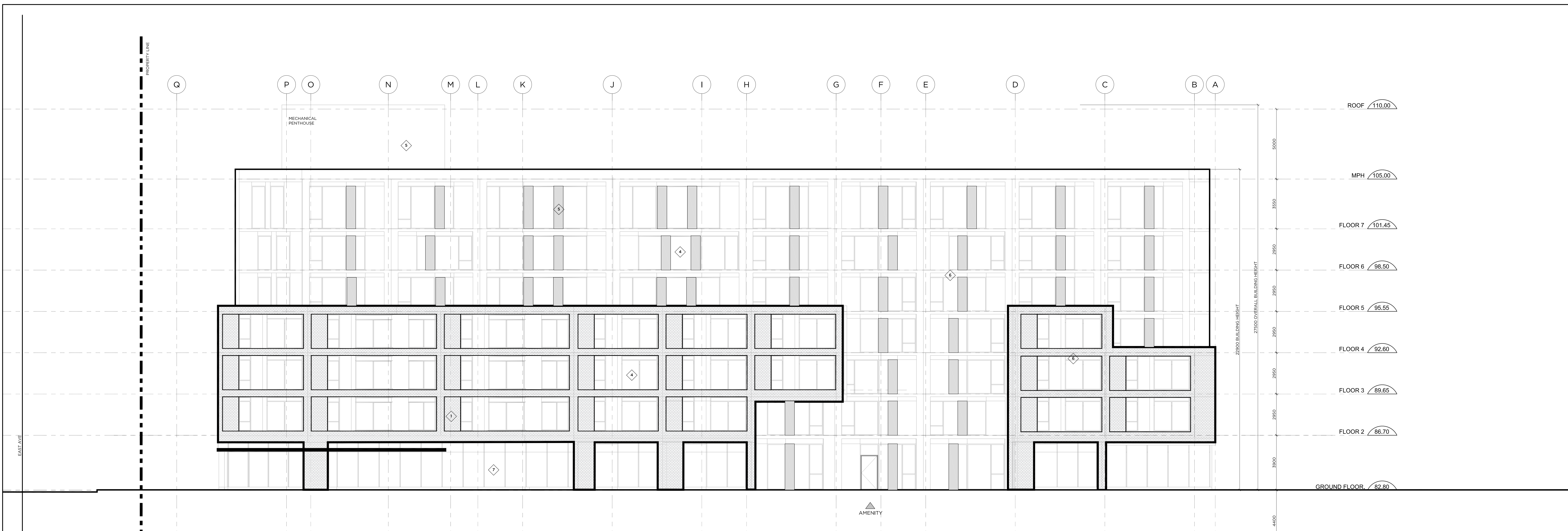
1 NORTH ELEVATION SCALE: 1/100

RAW 405-317 ADELAIDE STREET WEST TORONTO CANADA M5V 1P9 +1 416 538 9728 WWW.RAWDESIGN.CA