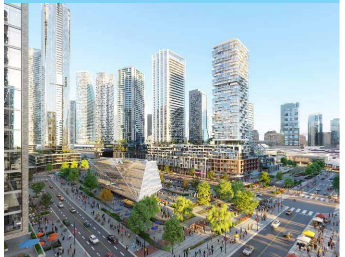
Image courtesy of Oxford Properties Group, used under license. Artistic Rendering may not reflect actual development.

It is important that all federal candidates and political parties understand the importance of building a vibrant downtown transit hub and commit to funding this project should they form government.