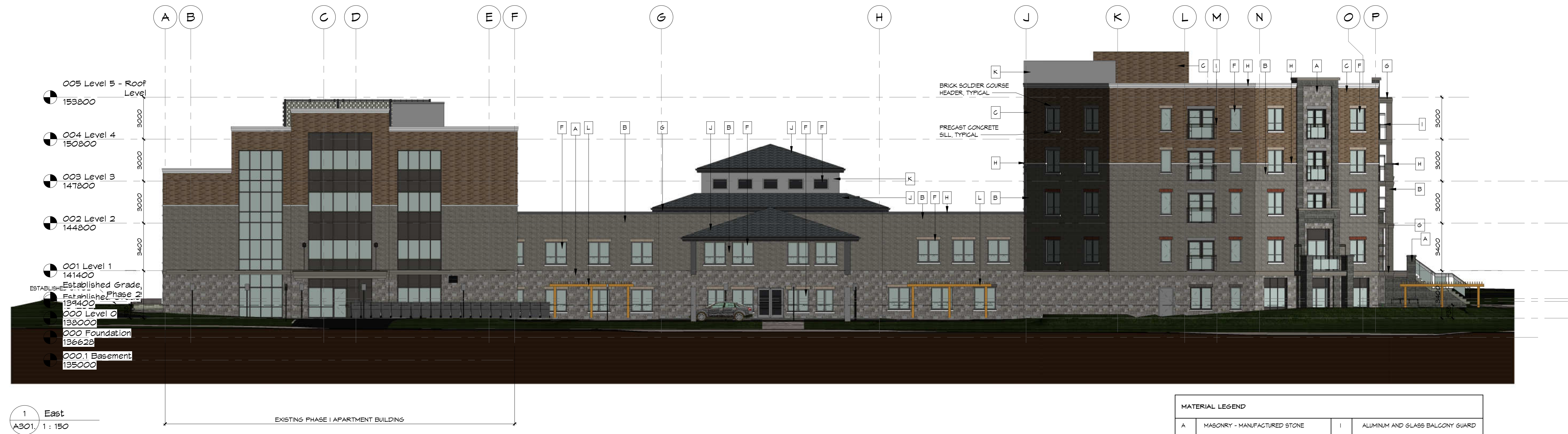
1 East A301, 1:150