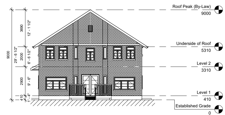
4 West Elevation 1 : 100