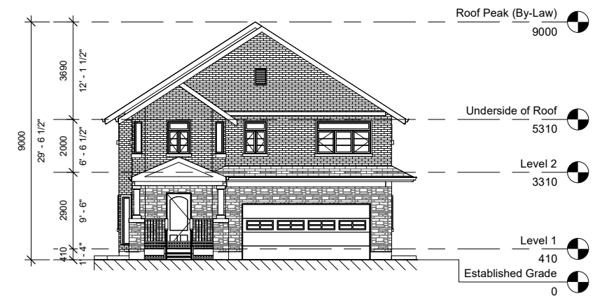
3 East Elevation 1 : 100