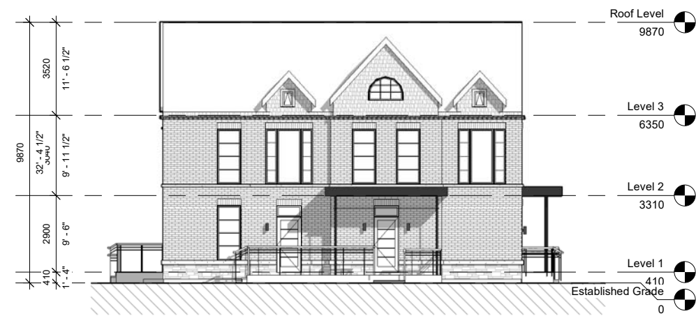
3 BUILDING B EAST ELEVATION 1 : 100