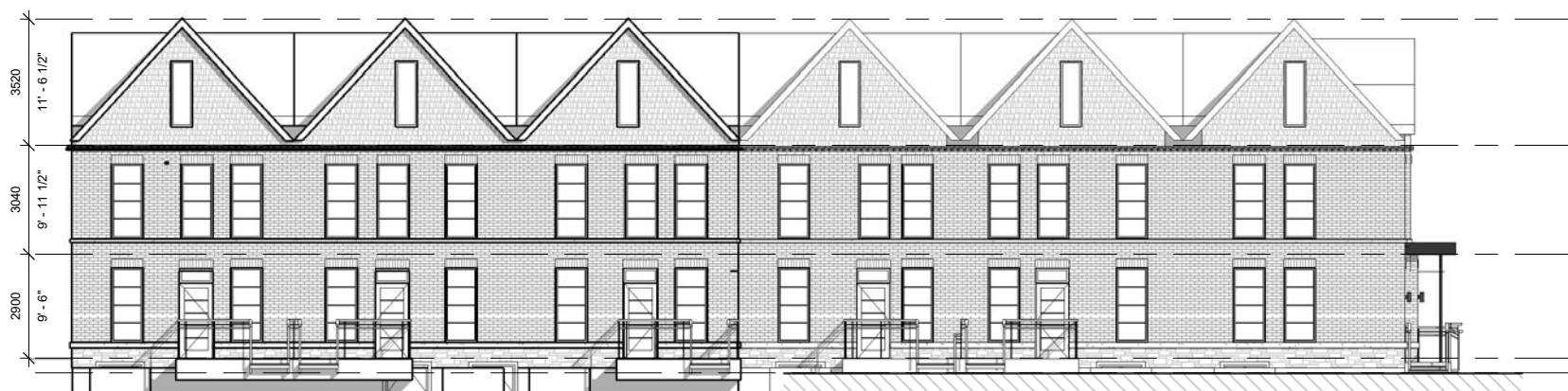
2 BUILDING B SOUTH ELEVATION 1 : 100