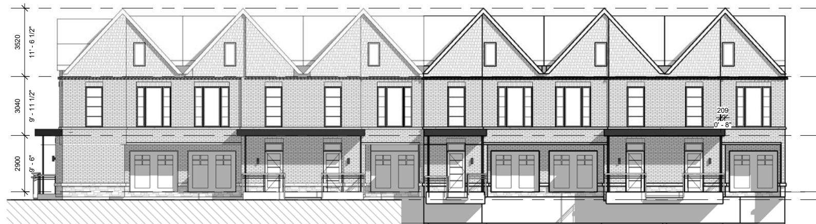
1 BUILDING B NORTH ELEVATION 1 : 100