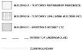
Schedule RA4-XX Map YY

NOTES: ALL MEASUREMENTS ARE IN METRES AND ARE MINIMUM SETBACKS, UNLESS OTHERWISE NOTED. THIS IS NOT A PLAN OF SURVEY