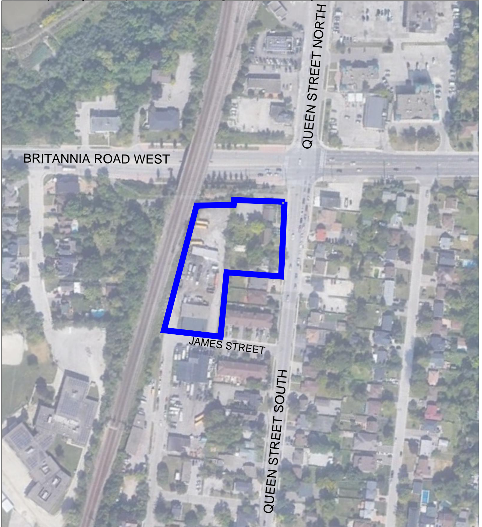
FIGURE 1 SITE CONTEXT PLAN

6, 10, 12 Queen Street West, 16 James Street, 2 William Street South Part of William Street City of Mississauga, Regional Municipality of Peel