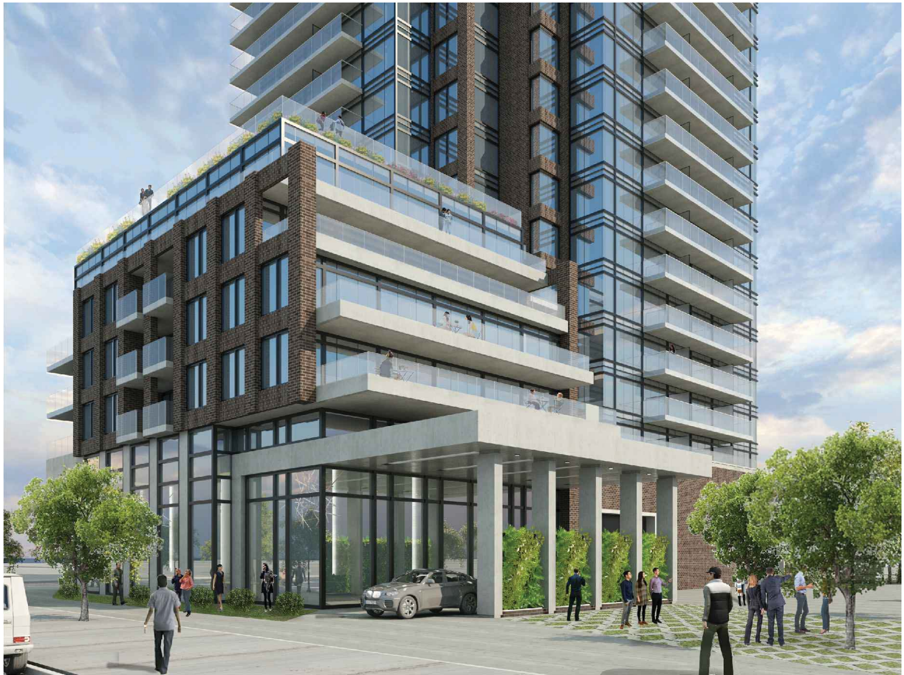
PERSPECTIVE FROM ELMWOOD AVE