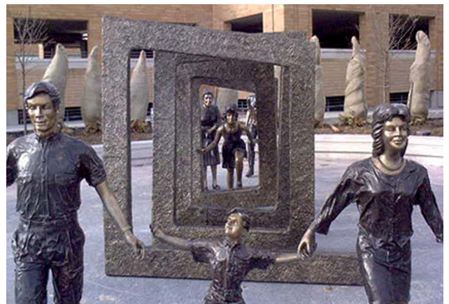
Figure 7-10: Public art is created for specific sites, responding to a series of conditions, including built forms and elements, landscaping, historical events and cultural and community identities, and interpreting contemporary life. Public art contributes appreciably to the experience of urban space, making it a rich and engaging environment. Many areas around the city include pieces of public art, including the Credit Valley Hospital.

7.5.4 At the discretion of the City, municipal parking facilities may be used to meet or reduce the parking requirements for cultural facilities where it does not