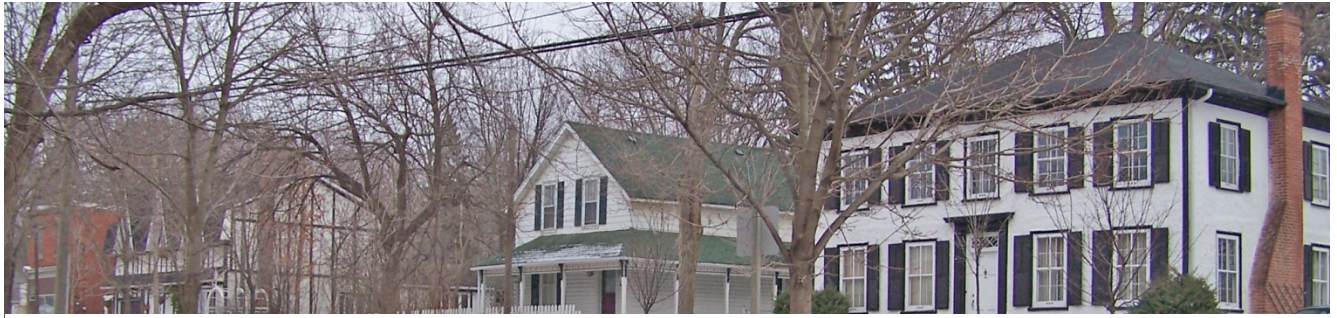
Figure 7-7: Heritage Conservation Districts enable the City to manage and guide change through the adoption of a plan and guideline for the conservation, protection and enhancement of each area's special character. Meadowvale Village, at Old Derry and Second Line roads, is a historic community within the modern City of Mississauga. The City recognized the significance of Meadowvale Village in 1980 by designating it a Heritage Conservation District pursuant to the Ontario Heritage Act , the first designated in Ontario. More recently, Port Credit Village was designated a Heritage Conservation District in 2004.

7.4.1.13 Cultural heritage resources must be maintained in situ and in a manner that prevents deterioration and protects the heritage qualities of the resource.