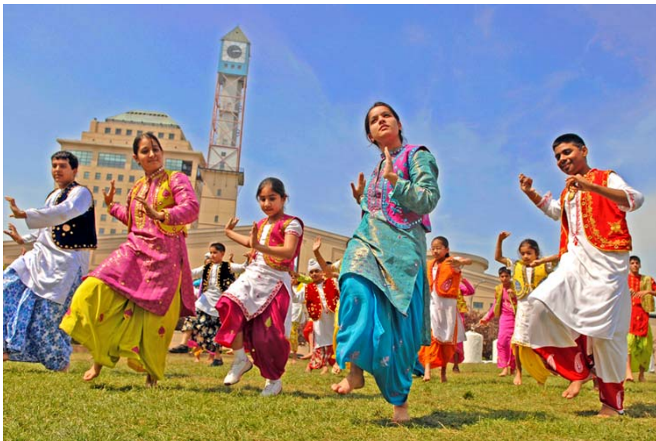
Figure 7-11: My Mississauga events have become a major attraction in the Downtown. A number of free events including cultural shows and dances, concerts and community festivals are held each summer. These events help promote arts and culture in the city and reach a broad audience, from youth to older adults of various backgrounds.

As development of existing communities proceeds, Mississauga will ensure the distinct character of existing areas, including their natural heritage features, cultural heritage, built heritage and archaeological resources are preserved and enhanced for present and future generations.