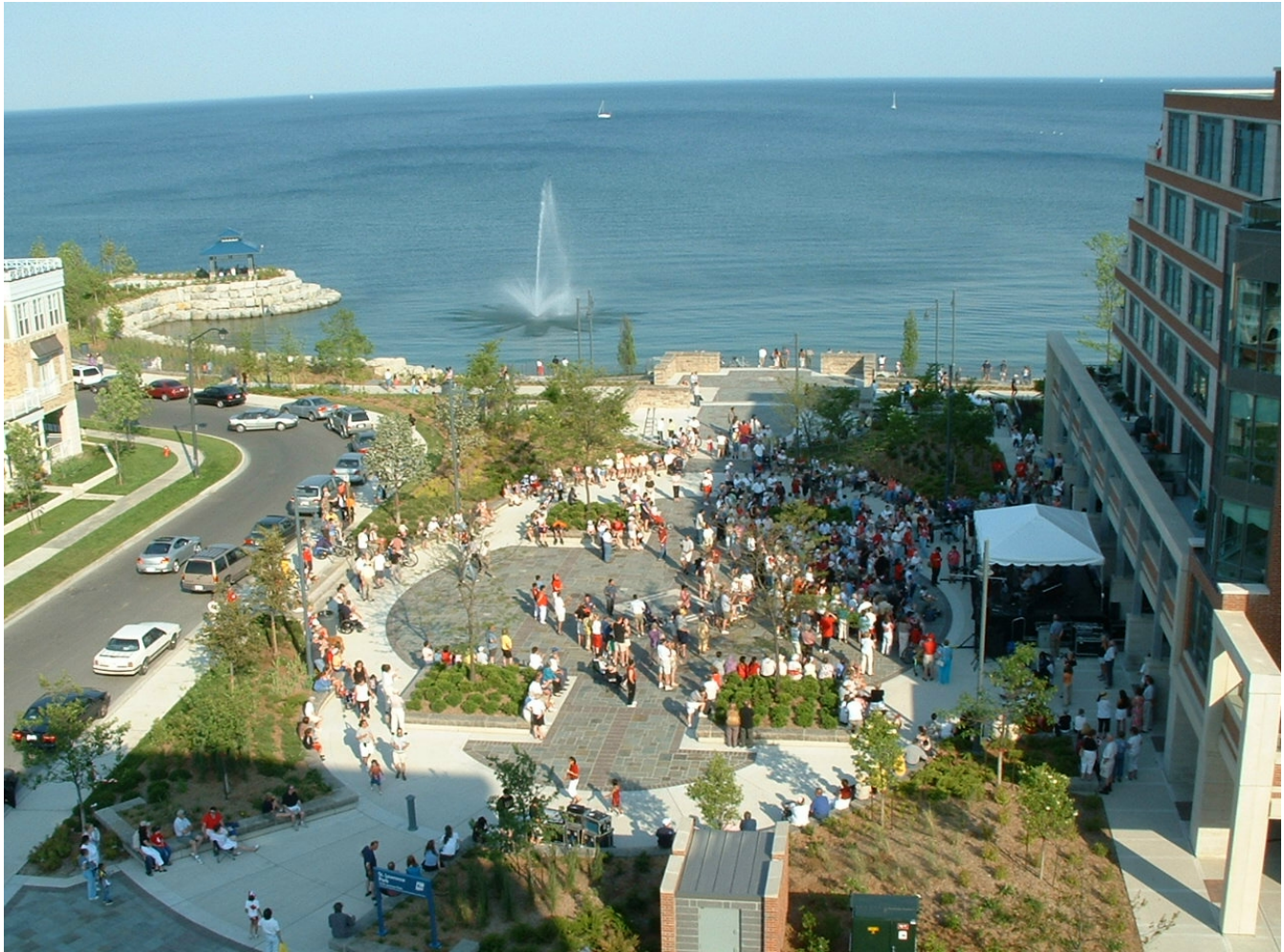
Figure 7-13: Mississauga is located on the Lake Ontario shoreline. The waterfront contains a number of natural areas and public spaces that are major destinations within the city.

The Mississauga waterfront communities encompass all or portions of the Southdown, Clarkson-Lorne Park, Port Credit and Lakeview Character Areas. These communities have a strong orientation to the waterfront and their identity is associated with their historic relationship to Lake Ontario. Maintaining and strengthening these relationships will be a factor in planning decisions affecting these communities.