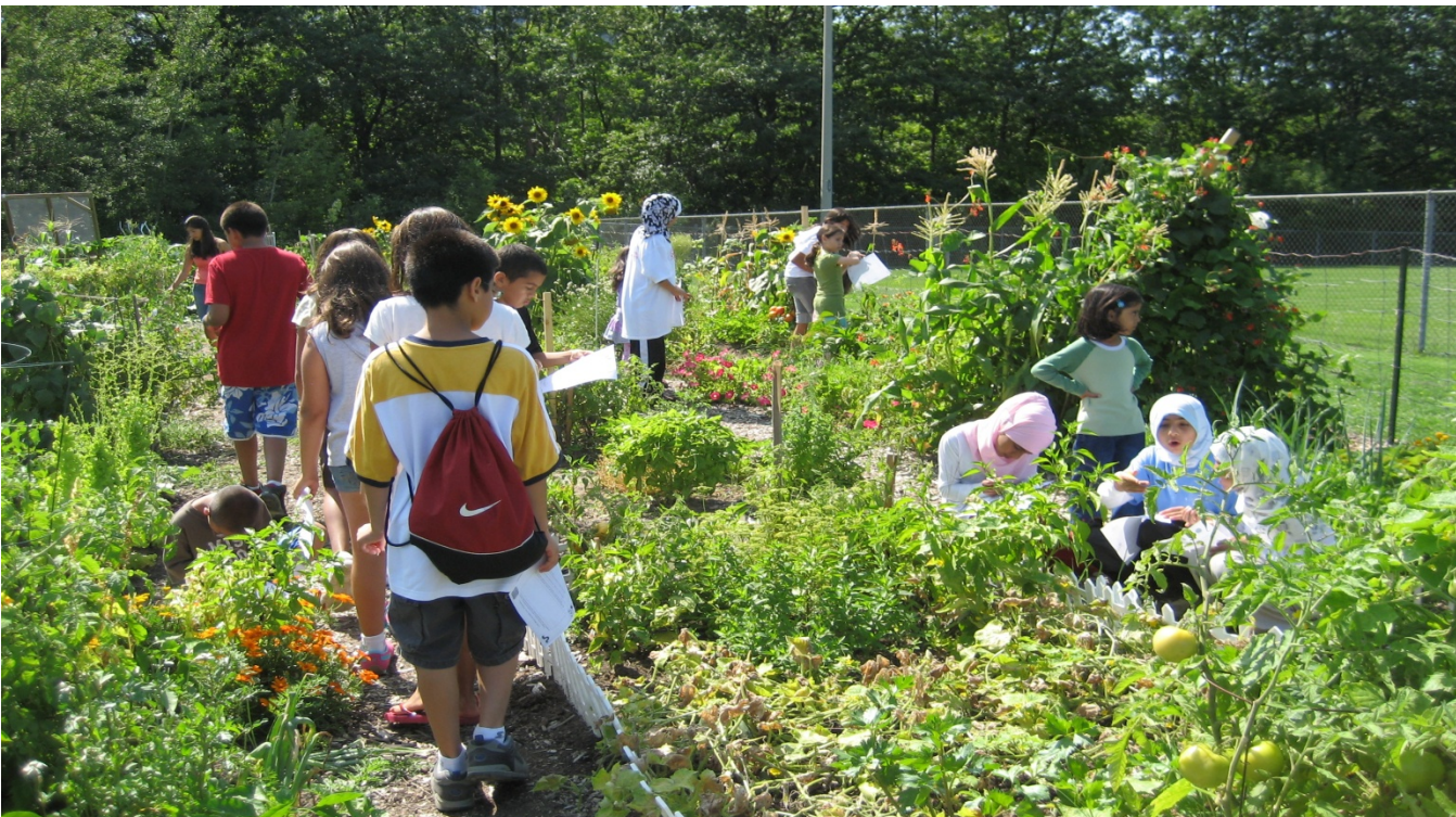
Figure 7-15: The Garden of the Valley, located in the Mississauga Valleys Character Area, is a community garden. It includes plots that can be rented and community plots that are gardened by volunteers. Each plot is approximately 3.0 m x 1.2 m and is gardened organically without the use of any pesticides, herbicides or chemical fertilizers. The gardens provide residents, with not only the opportunity to grow plants and vegetables, but also to socialize and network.

7.7.2 Farmers' markets will be encouraged particularly in Intensification Areas.