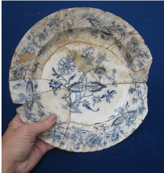
Figure 7-8: An excavation was conducted in 1972 at the original location of the Cherry Hill house at the northwest corner of Cawthra Road and Pinkney Drive. After a subsequent excavation of the site, a collection of 30,000 artifacts including glass, ceramics, pottery, metal, bone and miscellaneous material was discovered and in 1986 the collection was turned over to the Bradley Museum. One of the findings includes the china plate pictured above called Spero; the pattern is dated between 1886 and 1891.

The city's human history spans thousands of years and is reflected through physical remains that have been left behind by individuals or groups of people. These physical remains are archaeological resources and can be found lying on top of the ground, buried in the earth or under water.