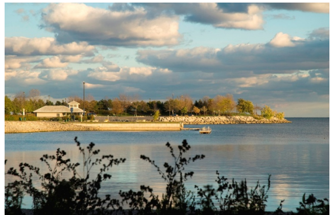
Figure 7-14: Lakefront Promenade is located on the Lake Ontario shoreline and is a major destination park.