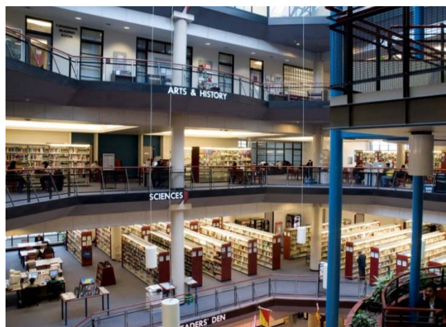
Figure 7-4: Community infrastructure provides valuable services to all members of the community including public schools, private schools, emergency services, private clubs, community facilities, daycare/day programs and places of religious assembly. The City provides high quality services at state of the art facilities.