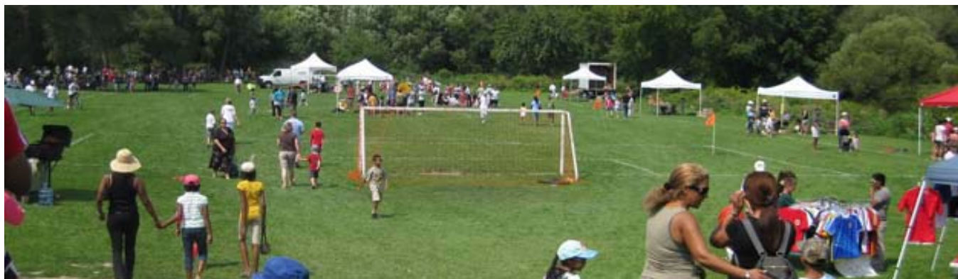
Figure 7-2: Mississauga is home to residents of all ages. Mississauga Official Plan's policies are intended to foster vibrant and complete communities that will enable all residents to thrive.