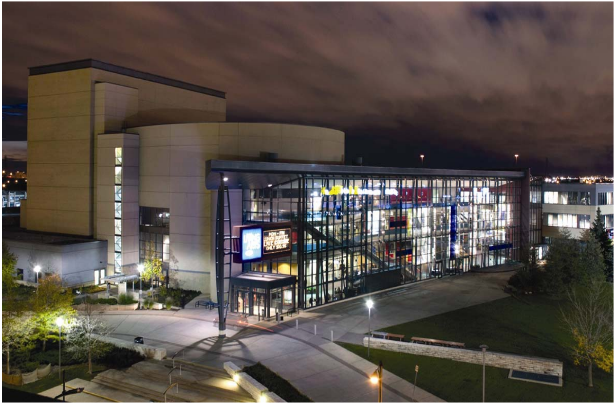
Figure 7-9: The Living Arts Centre (LAC) opened its doors on October 7, 1997, adding an exciting cultural dimension to Mississauga's Downtown. Serving as an important resource for the arts, education and business, LAC features over 225,000 square feet of multiple performance venues, studio spaces and exhibition display areas. The LAC is a valued cultural resource that benefits the community.