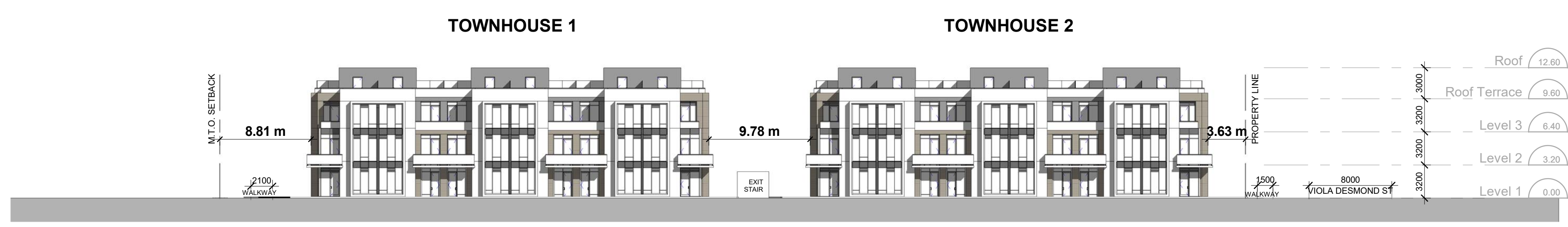
Townhouse Elevation 3 Scale: 1 : 300 dA3.2