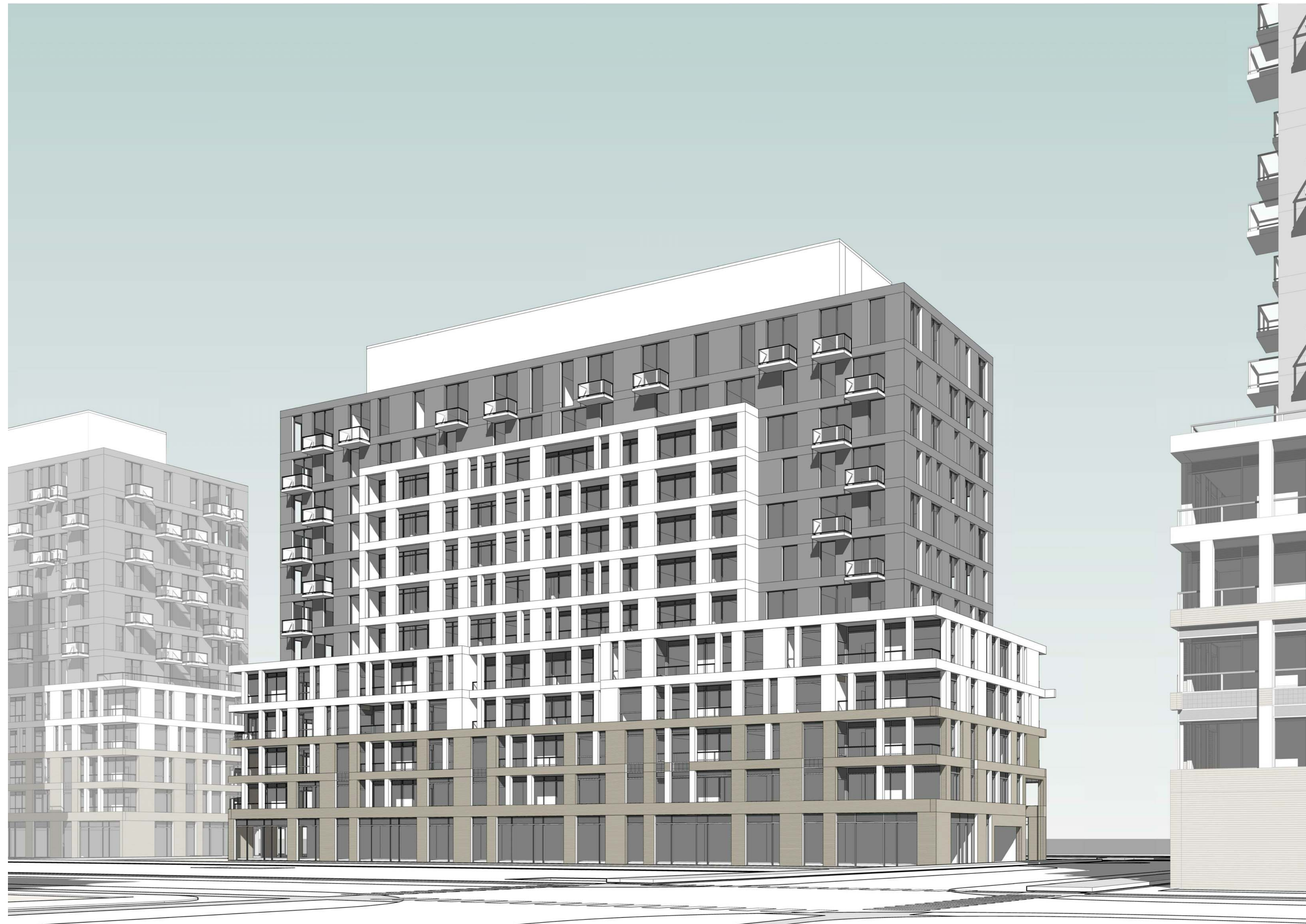
Building "B" Perspective 2 dA6.3