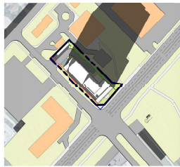
DEC 14 12:17 PM 1:1600