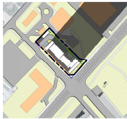
DEC 16 12:17 PM 1:1600