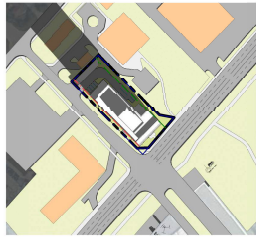
DEC 8 9:24 AM 1:1600