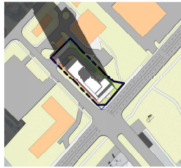
DEC 9 10:17 AM 1:1600