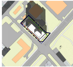
DEC 12 12:17 PM 1:1600