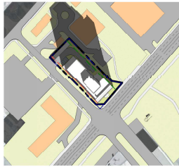
DEC 11 11:17 AM 1:1600