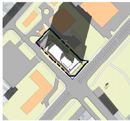
DEC 13 12:17 PM 1:1600