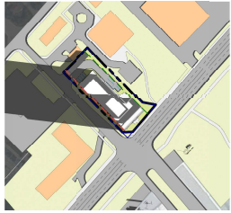
MARCH 705AM 1:1800