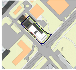
MARCH 1012AM 1:1800