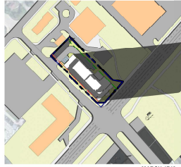
MARCH 1748 1:1800