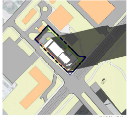
MARCH 1712 1:1800