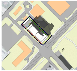
MARCH 1412 1:1800