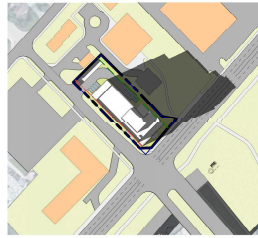
MARCH 1612 1:1800