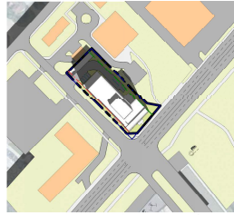
MARCH 1112AM 1:1800