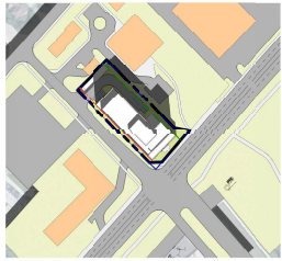
MARCH 1212 1:1800