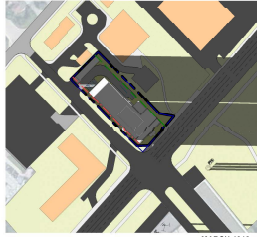
MARCH 1818 1:1800