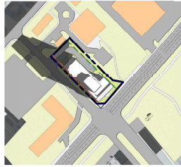
MARCH 835AM 1:1800