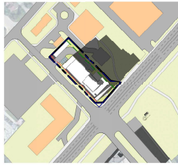
MARCH 1512 1:1800