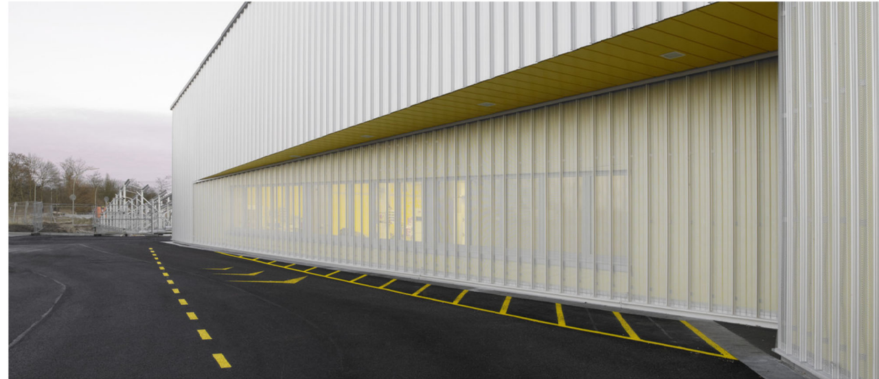
MATERIAL & MASSING CONCEPT REFERENCE IMAGE